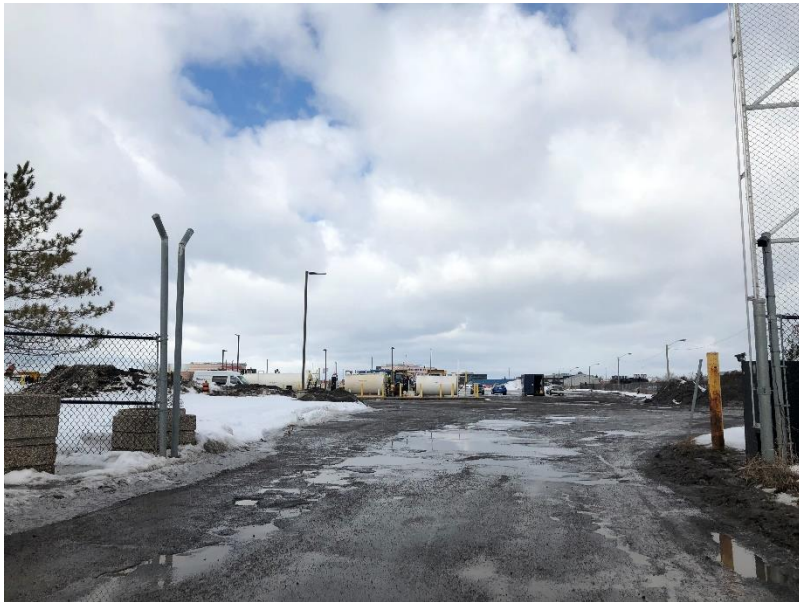
Photo 6 – Fuel ASTs located on the eastern portion of the City of Ottawa Maple Grove Depot.