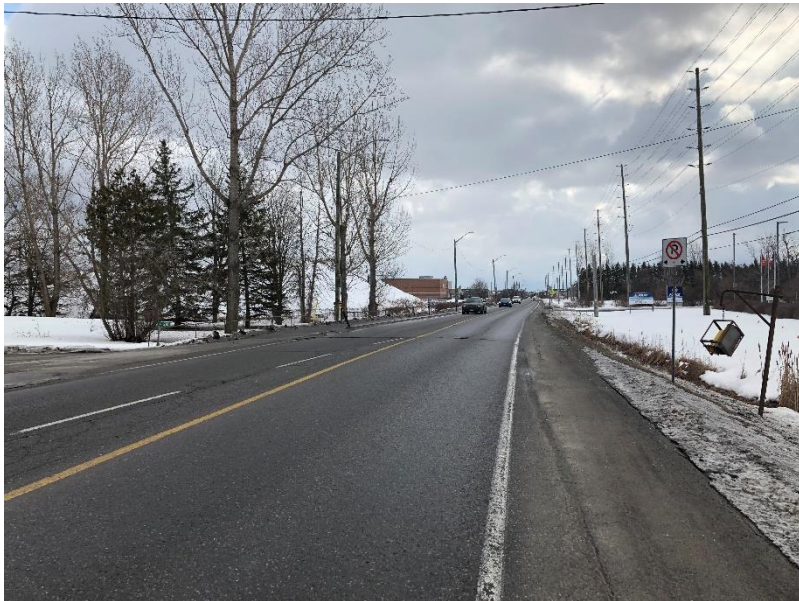
Photo 8 – Looking south the Huntmar Drive located west of the Site.