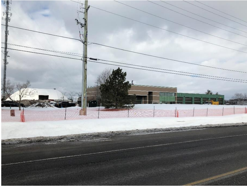
Photo 5 – Photo of the City of Ottawa Maple Grove Depot located on the adjacent east of the Site. The repair garages are visible on the east side of the building.