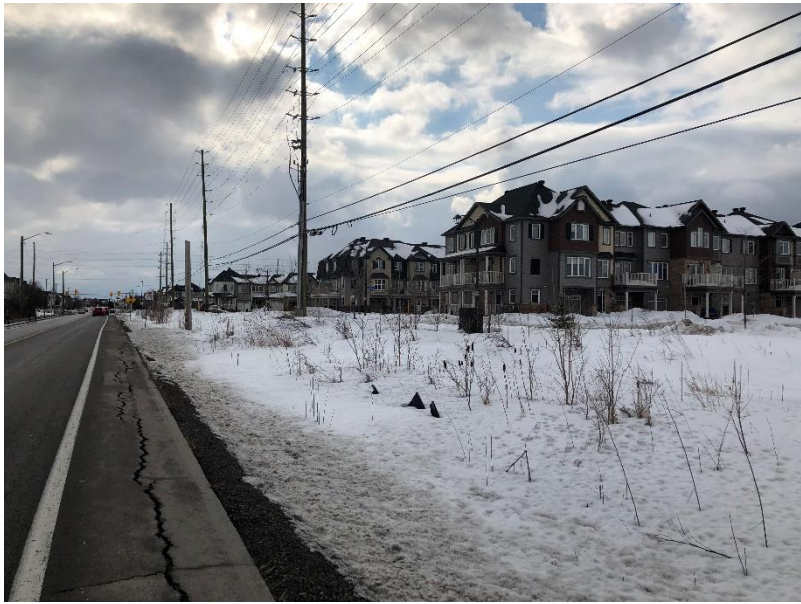
Photo 4 – Looking southeast at Maple Grove Road and residential houses on the surrounding lands south of the Site.