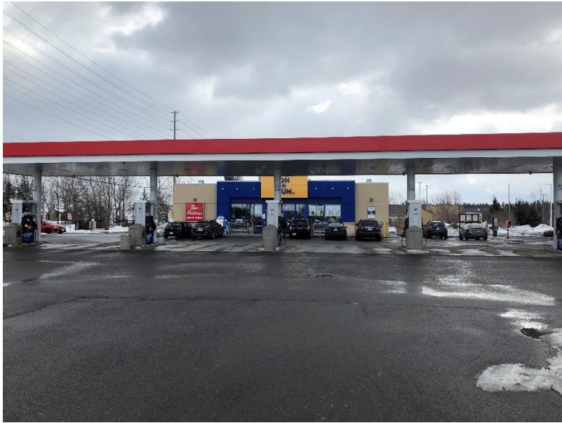
Photo 3 – Photo of the retail fuel outlet located on the surrounding lands northwest of the Site.