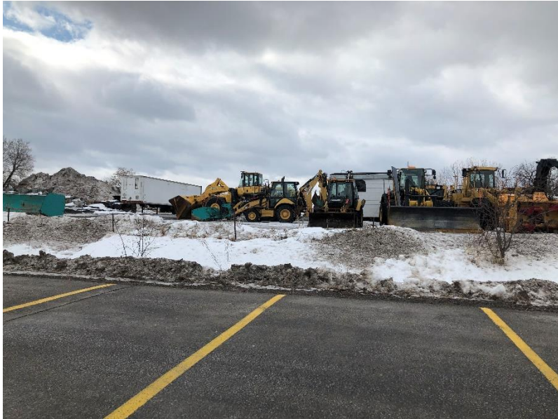
Photo 7 – Construction equipment located on the rear/east of the residential property immediately north of the Site.