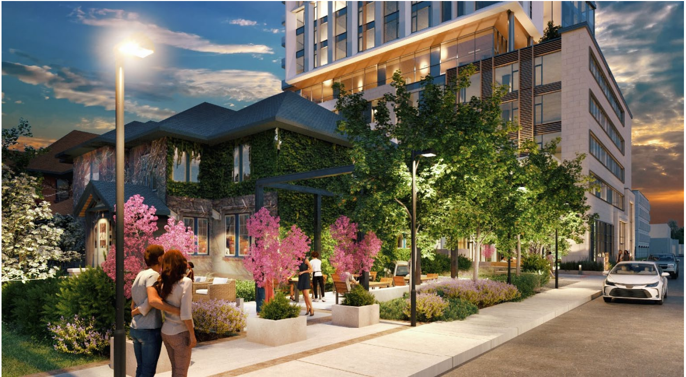
Figure 2: View of Proposed Development from Kent/MacLaren

Several comments were received regarding the desire for tree planting and greening the site. Street trees are proposed within structured soils along Gilmour adjacent to the new podium and significant tree planting and landscaping is proposed between the new tower and 444 MacLaren Street to mark the arrival space and “outdoor foyer” of the proposed building. The existing asphalt areas around 436 and 444 MacLaren Street have been reduced and removed to the extent possible to improve the public realm adjacent to the subject property.