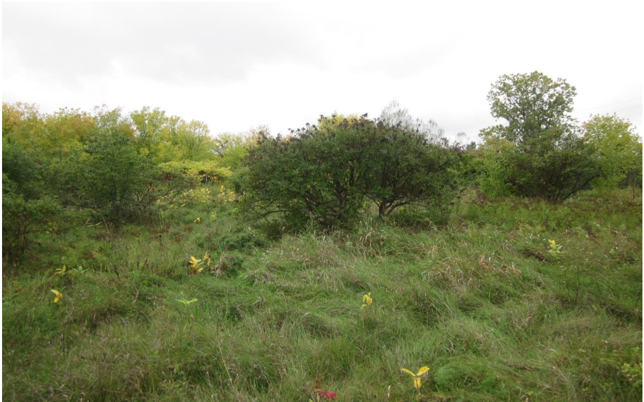
Picture 5. Tree grouping C at 1987 Robertson Road