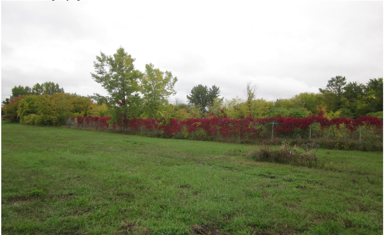
Picture 6. Tree grouping D at 1987 Robertson Road