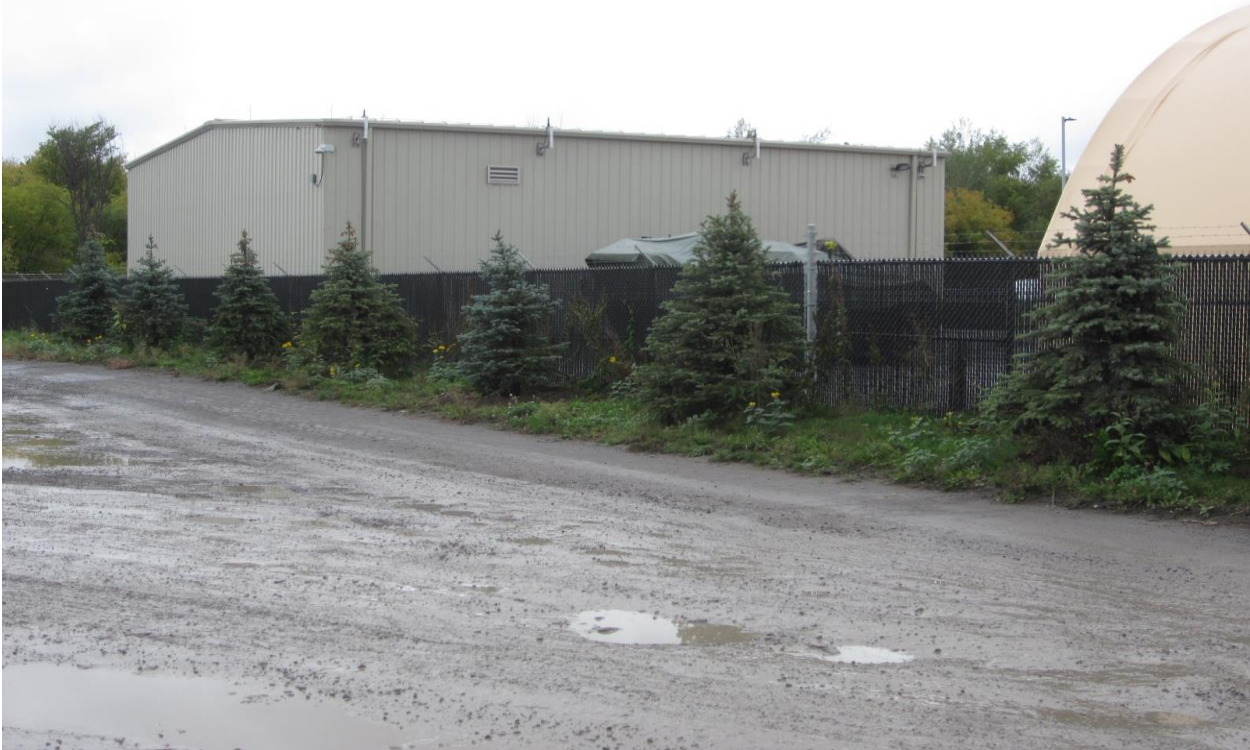
Picture 1. Tree grouping A at 1987 Robertson Road