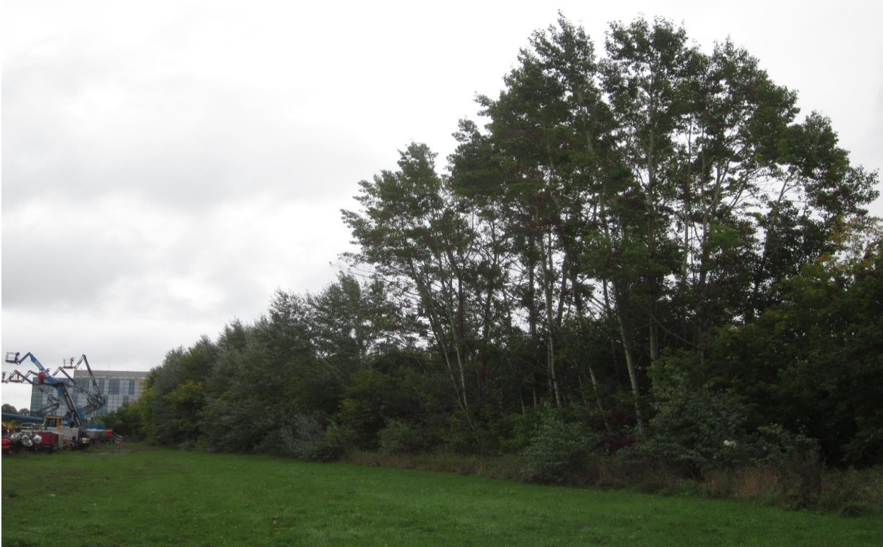
Picture 8. Tree grouping E at 1987 Robertson Road