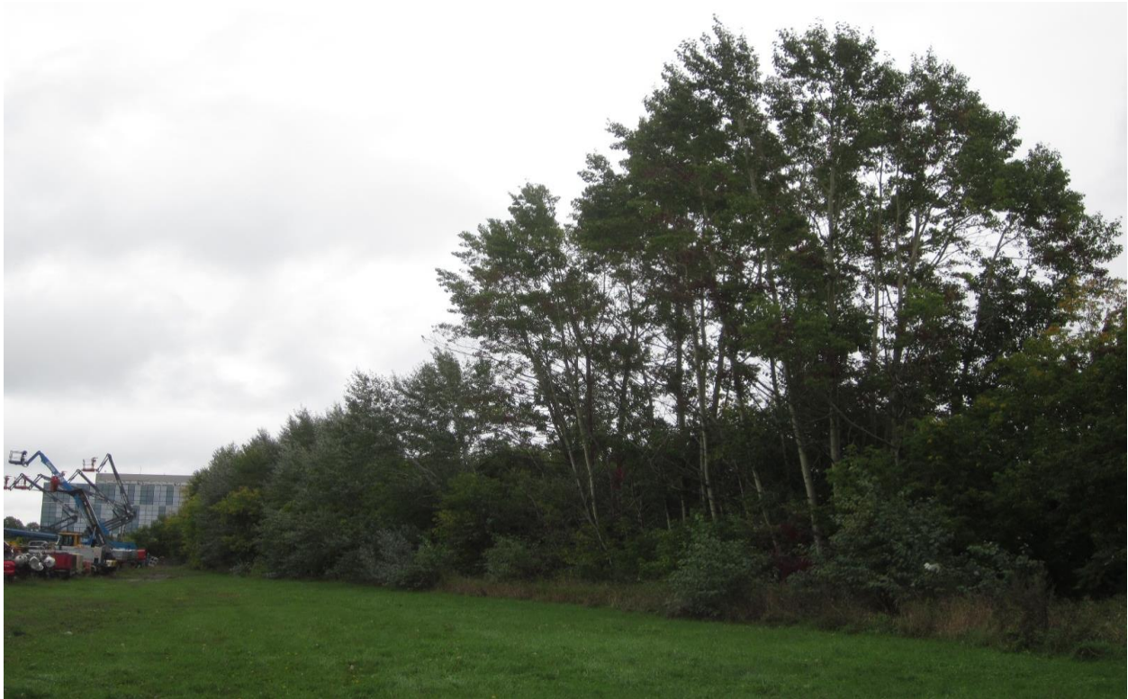
Picture 8. Tree grouping E at 1987 Robertson Road