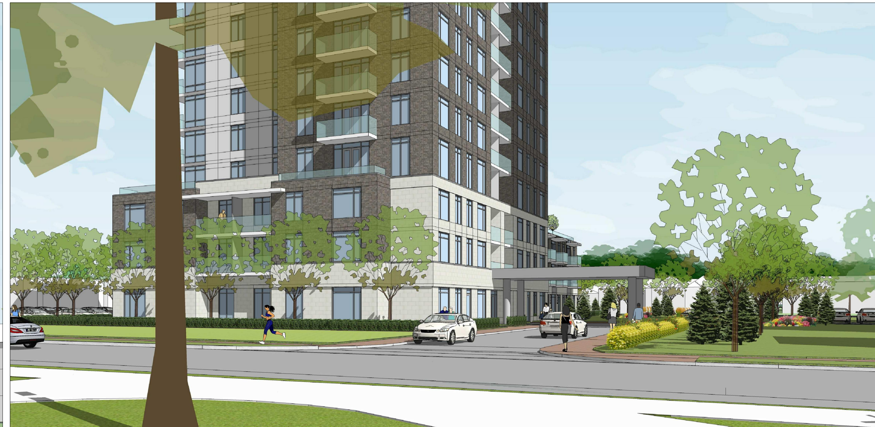
LOOKING NORTHEAST TOWARD THE BUILDING ENTRANCE