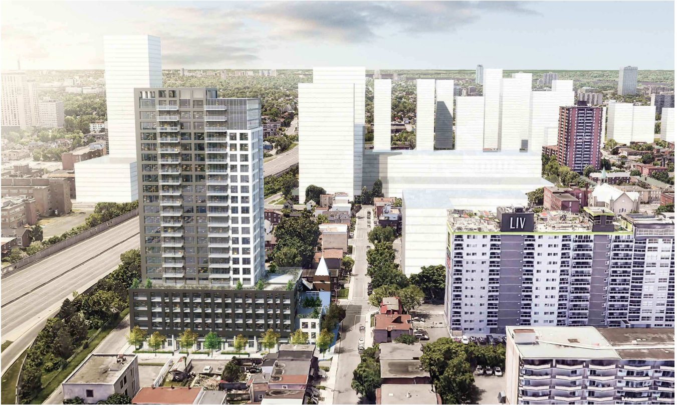
Figure 1: Proposed development with approved and permitted height and massing indicated (white massings in background).