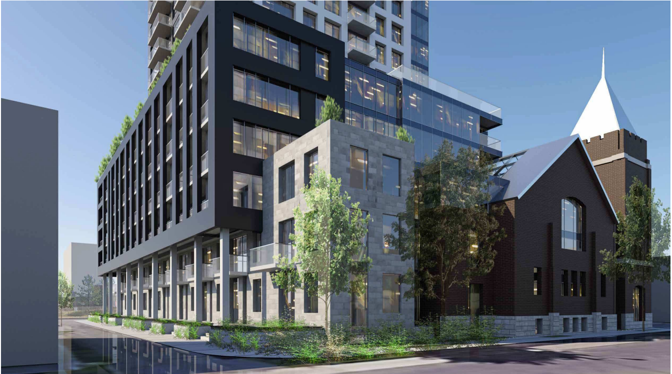
Figure 4 Proposal from Arlington looking down Arthur Lane.

Fotenn has previously successfully established the position that the context of an area, for the purposes of section 3.6.1 (OP 2003) and 6.3.1 (OP 2022), is determined through a neighbourhood/community wide assessment in which the existing and future context is an important clarifying attribute in determining appropriate building massing and heights, and that design and ability to achieve appropriate transition is the determining factor in building heights as opposed to immediately abutting existing heights.