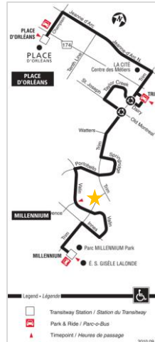
Figure 4. Bus Route

The site is located 3km south of the Queensway (Highway 416/174).