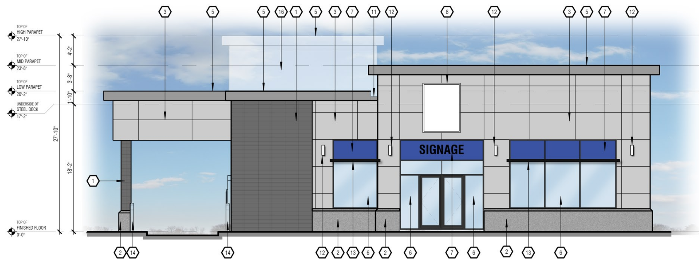
1 SOUTH ELEVATION SK-2 1/8" = 1'-0"