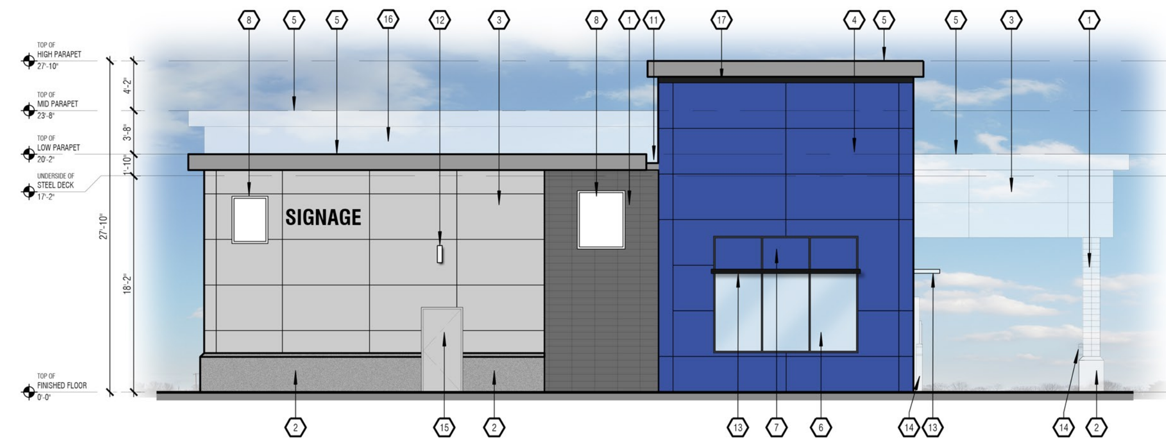
2 NORTH ELEVATION SK-2 1/8" = 1'-0"