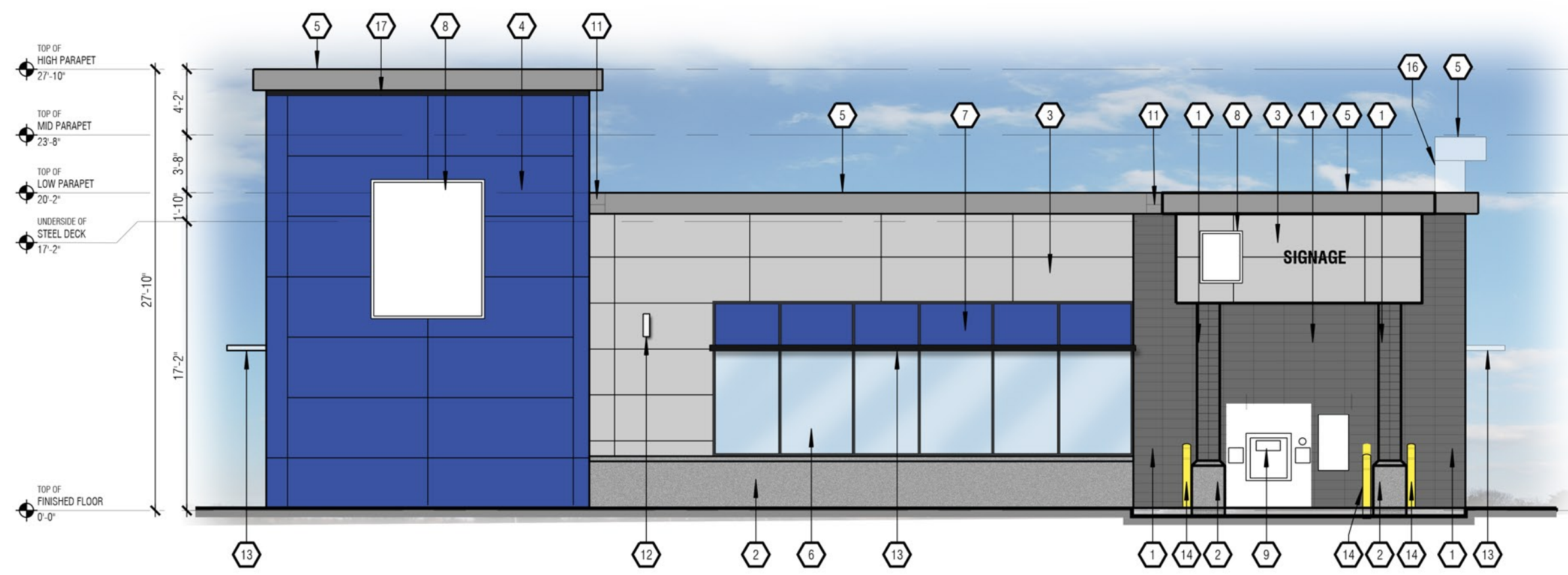
3 WEST ELEVATION SK-2 1/8" = 1'-0"