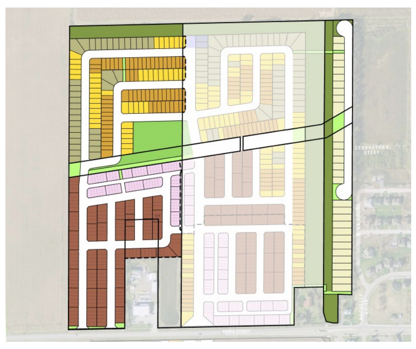
Figure 1: Revised Concept Plan for Green Lands subdivision.

As a result of the Concept Plan changes, the Draft Plan of Subdivision has also been updated to reflect the changes, as shown below in Figure 2.