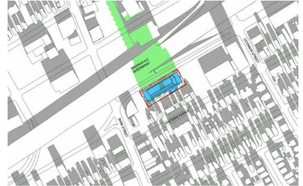
December 21 - 11:18