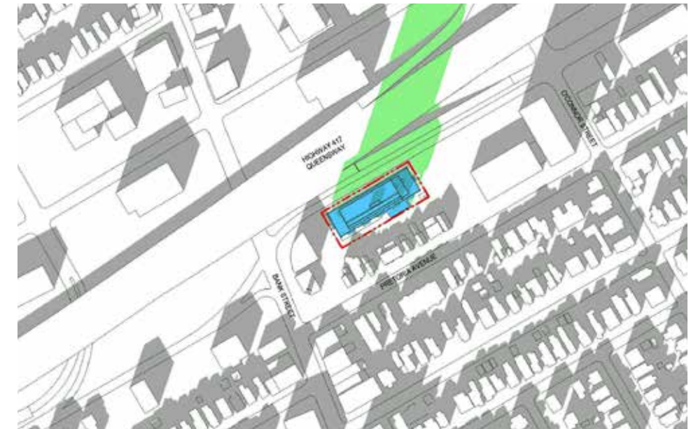
December 21 - 14:18