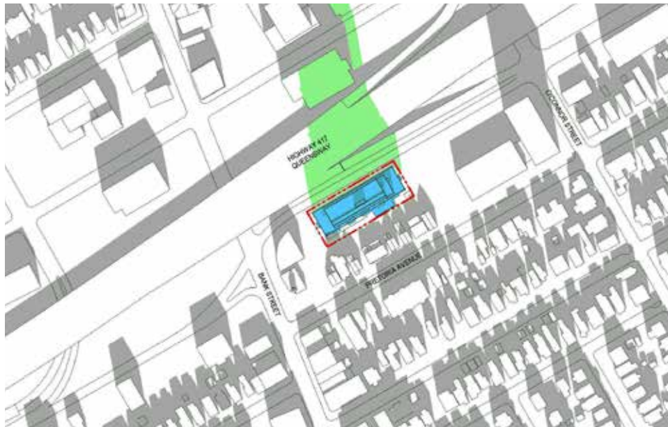
December 21 - 12:18