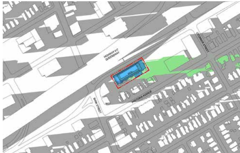
September 21 - 18:18