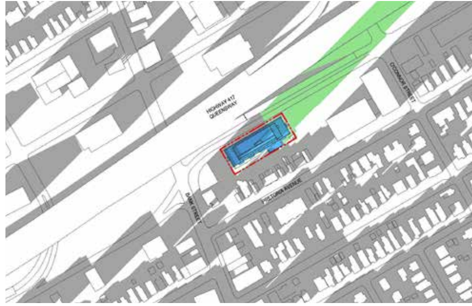
December 21 - 16:18