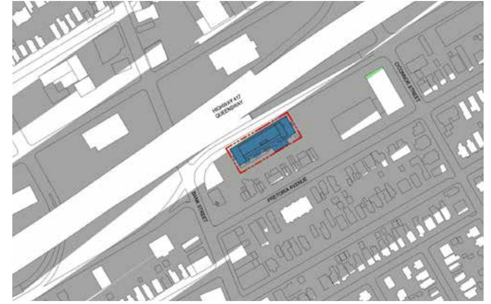
December 21 - 17:18