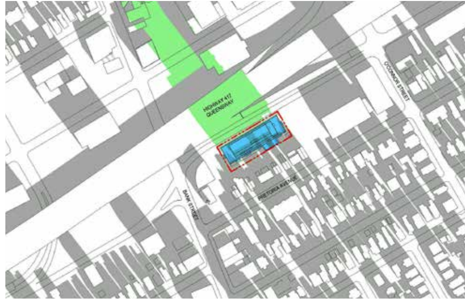
December 21 - 10:18