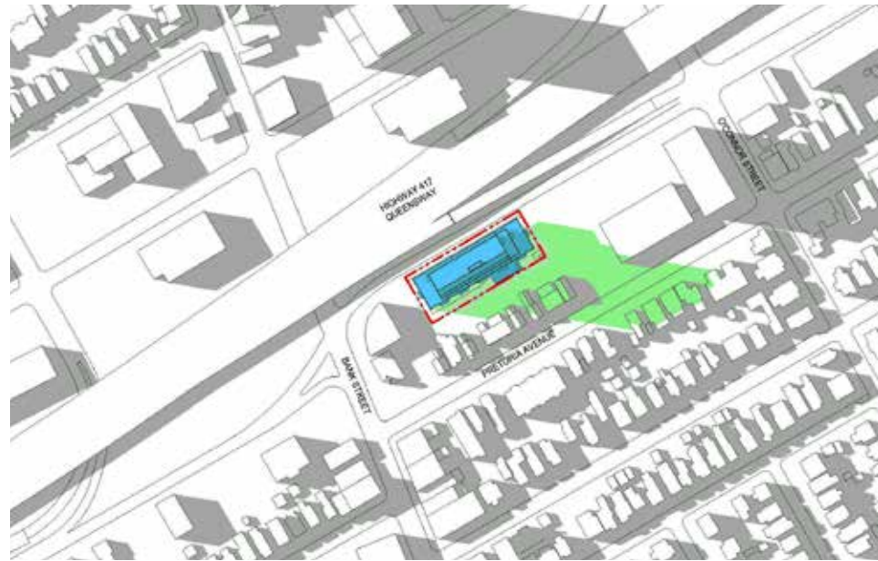
June 21 - 18:18