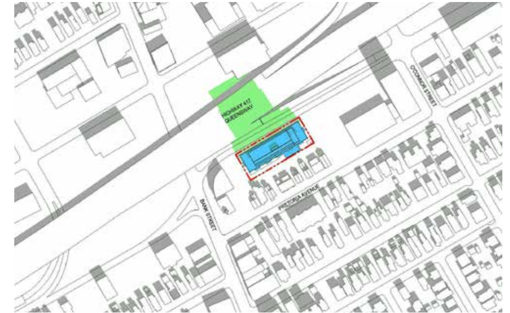
September 21 - 11:18