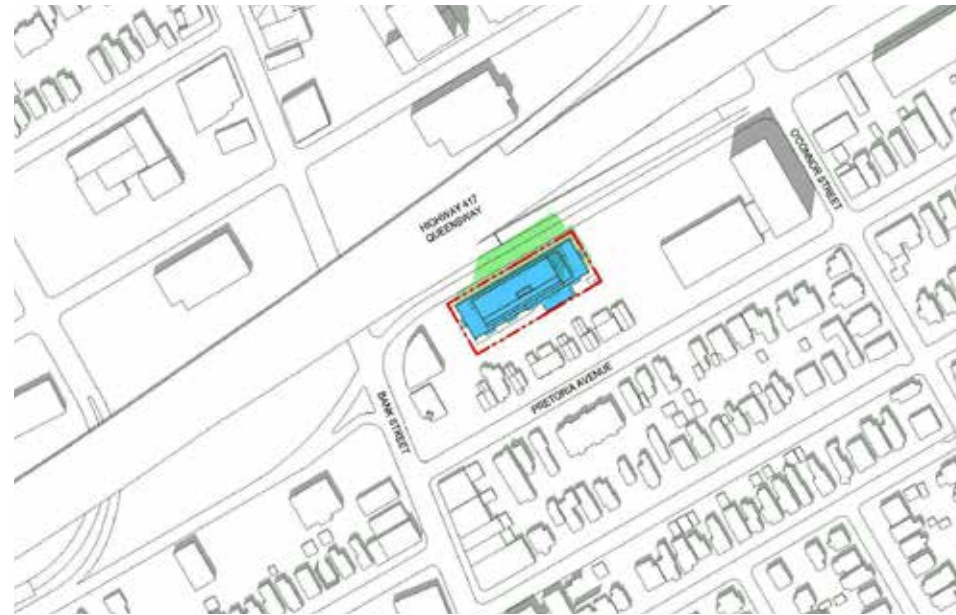
June 21 - 13:18