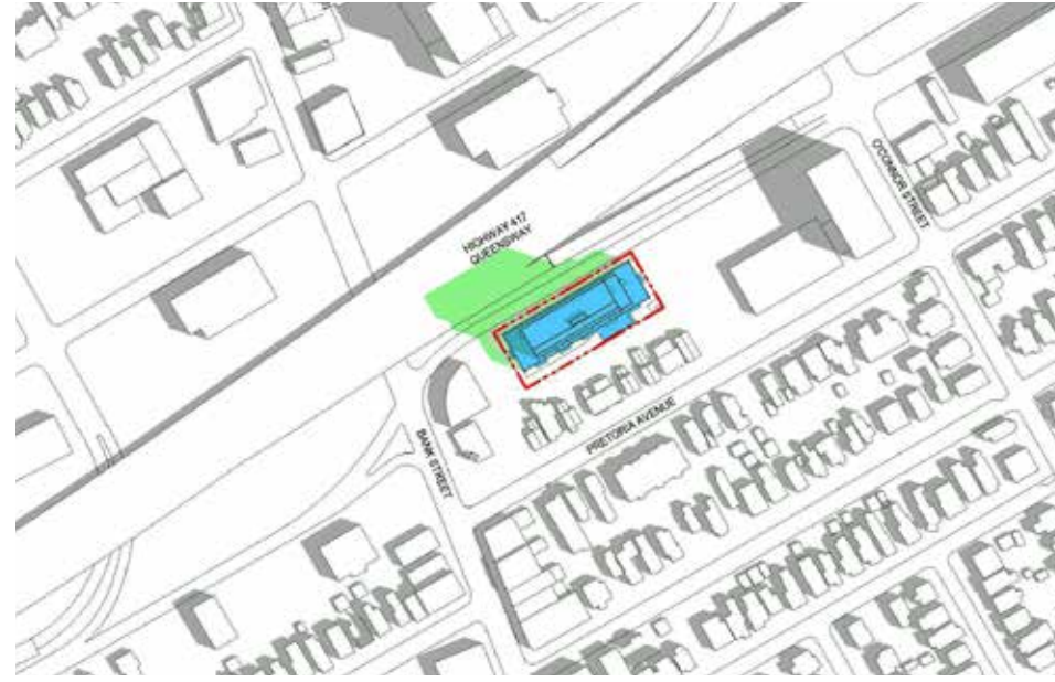
June 21 - 10:18