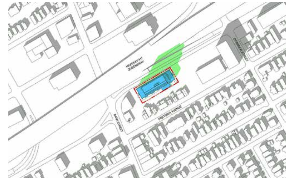
September 21 - 14:18