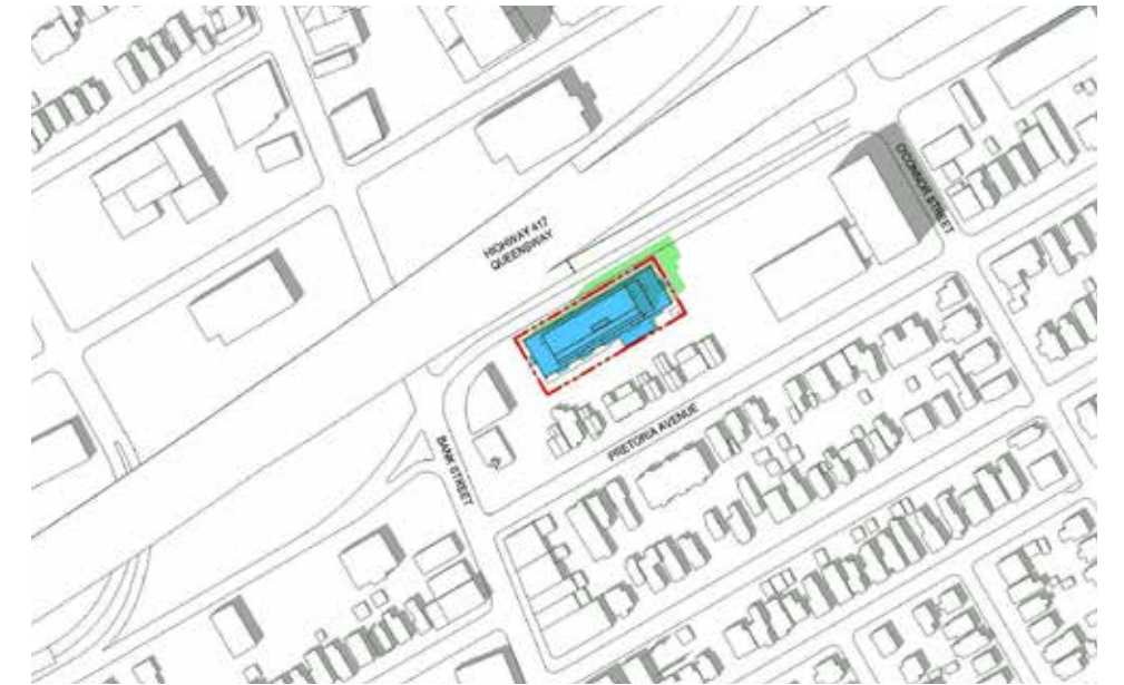
June 21 - 14:18