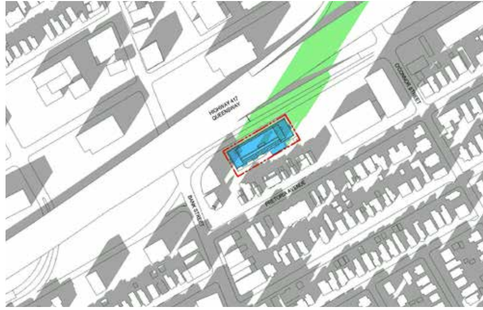
December 21 - 15:18