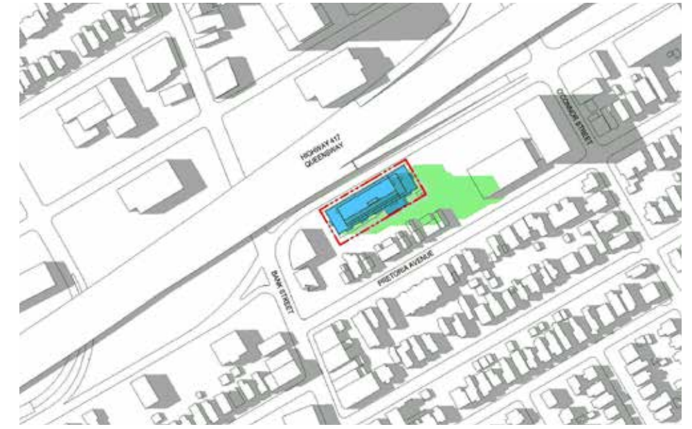
June 21 - 17:18