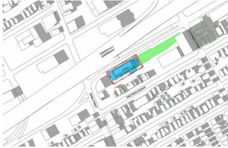
September 21 - 16:18