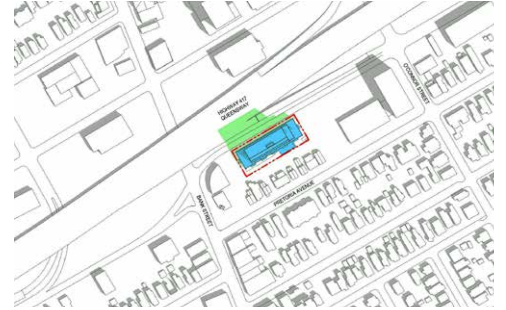
June 21 - 11:18