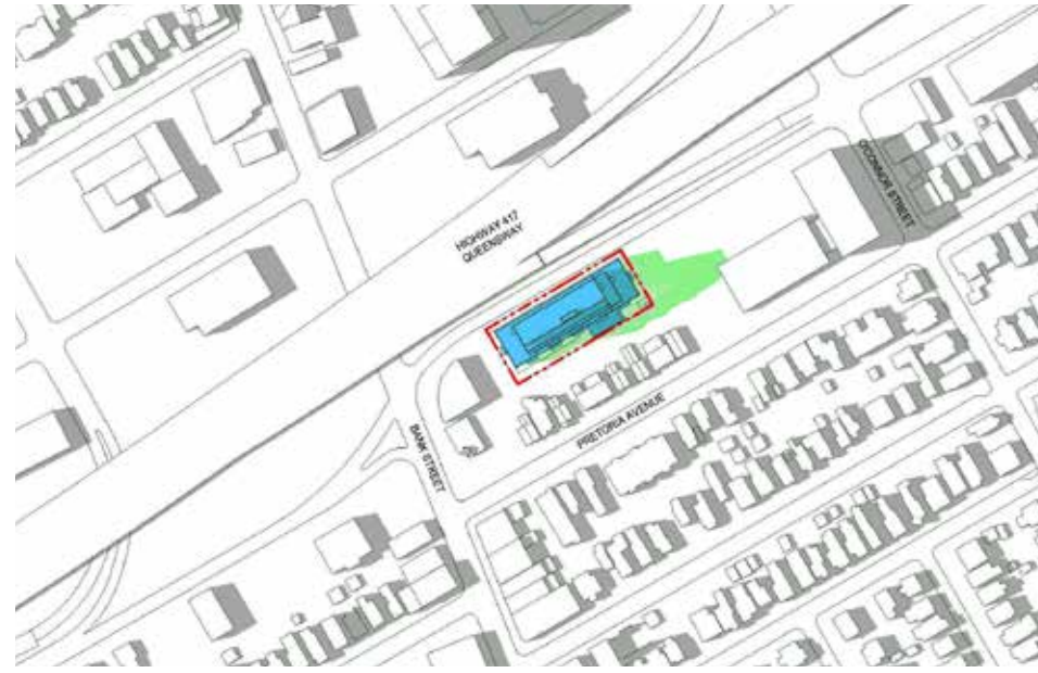
June 21 - 16:18