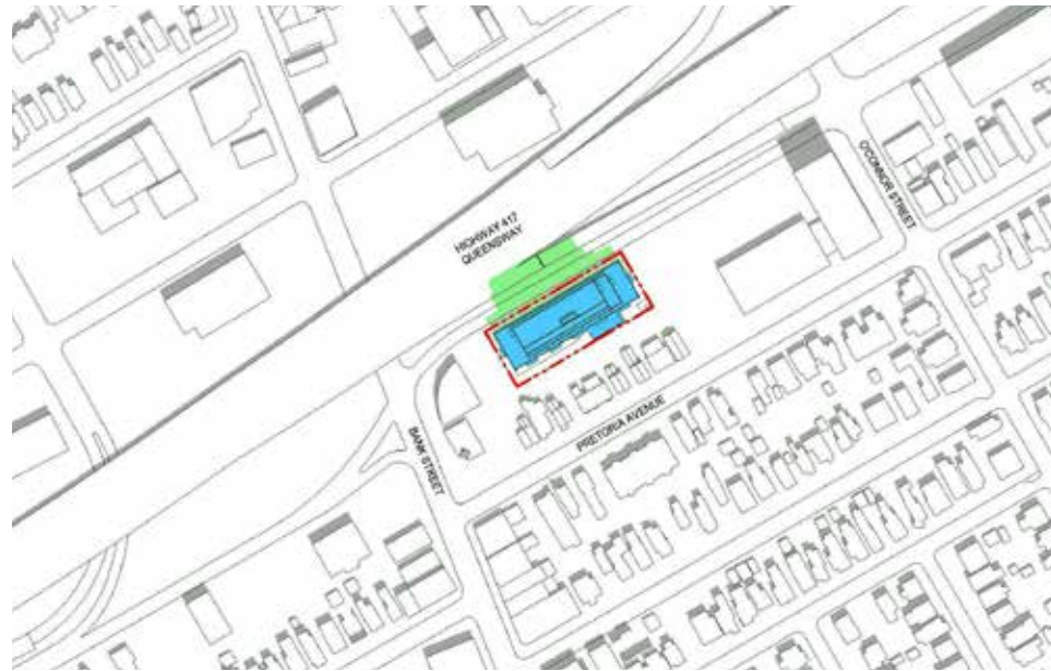
June 21 - 12:18