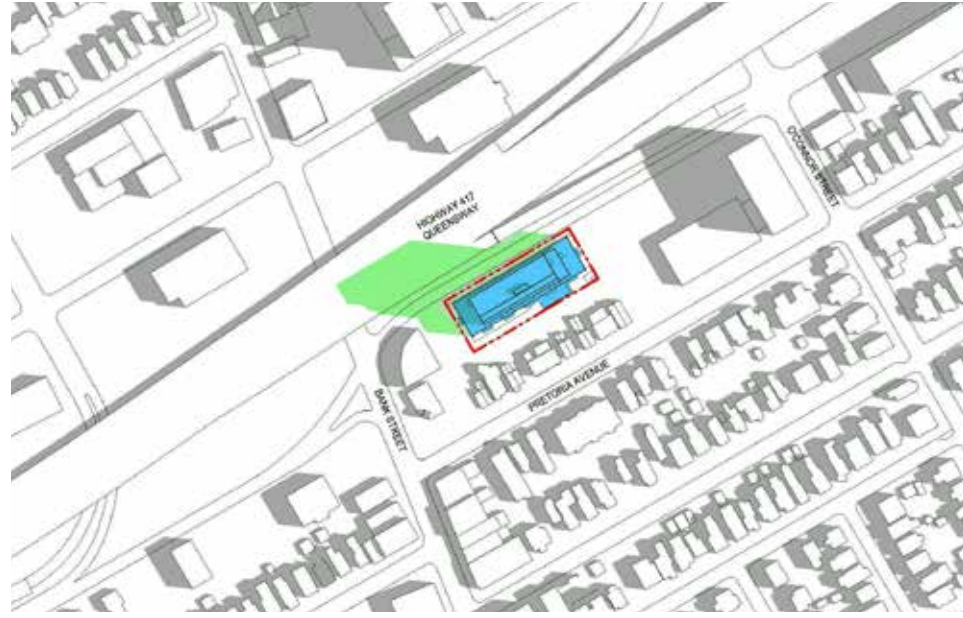
June 21 - 9:18