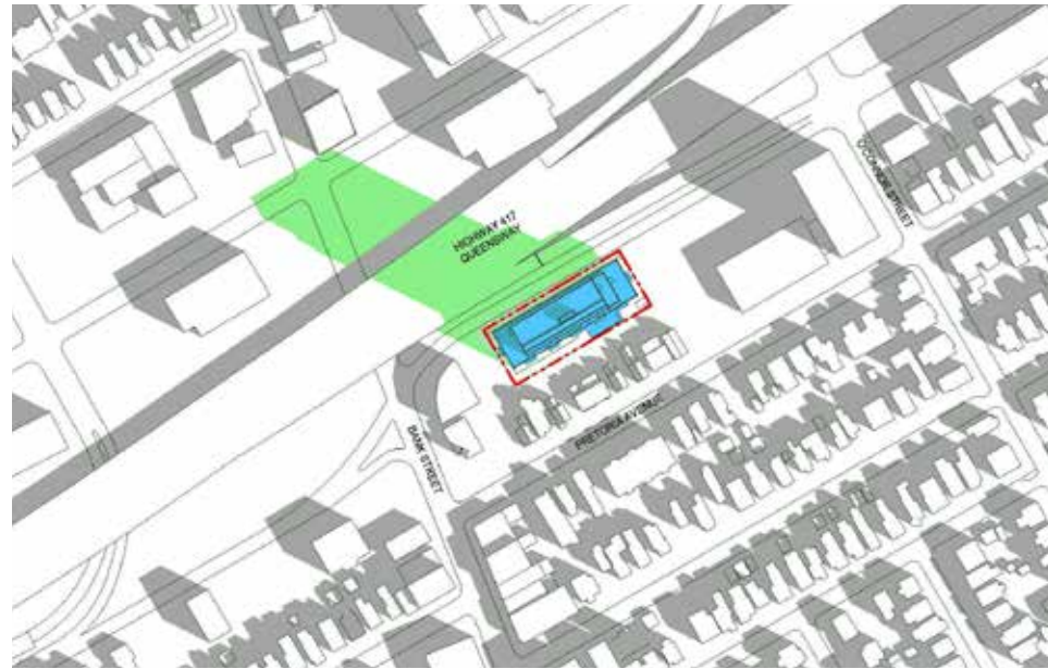
September 21 - 9:18