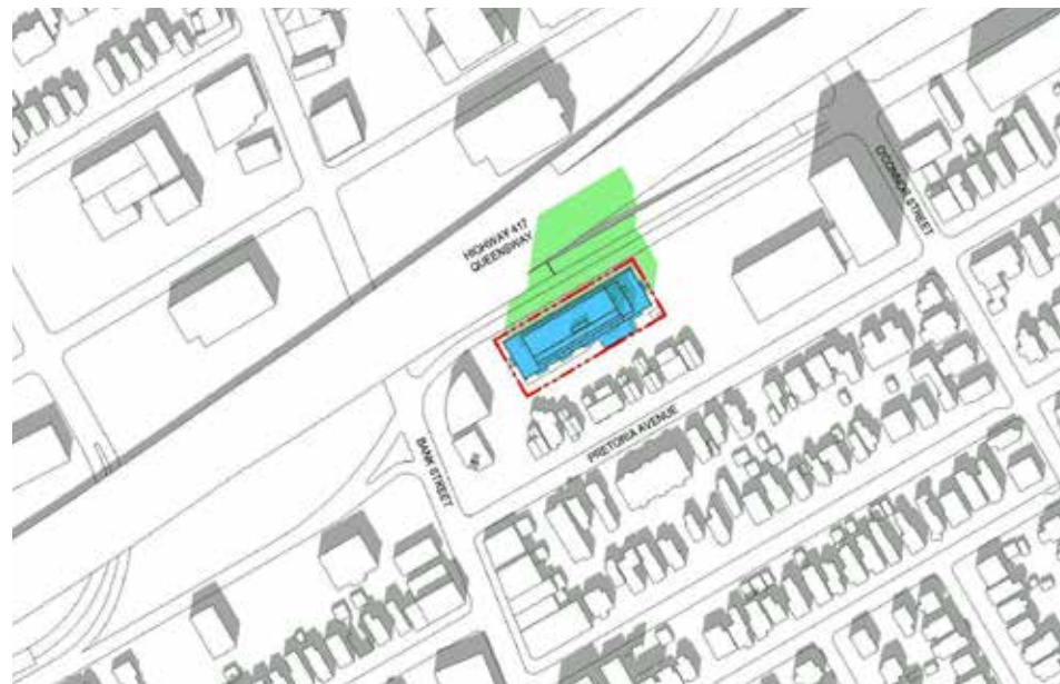
September 21 - 13:18