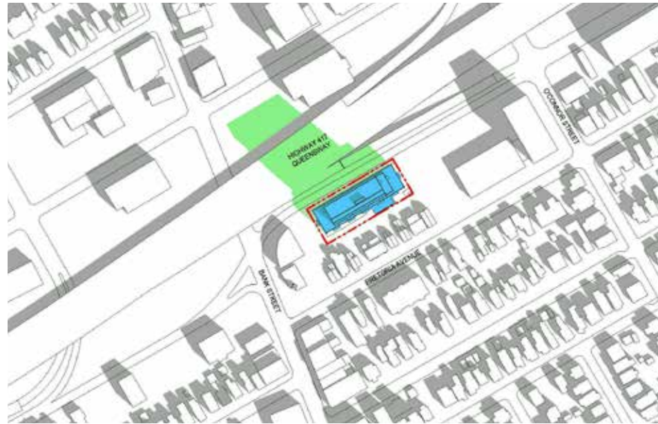
September 21 - 10:18