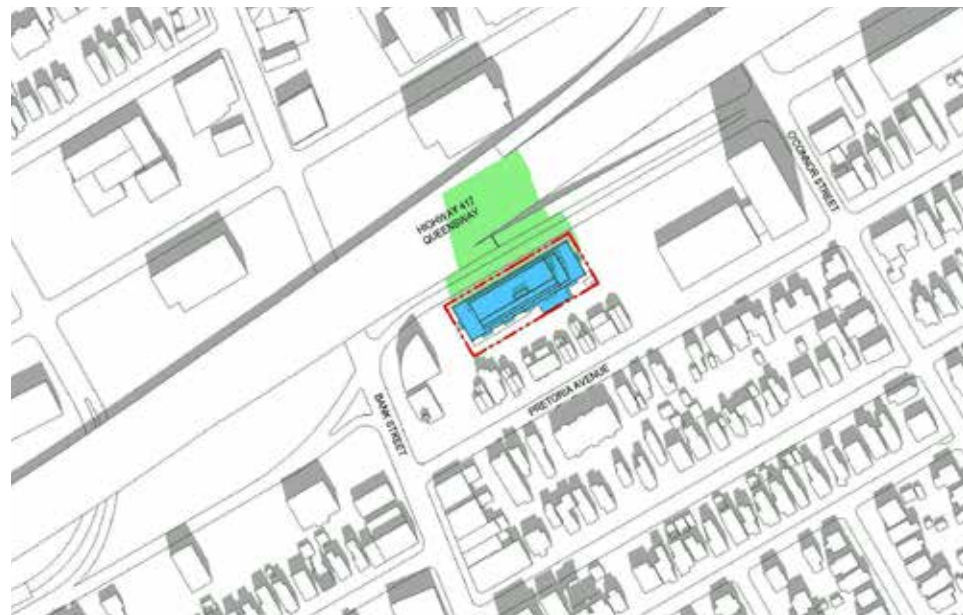
September 21 - 12:18