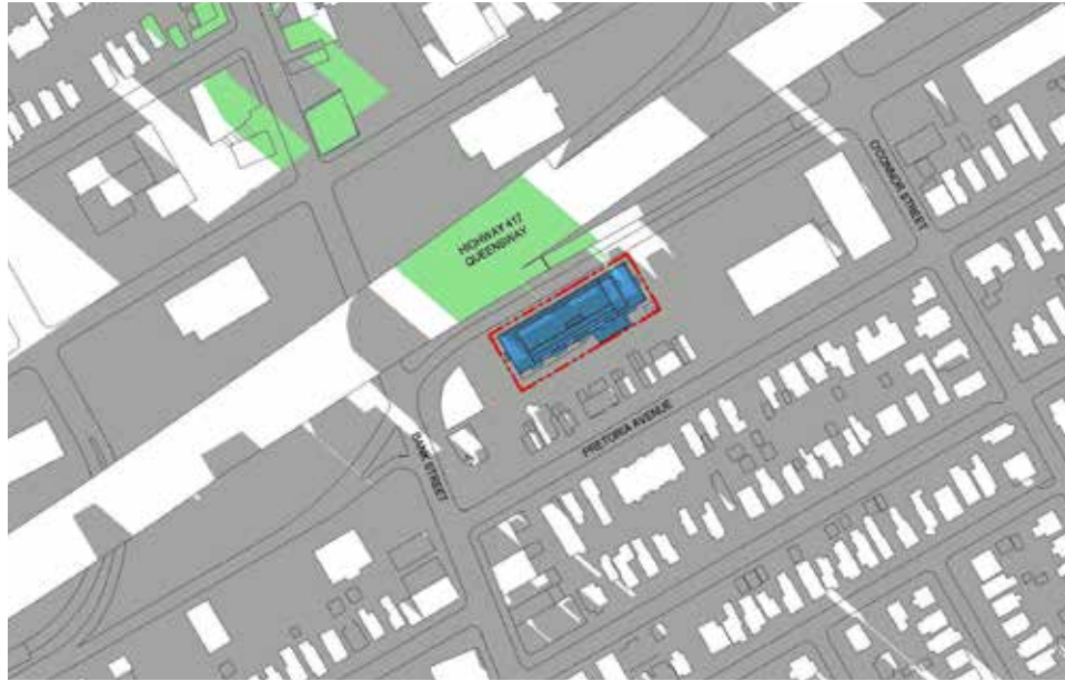
December 21 - 9:18