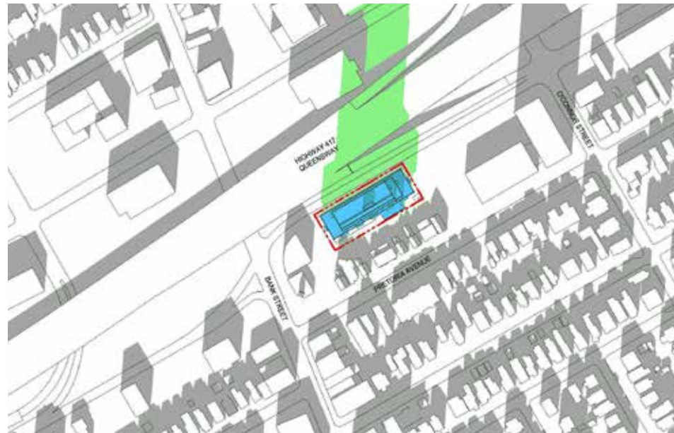
December 21 - 13:18