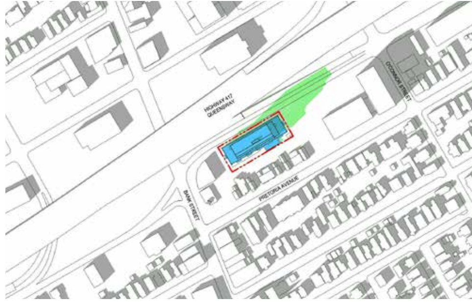
September 21 - 15:18