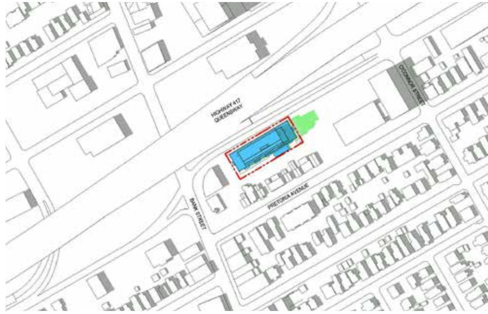
June 21 - 15:18