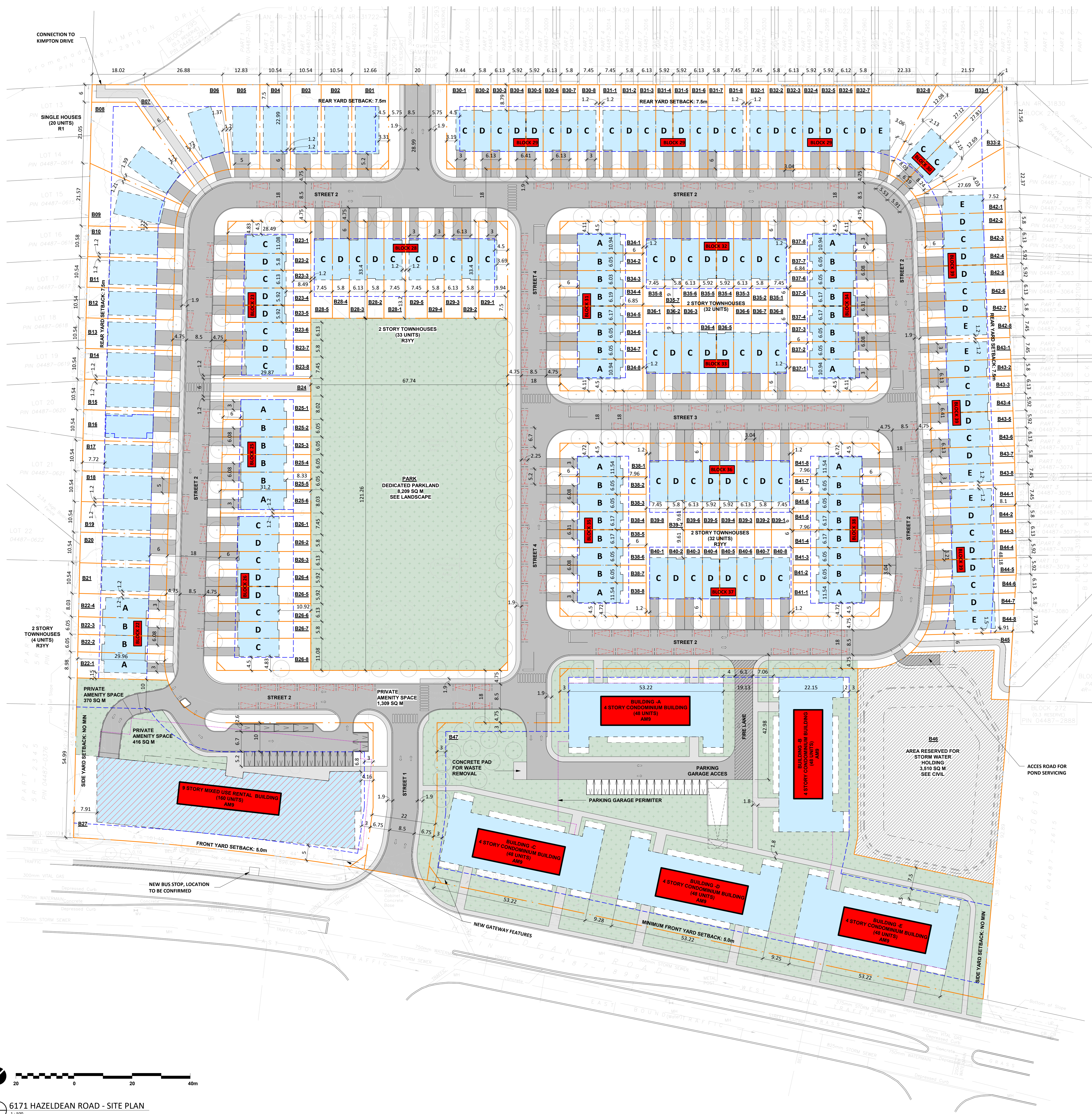
6171 HAZELDEAN ROAD - SITE PLAN 1:500

BIM 360://HAZELDEAN-KANATA/20019_HAZELDEAN_SITE_PLN_B21.rvt