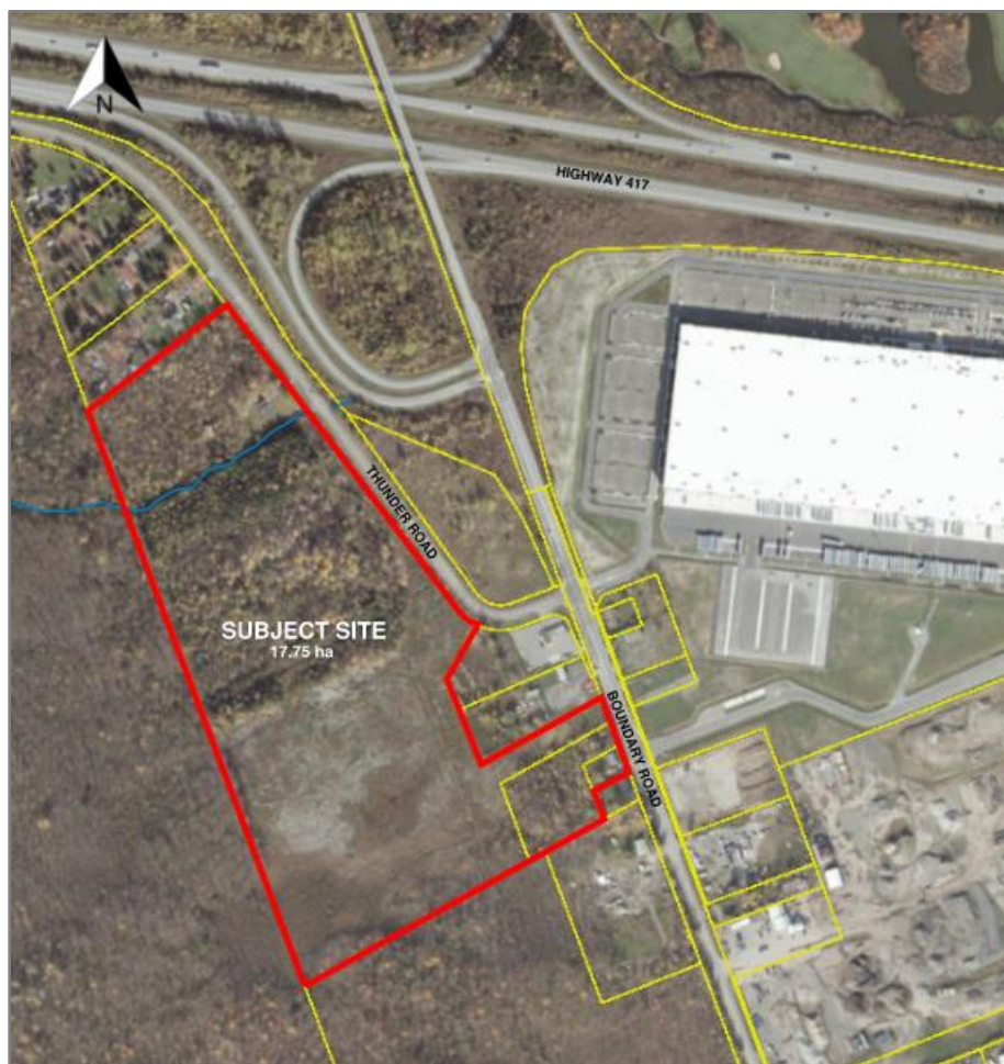
Figure 1: Aerial View of Subject Lands

LRL Associates Ltd. was retained by Avenue 31 to prepare a functional serviceability report to support the Official Plan Amendment and Zoning By-law amendment application for the property located at the south west corner of the intersection of Boundary Road and Thunder Road in Ottawa ON. The subject land encompasses three (3) separate properties as shown in Figure 1 below. The civic address' for the parcels are 6150 Thunder Road, 5368A Boundary Road and 5368B Boundary Road.