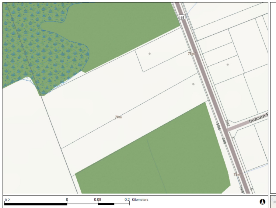
Figure 3 MNRF Wetland mapping. Data from Land Information Ontario (LIO) dataset, MNRF. See unevaluated wetland (open blue at top right) and woodlands north and south of site.

The subject site is directly adjacent to an unevaluated wetland to the north (Figure 3). There are no designated Provincially Significant Wetlands on or adjacent to the site. Woodlands occur to the north and south of the subject site and will be discussed in section 3.6.4 (Figure 3).