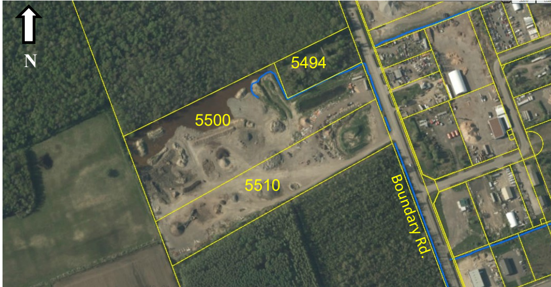
Figure 2 Location of 5494-5510 Boundary Road. Parcel mapping shown in yellow. Source: GeoOttawa Dec. 16 2019, imagery date 2017.