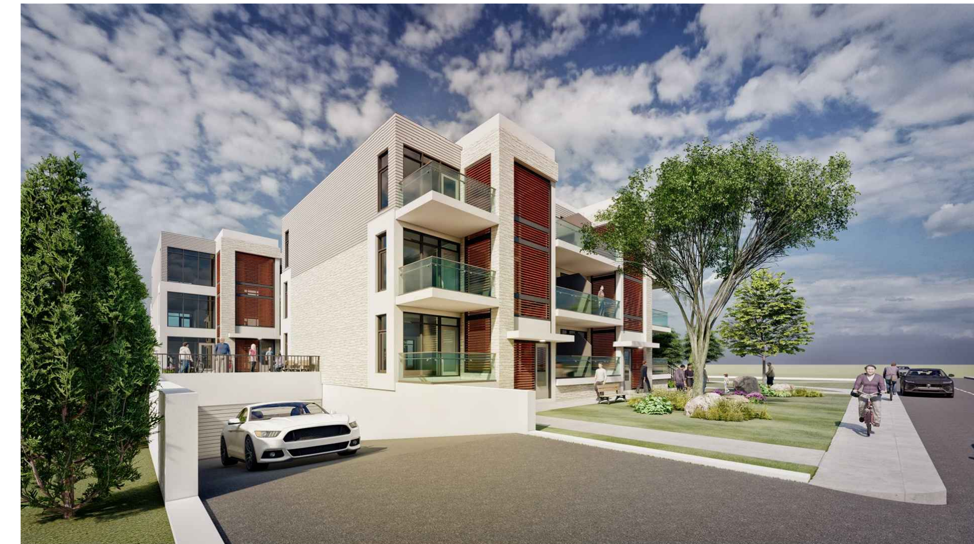
3 VIEW FROM THE SOUTH- EAST ( CHEMIN TENTH LINE ROAD) A401 SCALE = N/A