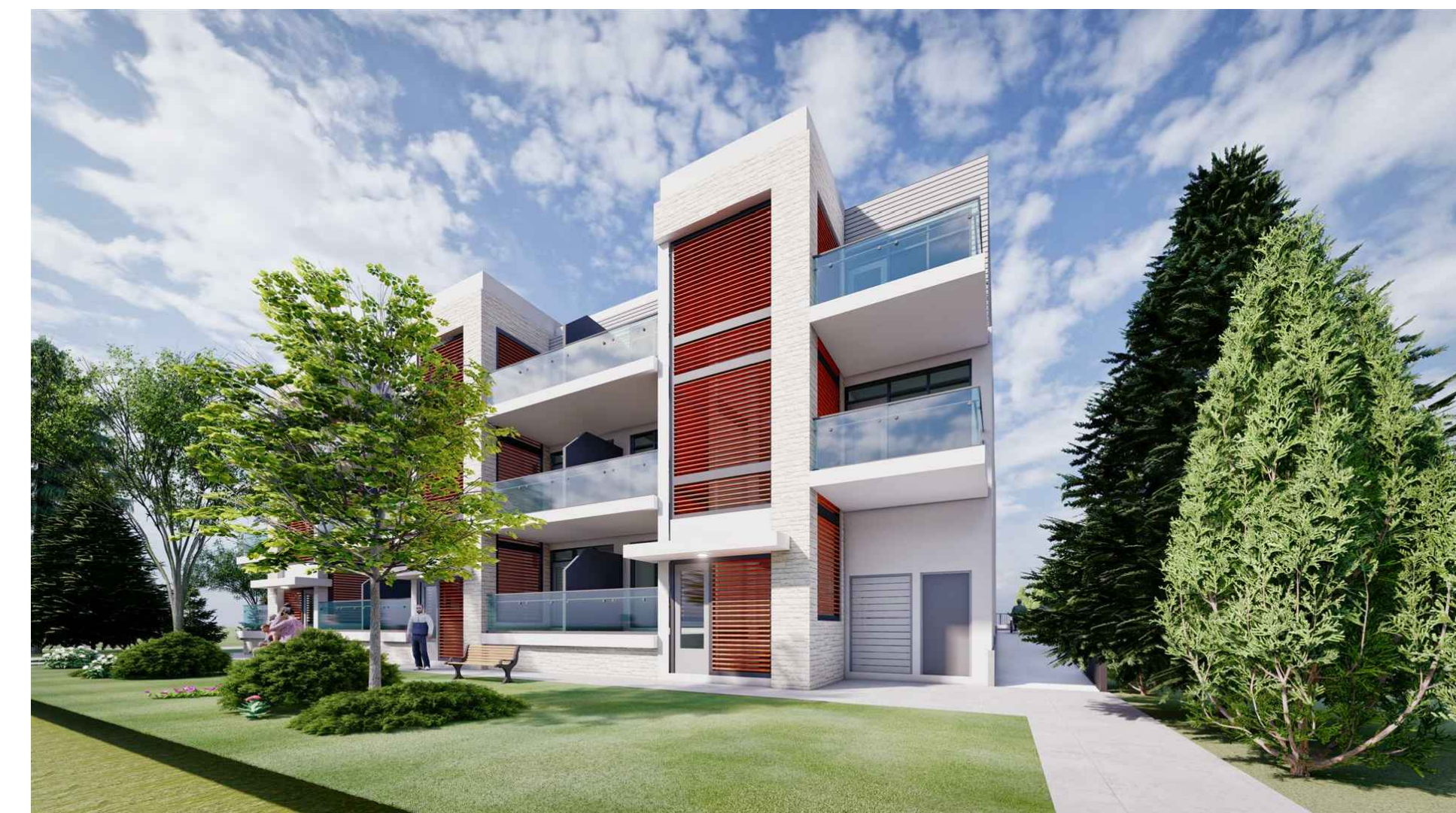
4 VIEW FROM SOUTH-WEST ( CROISSANT PHOENIX CRESCENT) A401 SCALE = N/A