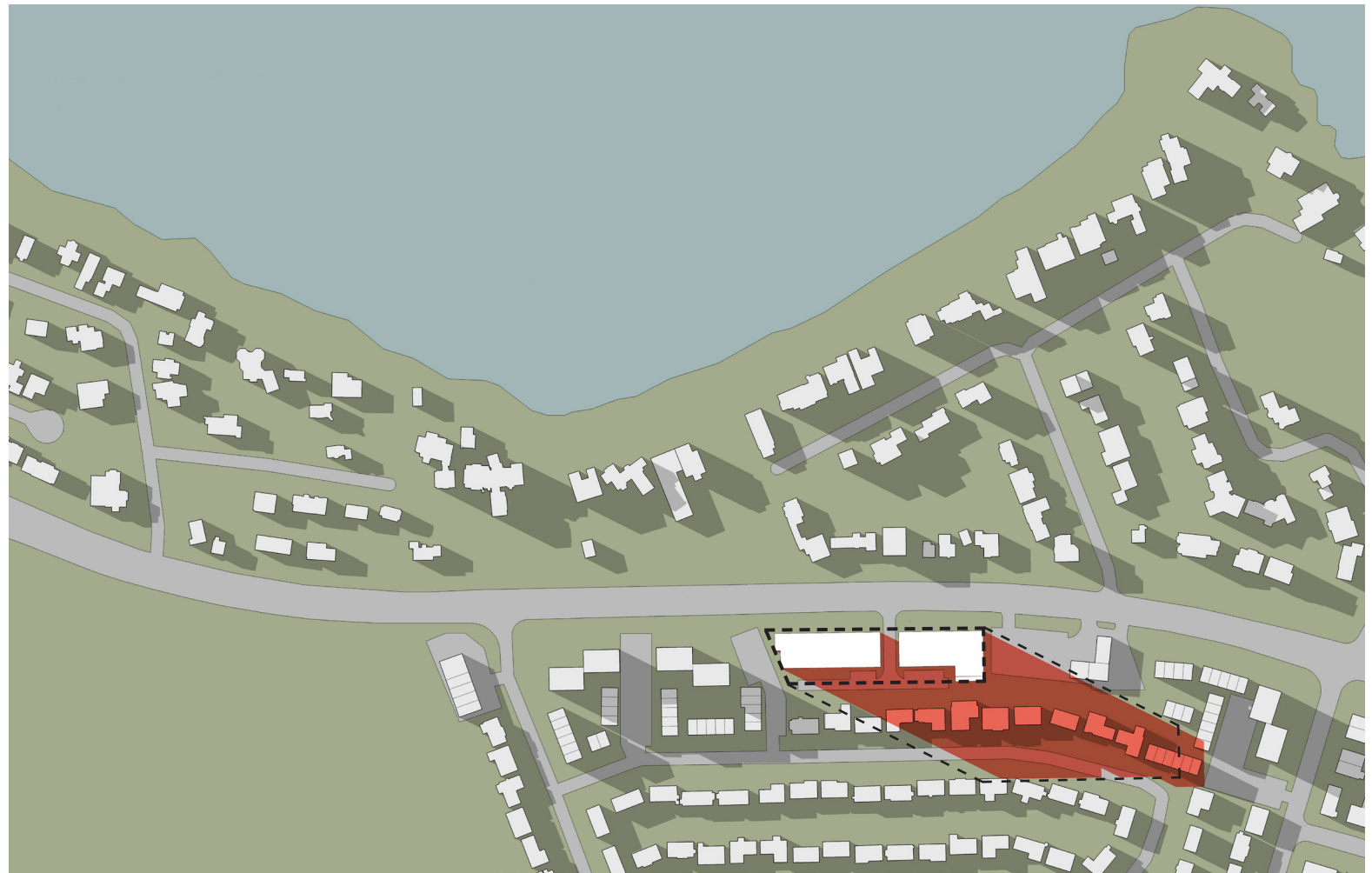
JUNE 21 - 8:00 PM