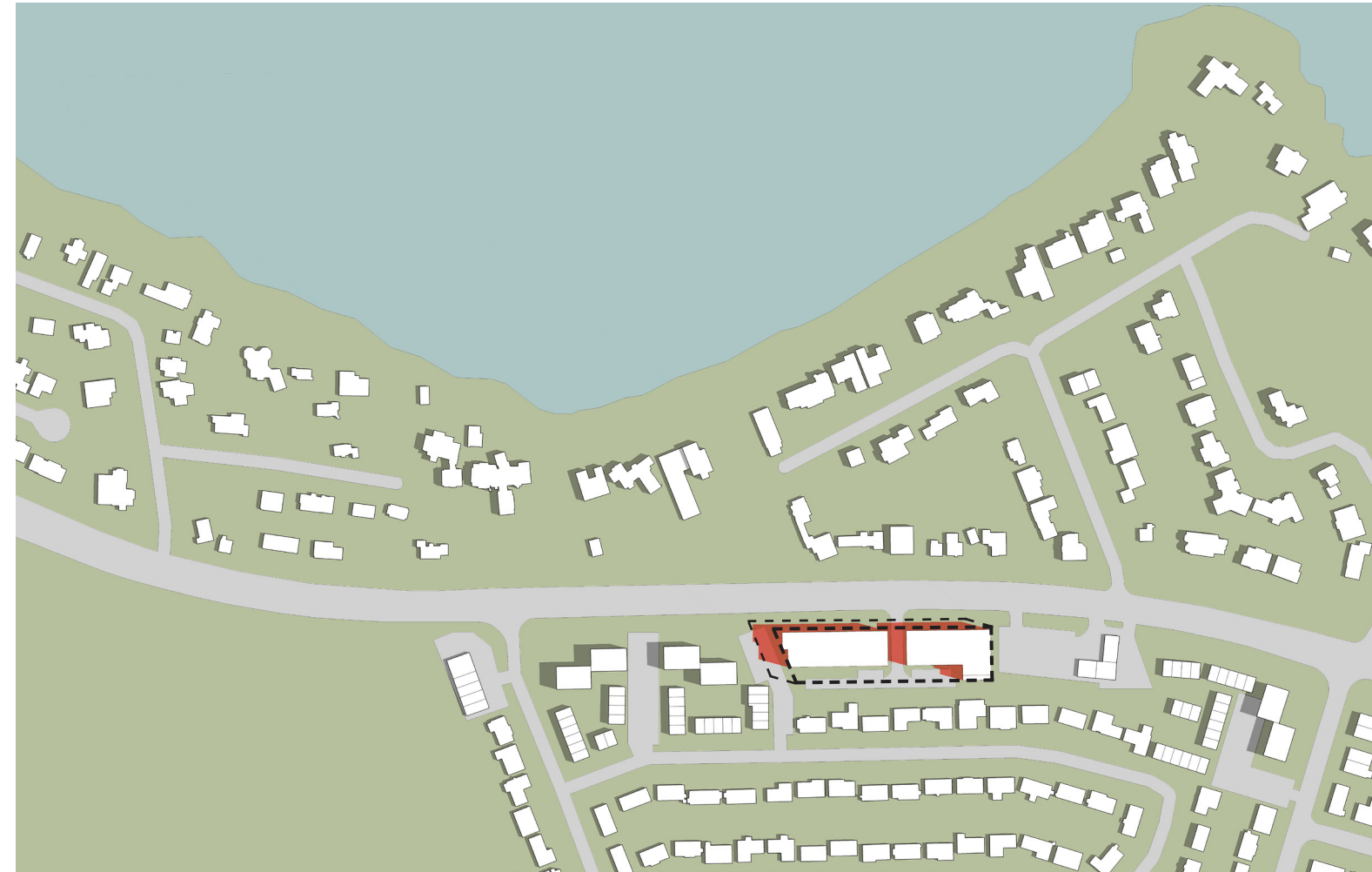
JUNE 21 - 10:00 AM