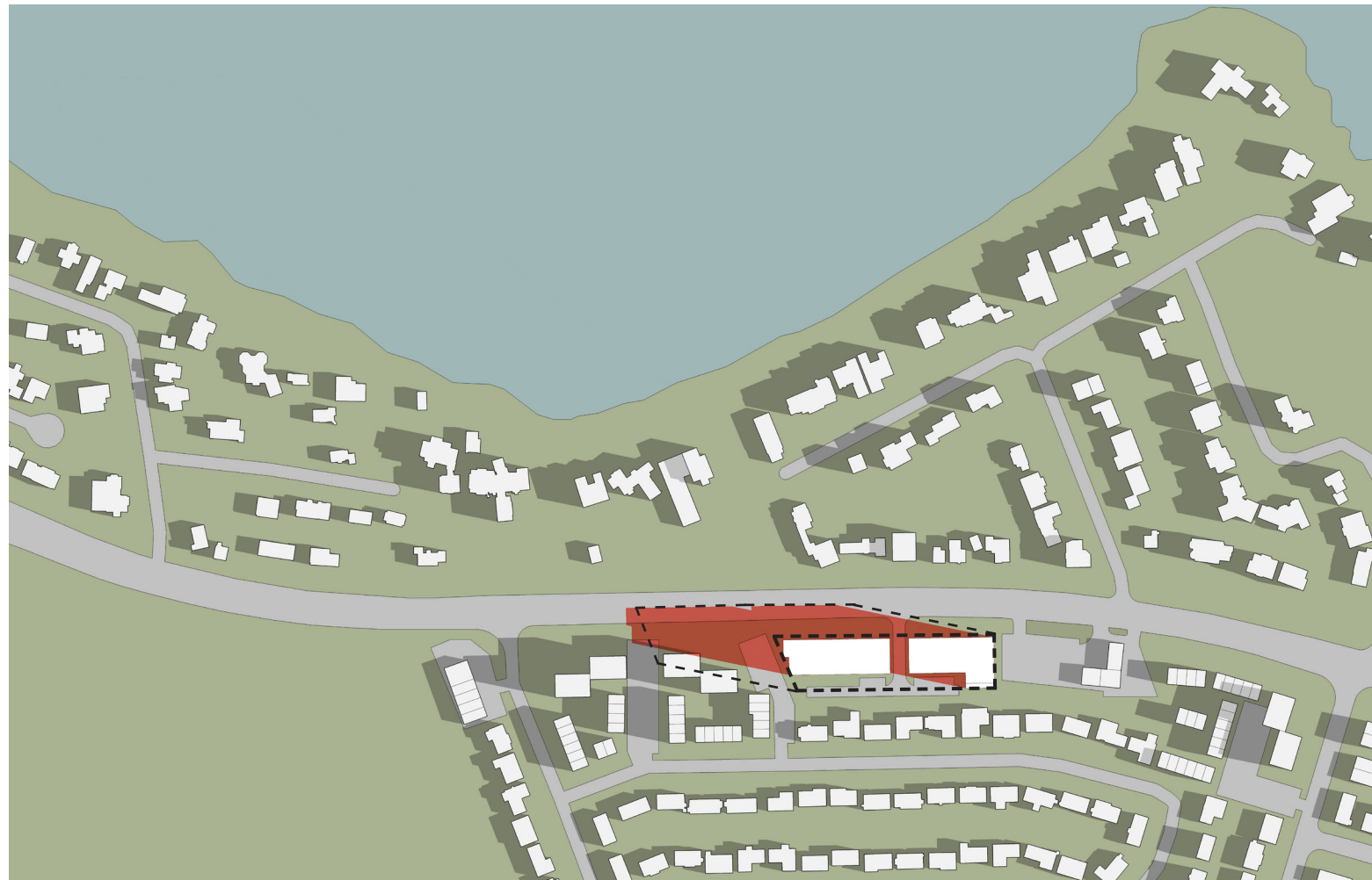
SEPT 21 - 8:00 AM