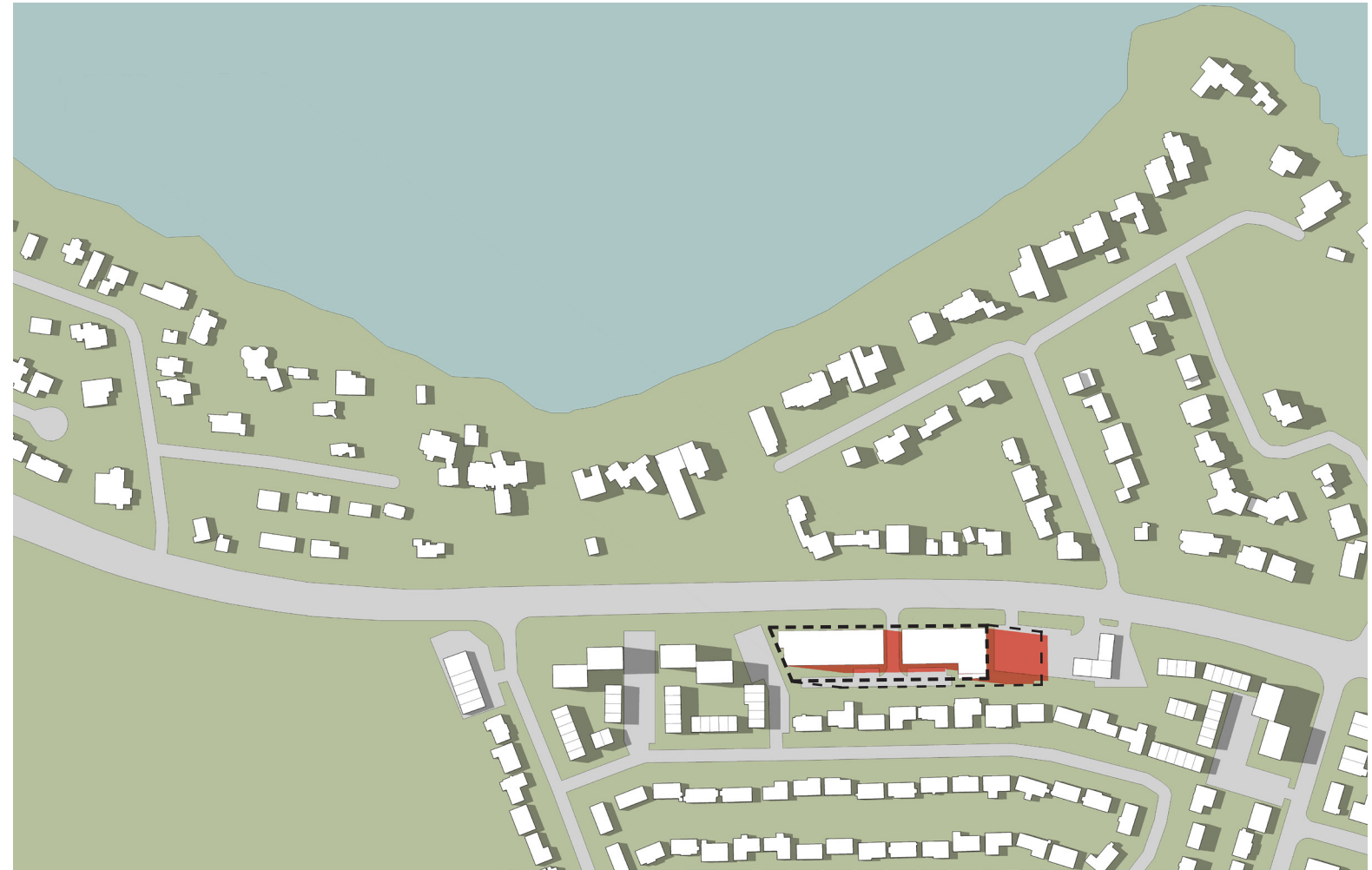
JUNE 21 - 6:00 PM