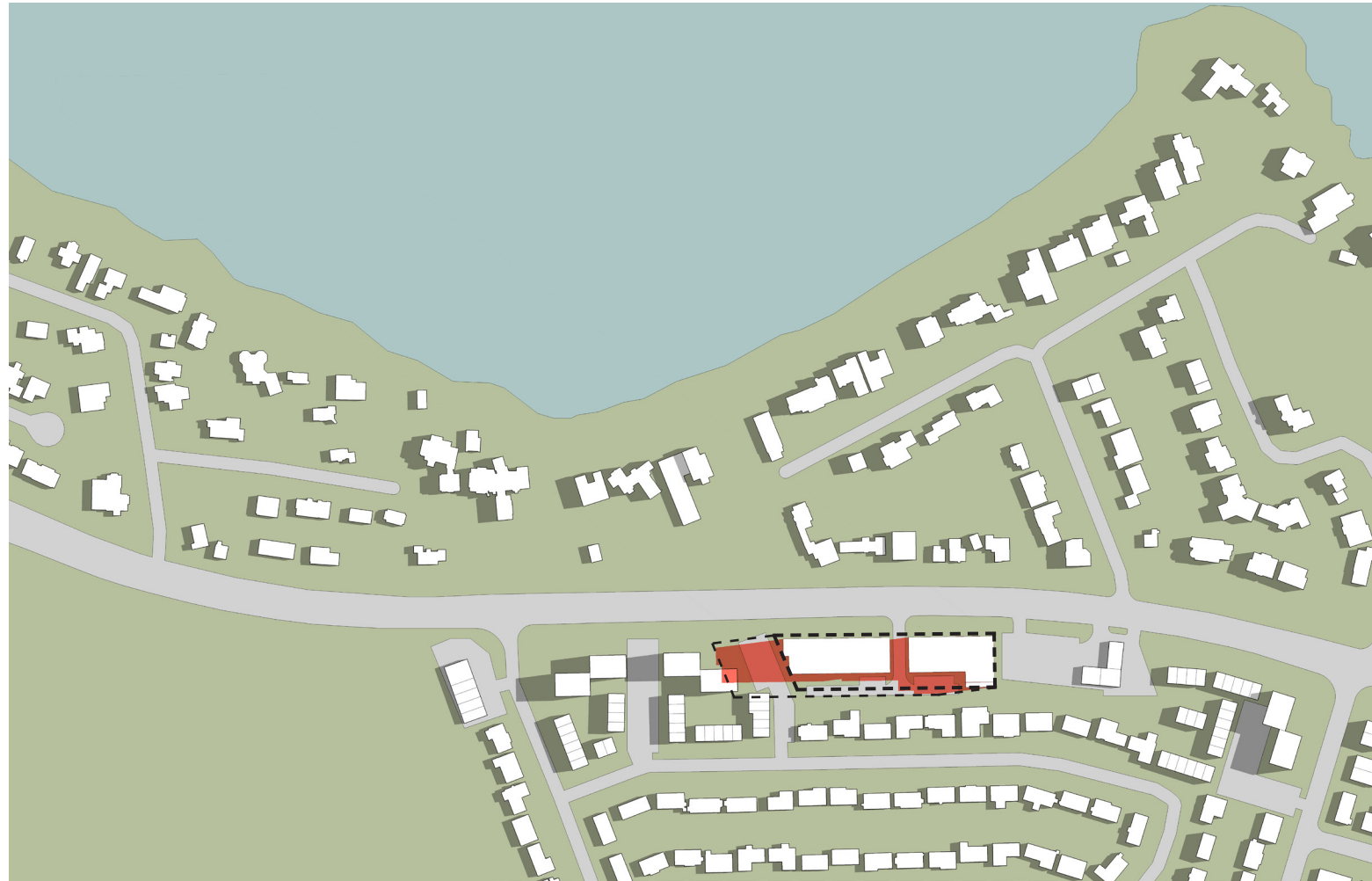
JUNE 21 - 8:00 AM