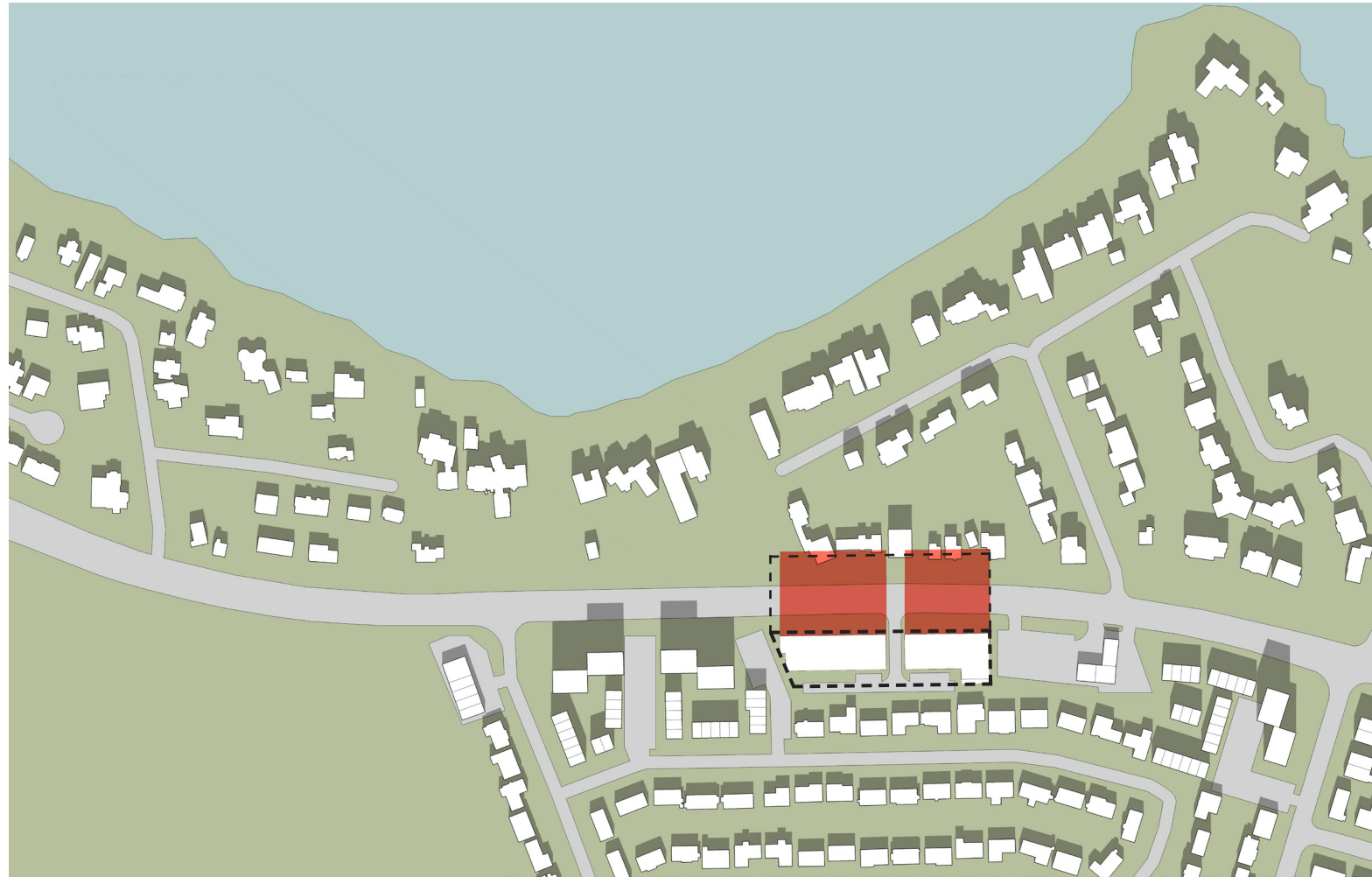
DEC 21 - 1:00 PM