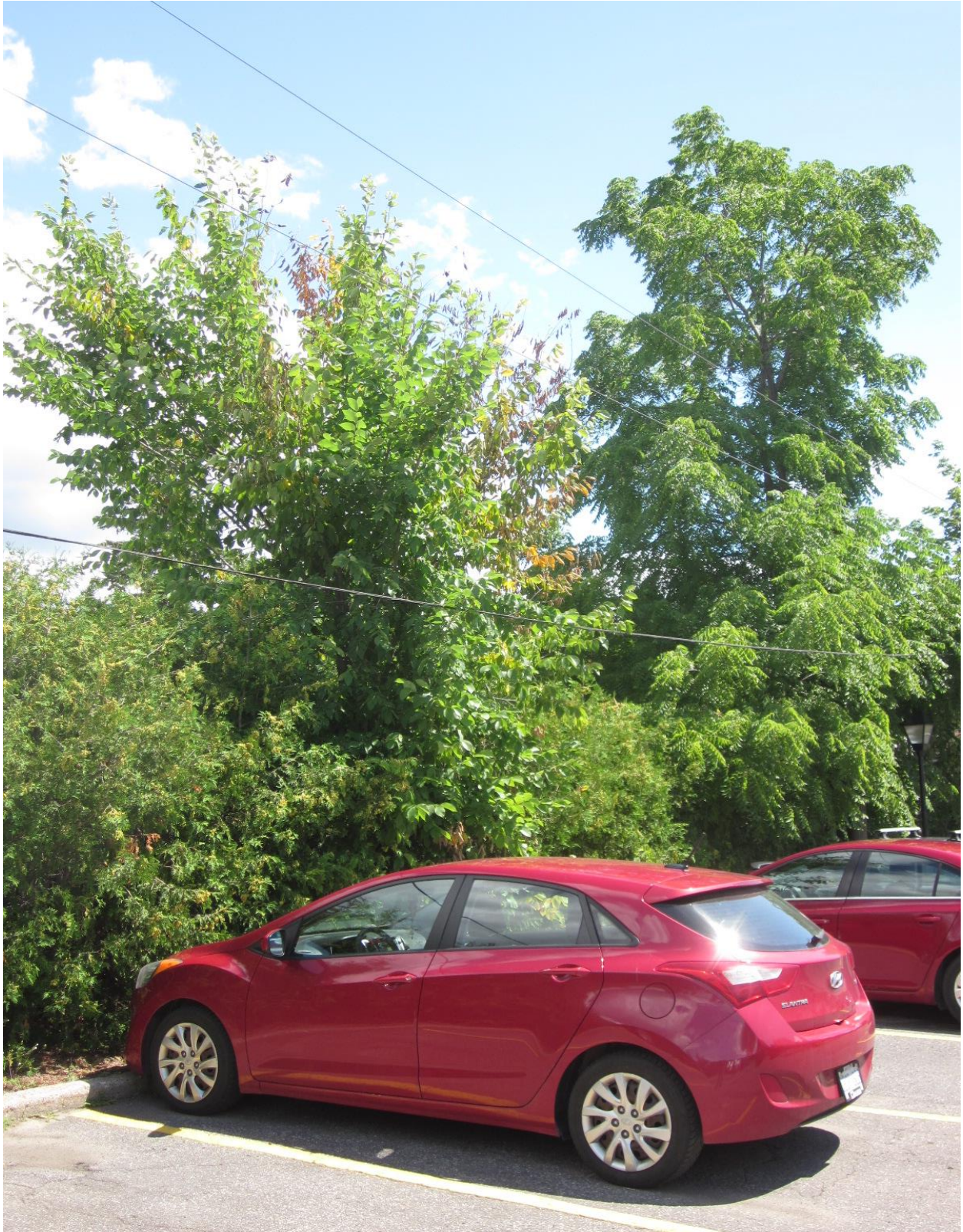
Picture 1. Shared trees #3 (elm, left) and 4, black walnut (eight) at 3430 Carling Avenue (note flagging due to Dutch elm disease visible in elm crown)