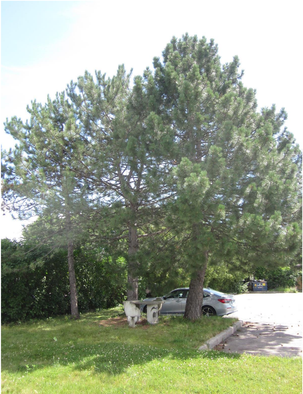
Picture 6. Austrian pines #9, 10 and 11 (left to right) at 3430 Carling Avenue