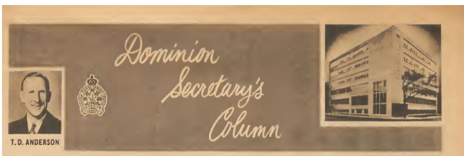
Figure 2: August 1958 Legionary Magazine Dominion Secretary's Column Header. The building design was completed in its current form by August 1958 to the design of John L. Kingston Architect whose office was located in the building in November 1956. The three-

storey addition was completed by 1960. (Ottawa Citizen, November 14, 1956). Note the entrance remained off Gilmour Street.