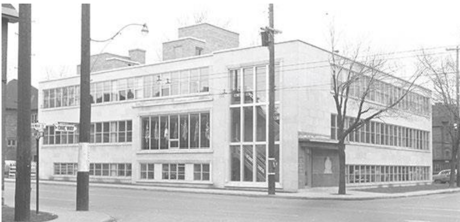
Figure 1: November 1956 photo of the recently completed national headquarters of the Royal Canadian Legion. The entrance was originally off Gilmour Street (right) with a two- and one-half storey glazed window denoting the vertical circulation with a one-storey bay window to the left denoting the publicly accessible portions of the building.

The Legion House does not demonstrate a high degree of technical or scientific achievement.