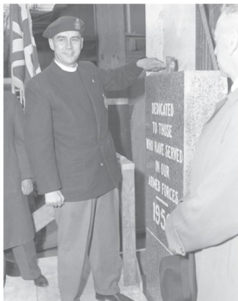
Figure 5: Laying of a cornerstone dedicating the new national headquarters of the Royal Canadian Legion in May 1956. The dedication reads 'dedicated to those how have served in our armed forces'.

Does the property have direct associations with a theme, event, belief, person, activity, organization, or institution that is significant to a community? YES NO