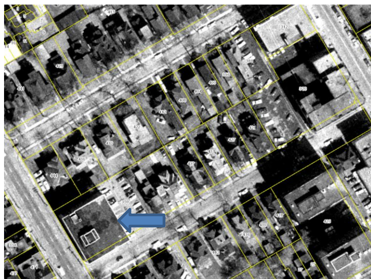
Figure 8: 1965 aerial view of the block bound by MacLaren to the north, Bank to the east, Gilmour to the south, and Kent to the west. Kent Street had been converted to a one-way street by 1965 and the detached residential form within the block was largely intact. Legion House arrowed.

Legion House has contextual value for its location in Centretown reflecting its role as a national headquarters located close to the federal government. This area of Centretown was predominately a residential neighbourhood with a variety of architectural styles from the 1880s through the 1920s. In the 1960s, land values in Centretown escalated creating a competitive market for office, retail commercial, parking, and high-density residential uses. On the east side of Kent, older residential buildings were demolished to make way for large office and apartment buildings and surface parking lots.