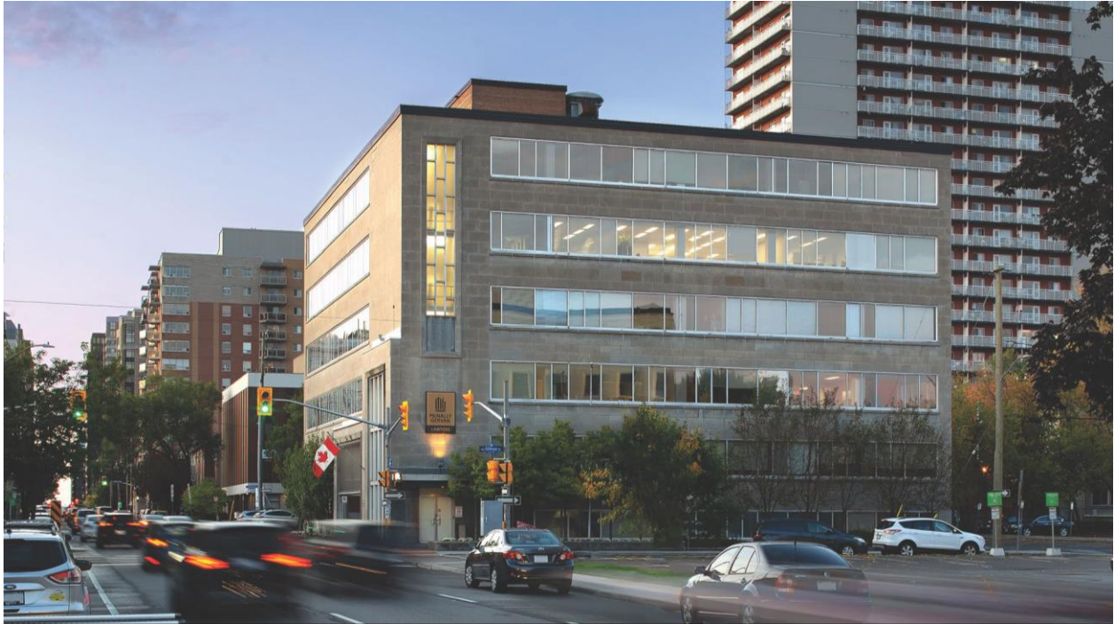
Figure 3: Contemporary view of the building looking north on Kent Street. The entrance to the building had been shifted to Kent Street prior to 1995 when a new national headquarters had been completed in Kanata.