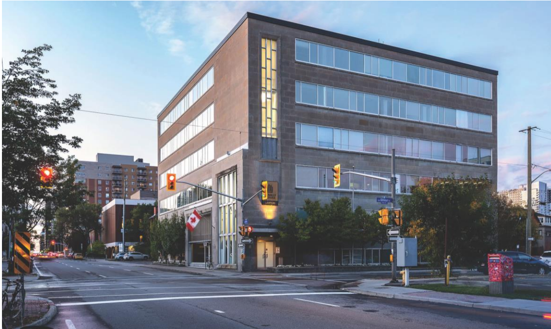
Figure 10: Contemporary view of the Legion House looking north on Kent.