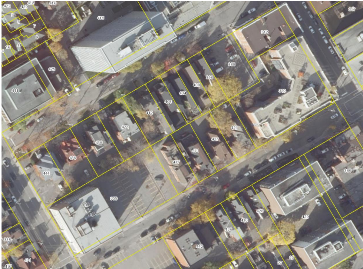
Figure 9: 2019 aerial view of the block bound by MacLaren to the north, Bank to the east, Gilmour to the south, and Kent to the west. Legion House arrowed.