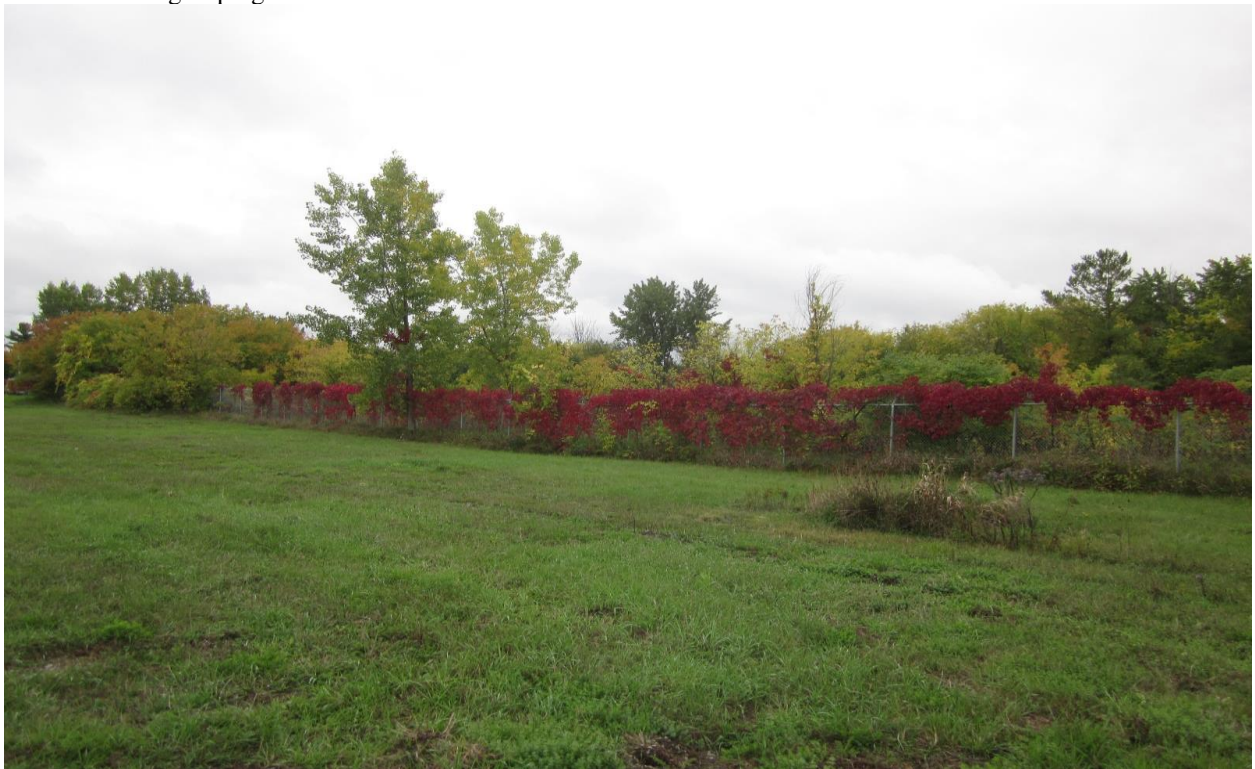
Picture 6. Tree grouping D at 1987 Robertson Road