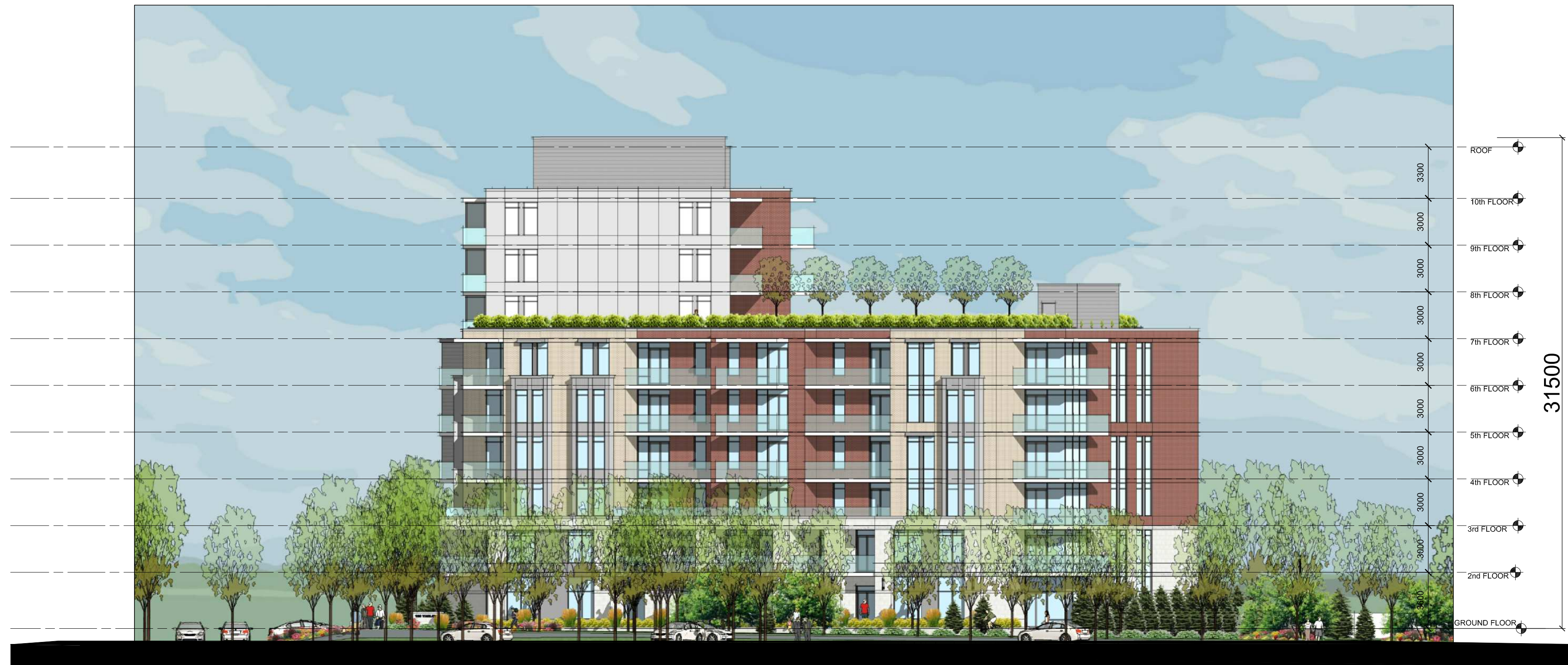
WEST ELEVATION (VARLEY)

IT IS THE RESPONSIBILITY OF THE APPROPRIATE CONTRACTOR TO CHECK AND VERIFY ALL DIMENSIONS ON SITE AND TO REPORT ALL ERRORS AND/OR OMISSIONS TO THE ARCHITECT. ALL CONTRACTORS MUST COMPLY WITH ALL PERTINENT CODES AND BY-LAWS. THIS DRAWING MAY NOT BE USED FOR CONSTRUCTION UNTIL SIGNED BY THE ARCHITECT. DO NOT SCALE DRAWINGS. COPYRIGHT RESERVED.