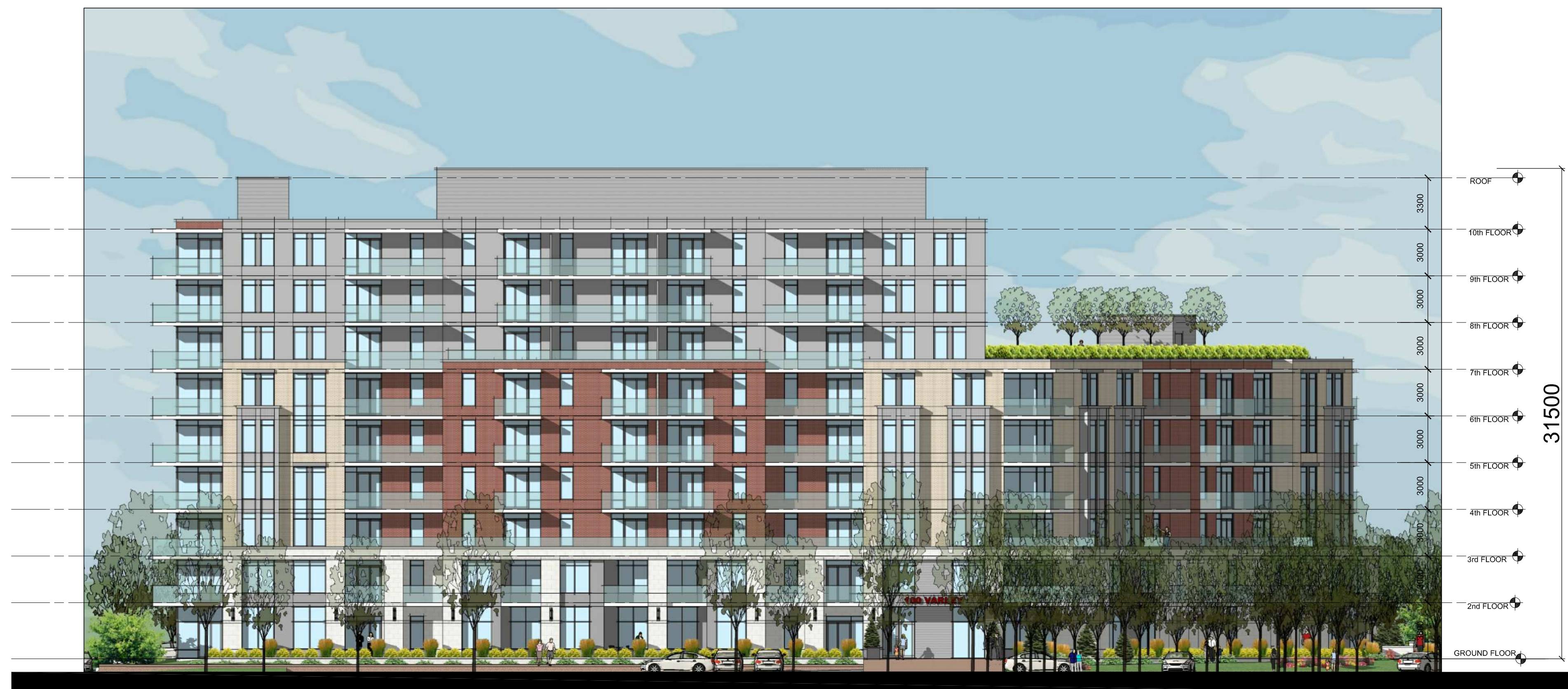
NORTH ELEVATION (WEEPING WILLOW)