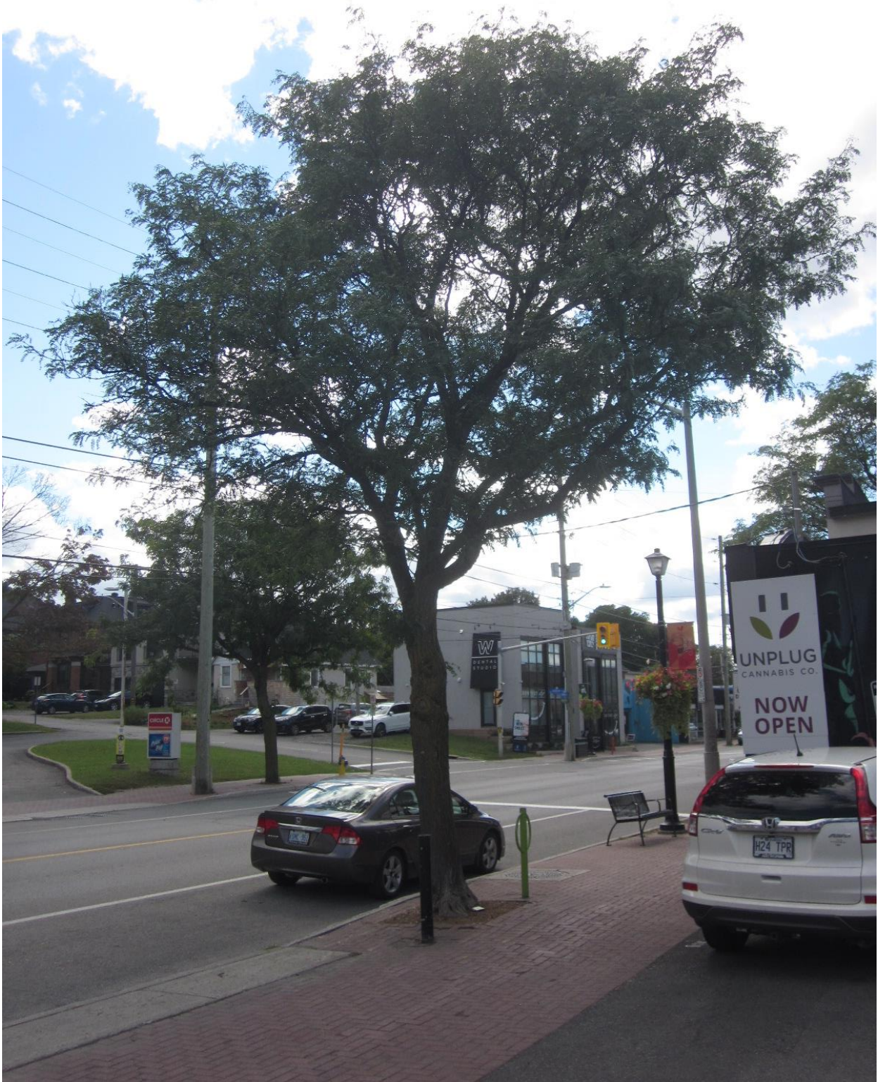
Picture 1. Tree #1 located on city property adjacent to 249-255 Richmond Road