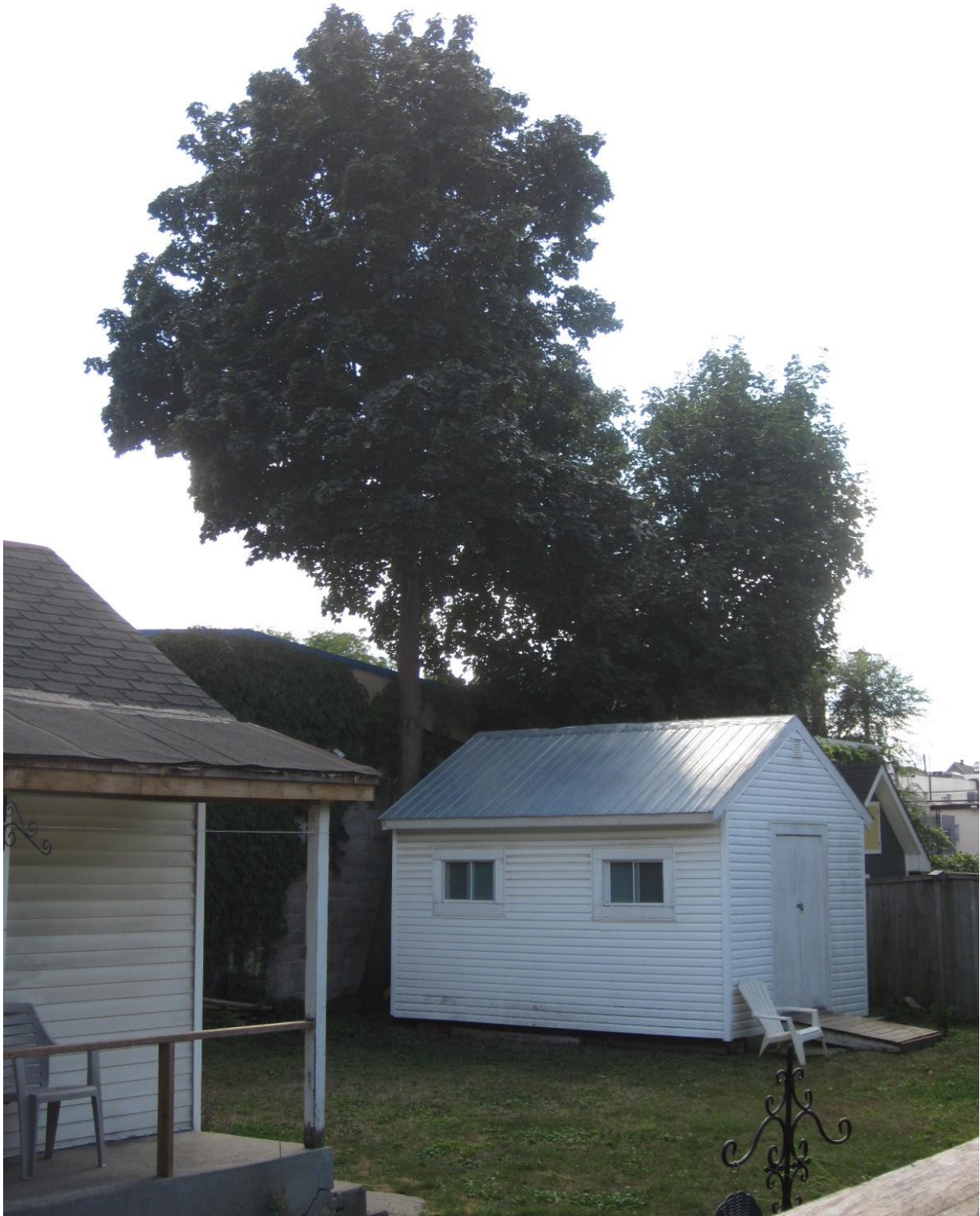
Picture 4. Trees #6 and 7 (left to right) located on or shared with 372 Tweedsmuir Avenue