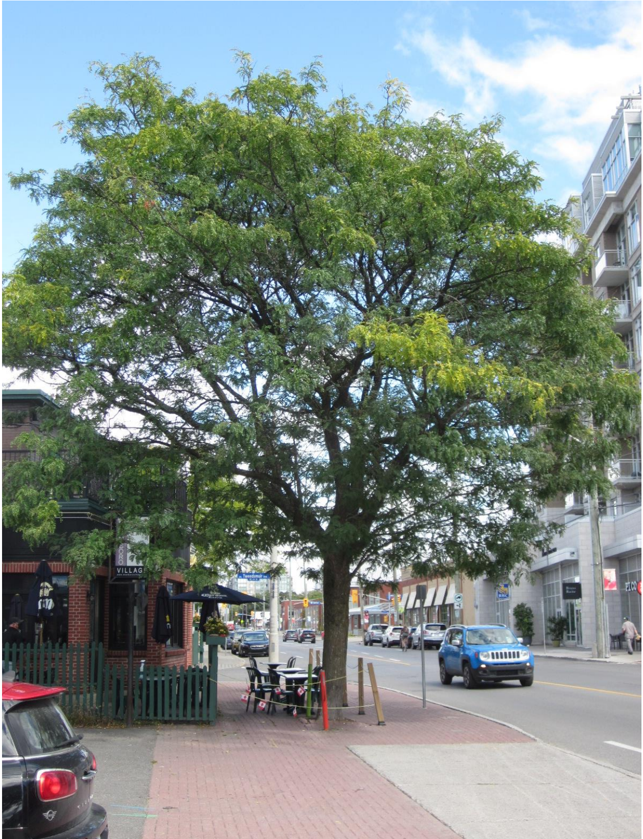
Picture 2. Tree #2 located on city property adjacent to 249-255 Richmond Road