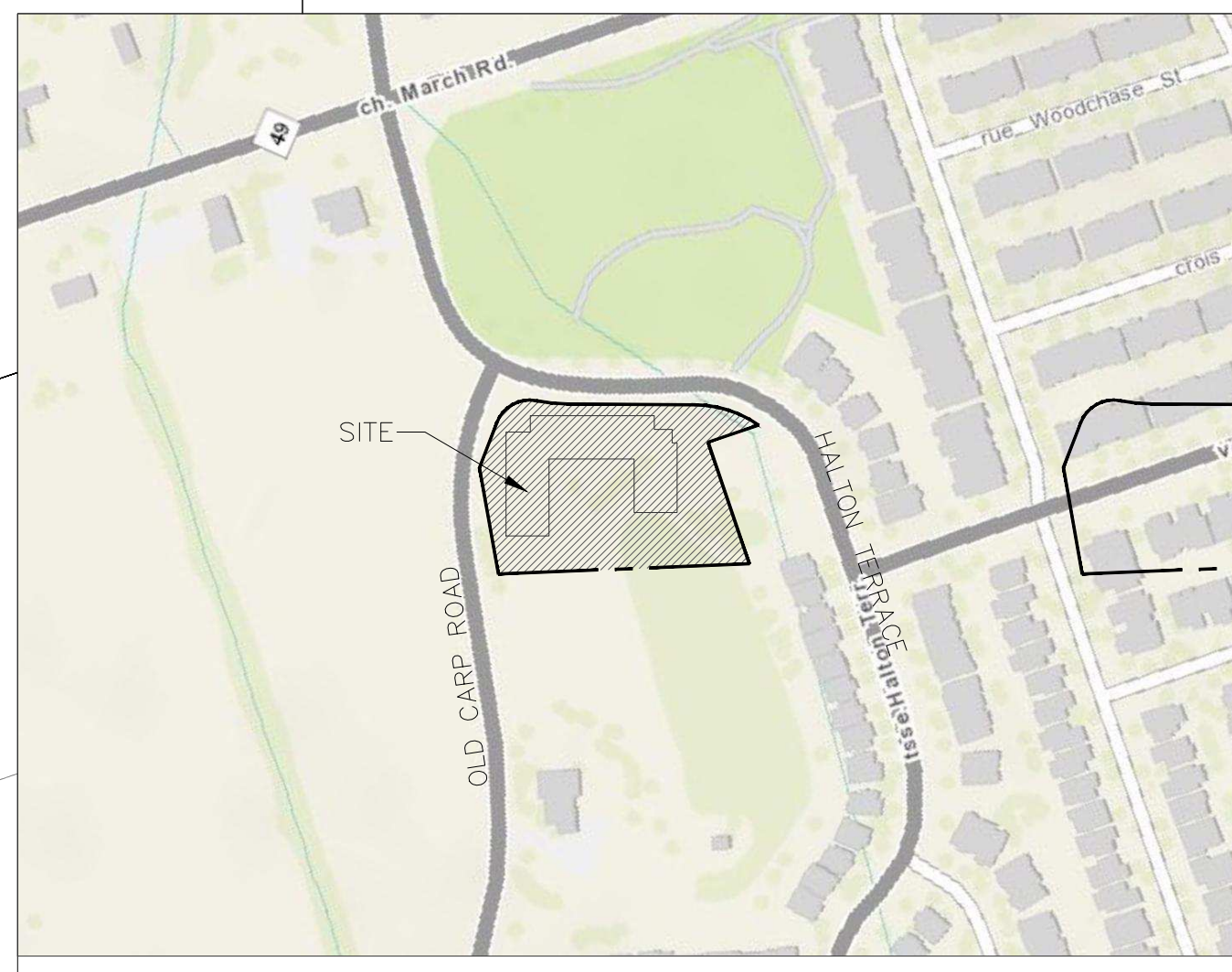
LOCATION PLAN NTS

GENERAL NOTES IT IS THE RESPONSIBILITY OF THE CONTRACTOR TO VERIFY ALL DIMENSIONS ON SITE AND REPORT ANY ERRORS AND OMISSIONS TO THE ARCHITECT. ALL CONTRACTORS MUST COMPLY WITH ALL PERTINENT CODES AND BY-LAWS. DO NOT SCALE DRAWINGS. THESE DRAWINGS MAY NOT BE USED FOR CONSTRUCTION UNTIL SIGNED. THIS DRAWING IS THE EXCLUSIVE PROPERTY OF COLIZZA BRUNI ARCHITECTURE INCORPORATED. COPYRIGHT RESERVED.