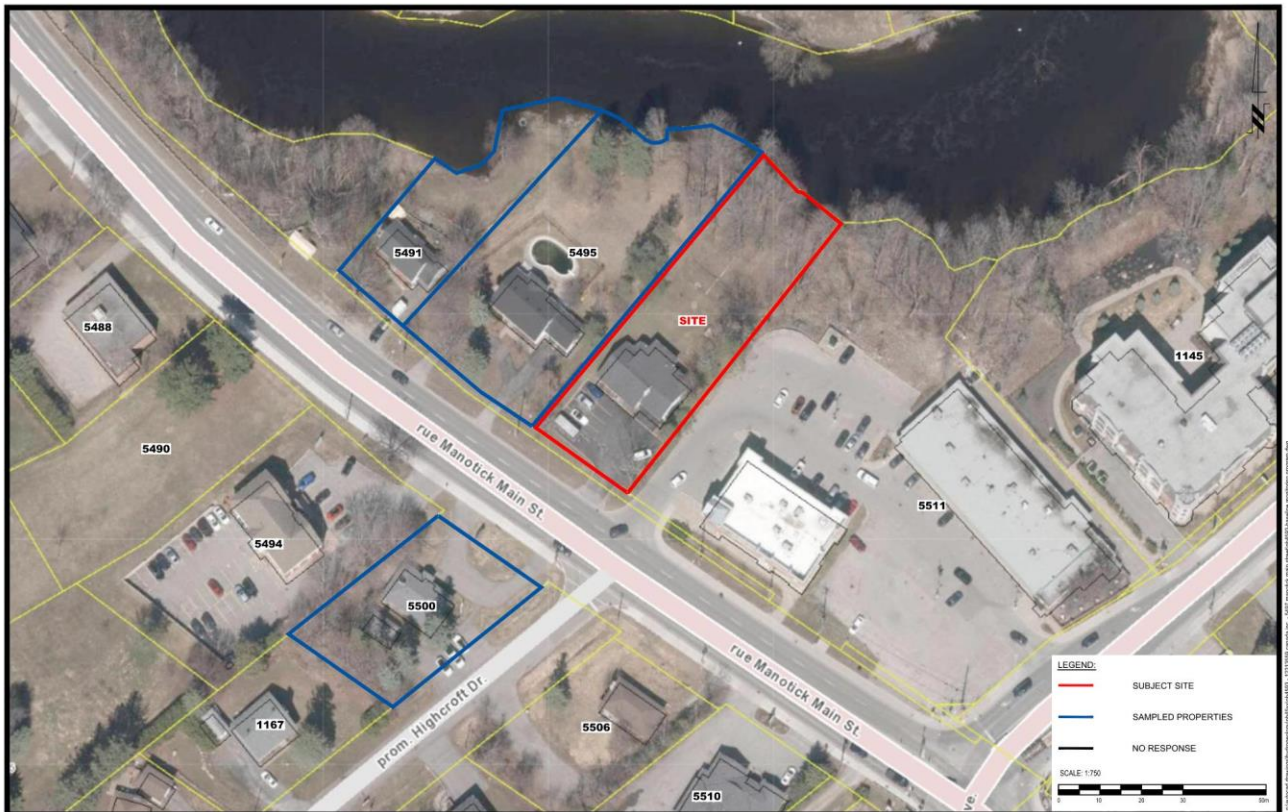
Figure 1 – Sample Location Plan