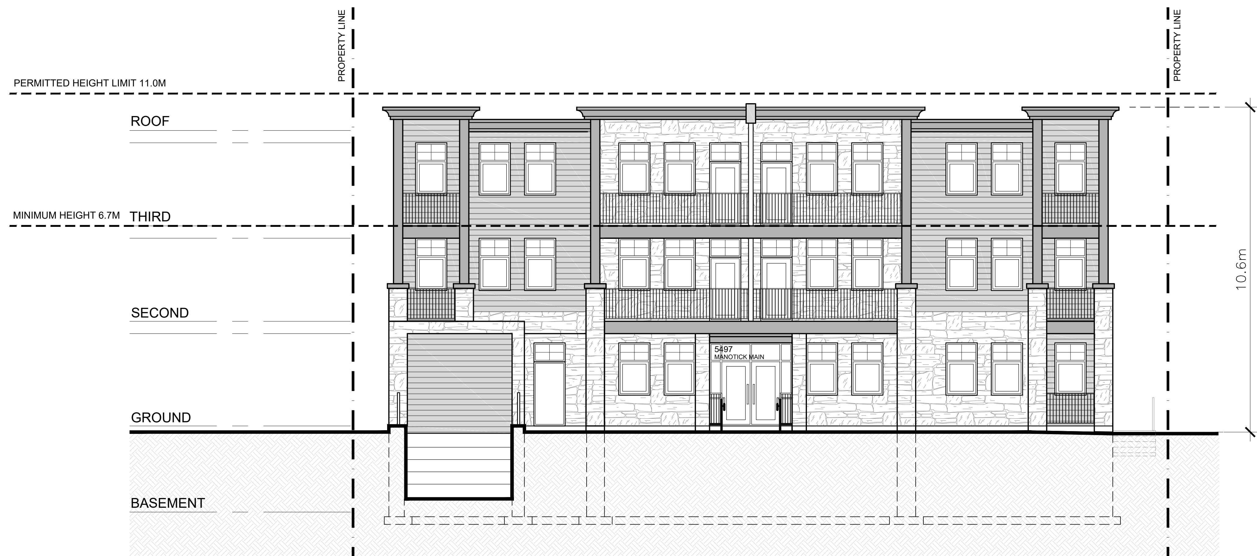
1 FRONT ELEVATION A-2 SCALE = 1:75

141 Catherine Street, Unit 102 Ottawa, Ontario K2P 1C3