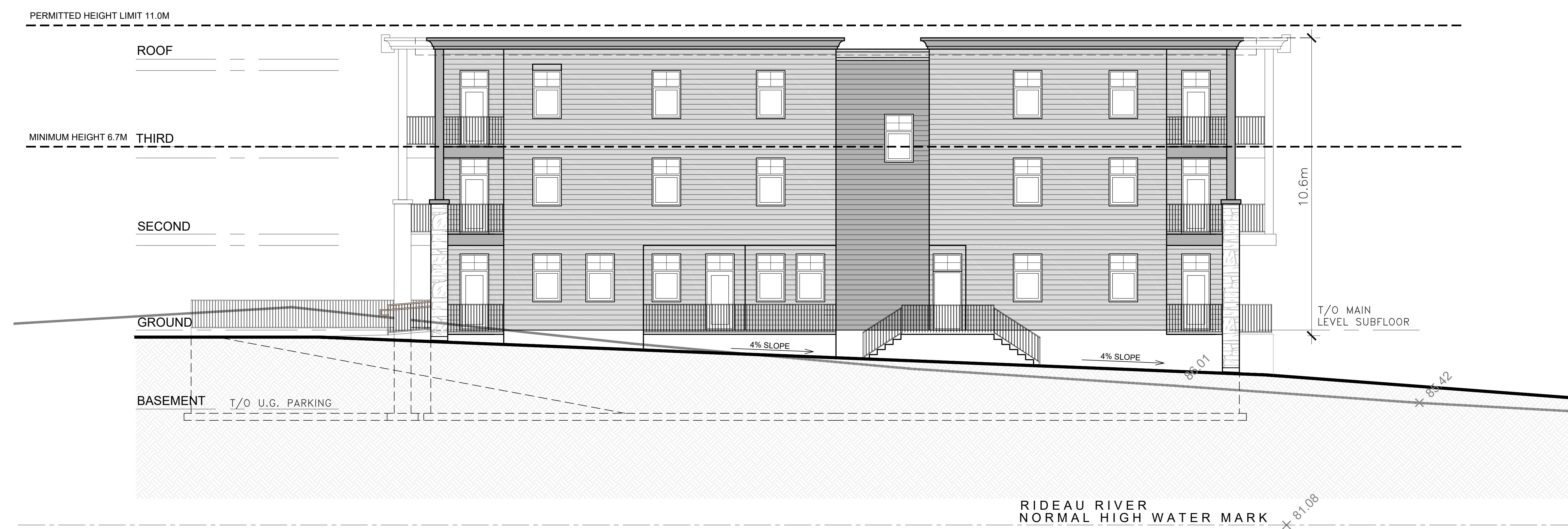
2 RIGHT SIDE ELEVATION SCALE = 1:75 A-2