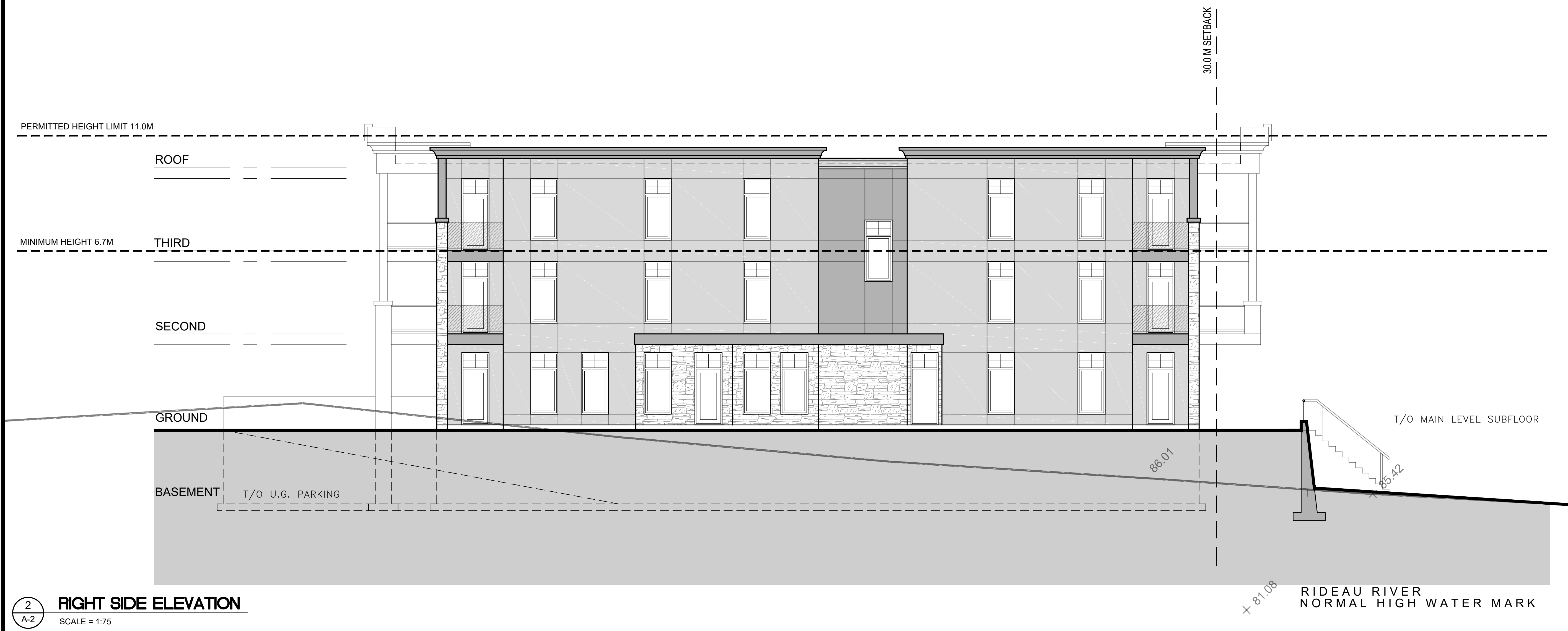
2 RIGHT SIDE ELEVATION A-2 SCALE = 1:75