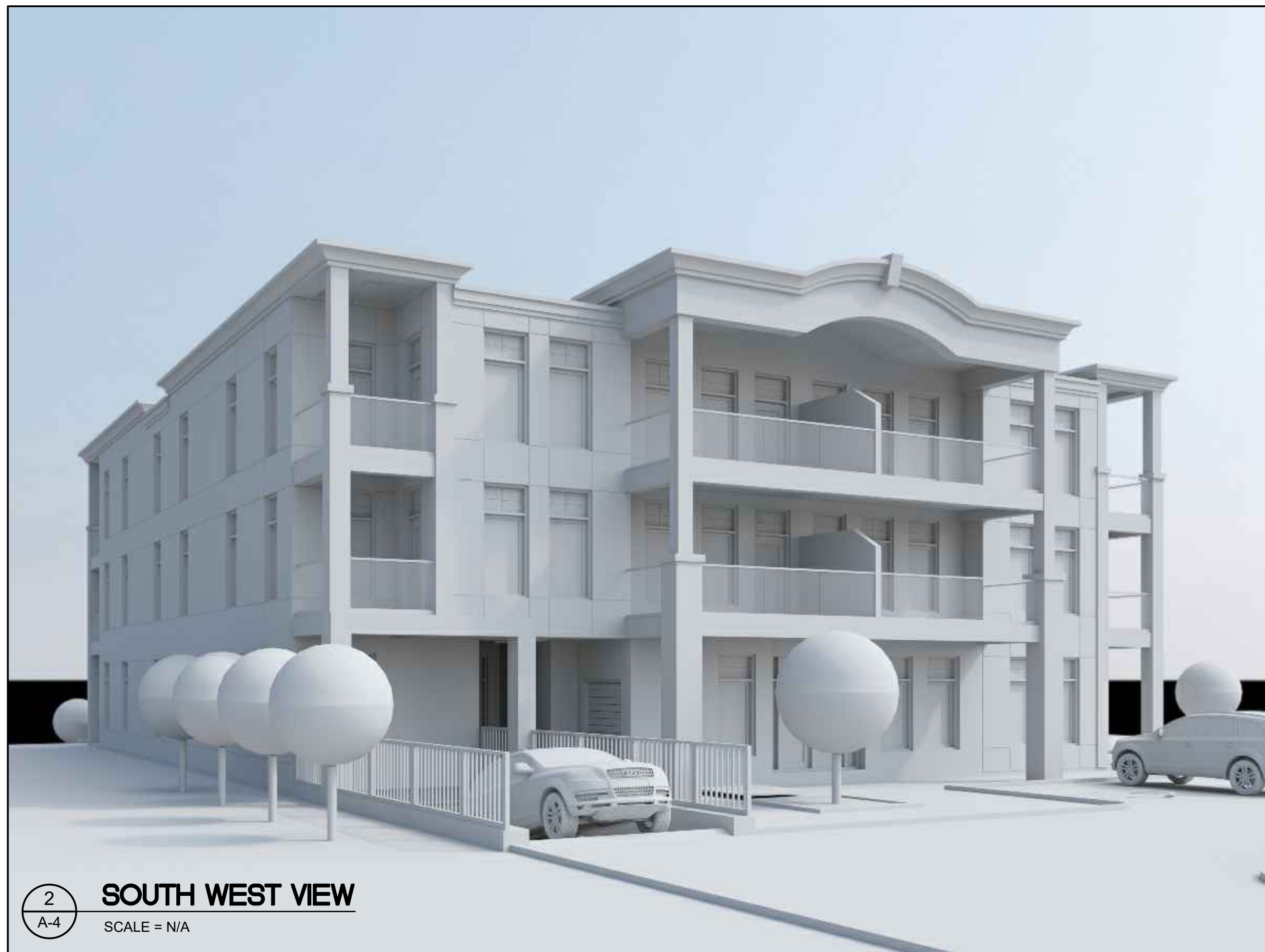
2 SOUTH WEST VIEW A-4 SCALE = N/A