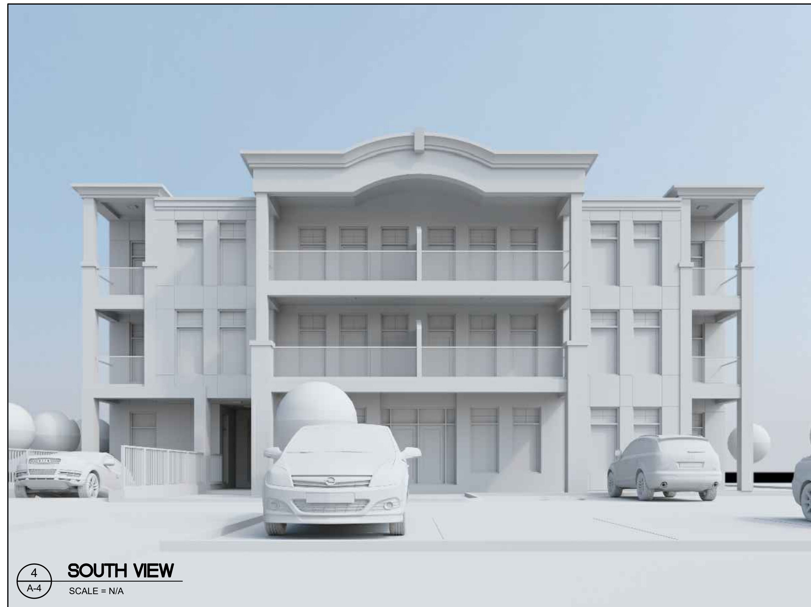
4 SOUTH VIEW A-4 SCALE = N/A