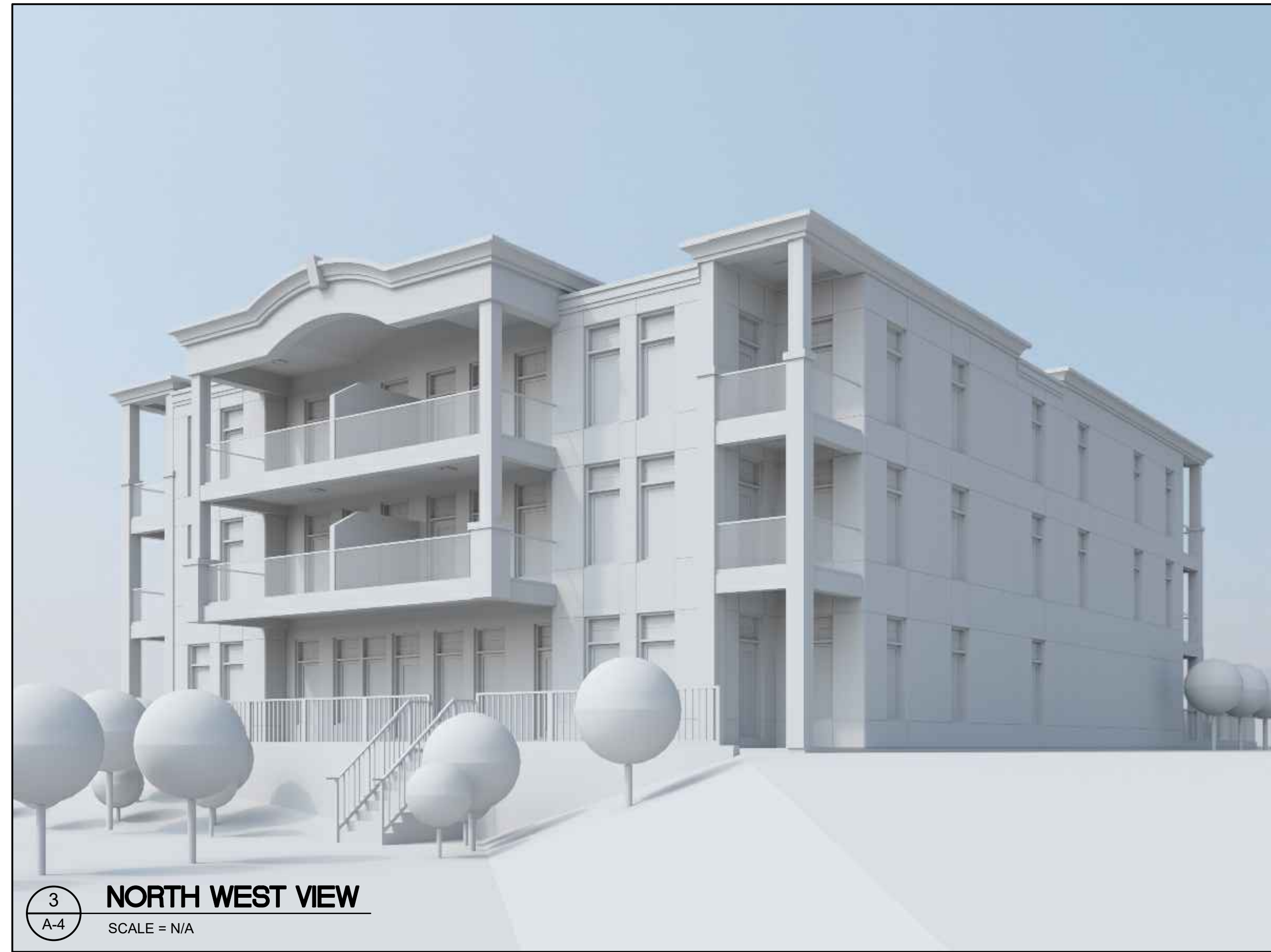
3 NORTH WEST VIEW A-4 SCALE = N/A