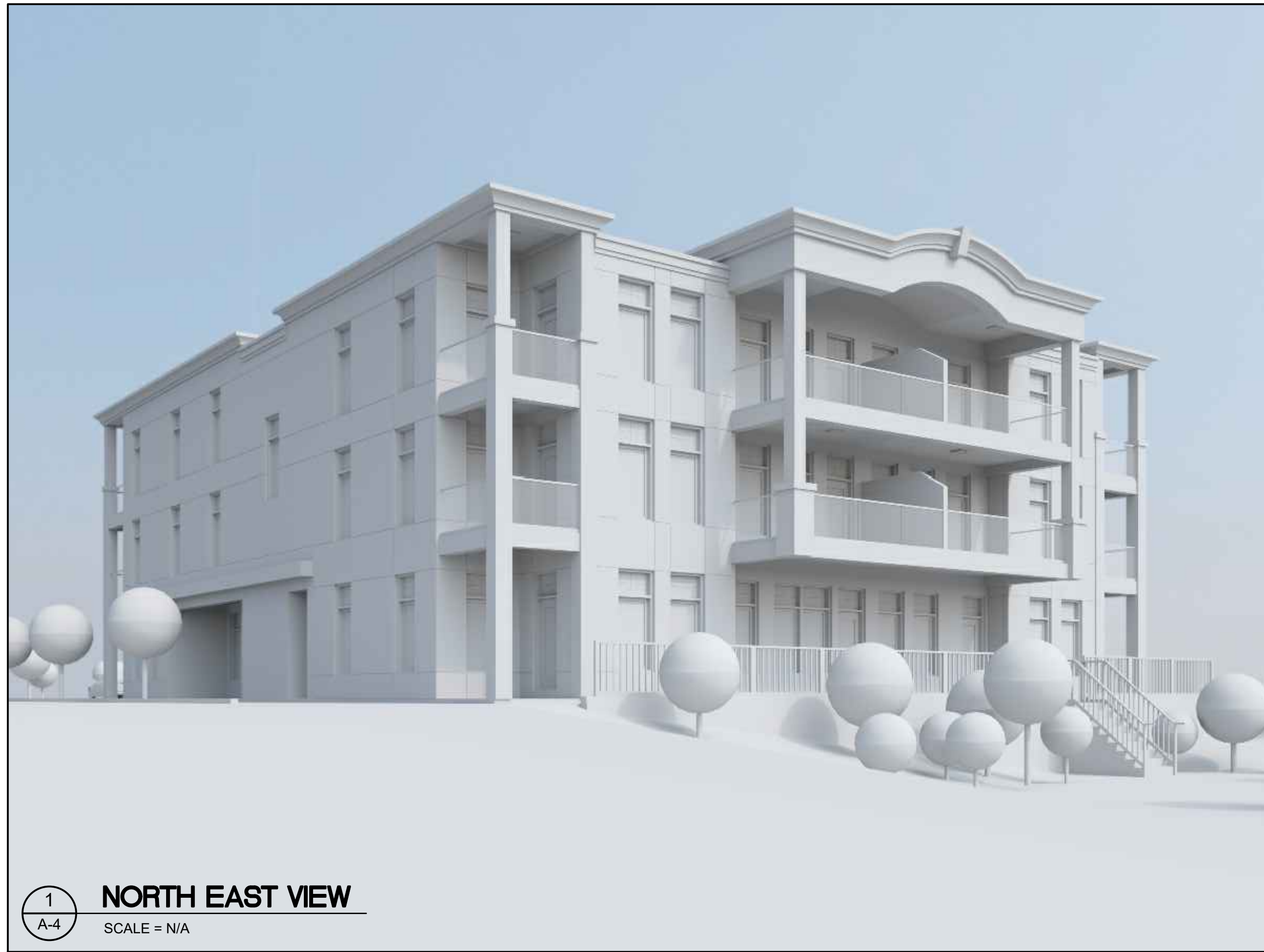
1 NORTH EAST VIEW A-4 SCALE = N/A