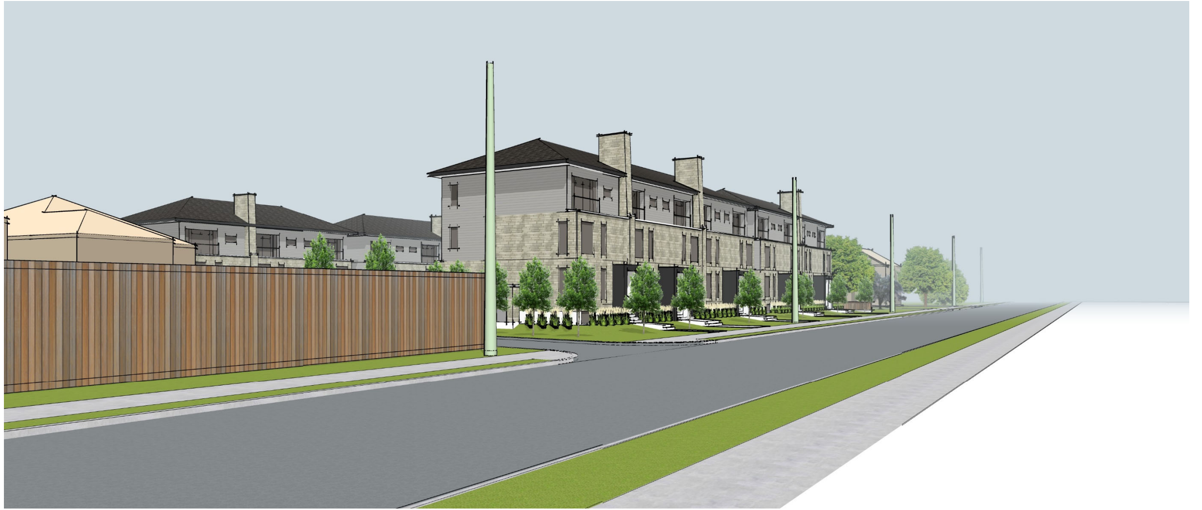
Looking east from Renaud Street