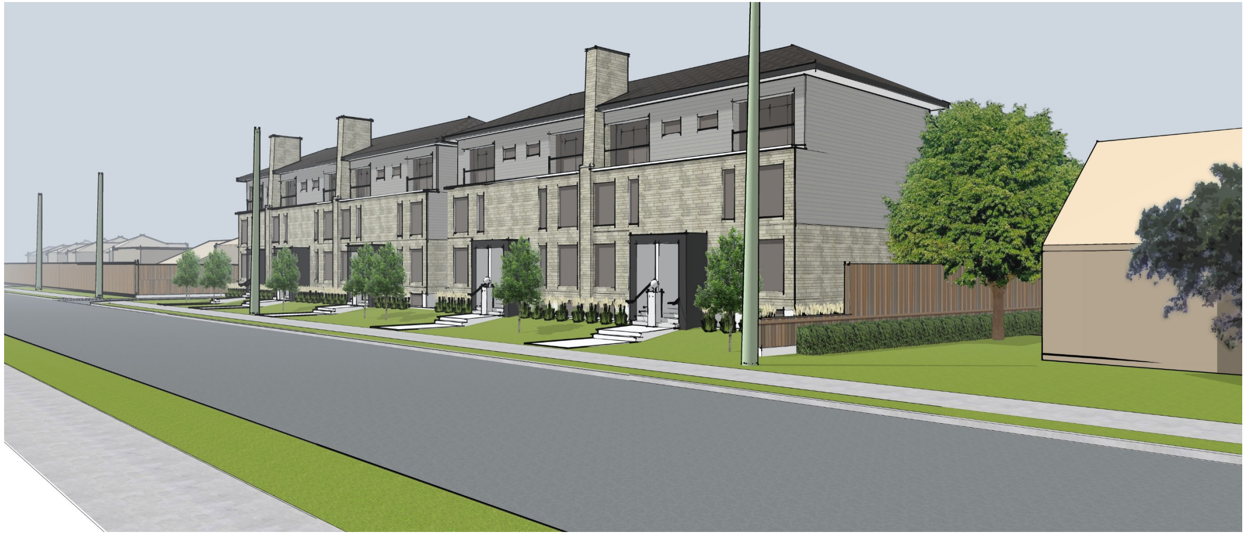
Looking west from Renaud Street