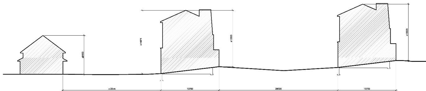
1 CONTEXT SECTION A300 1:150