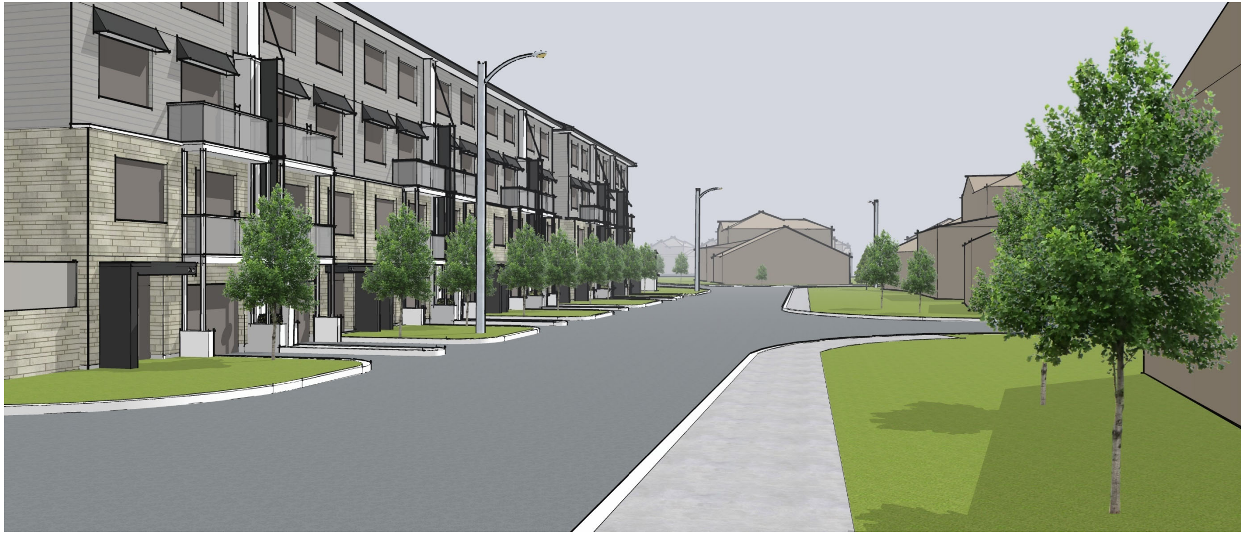
Looking west from Ziegler Street