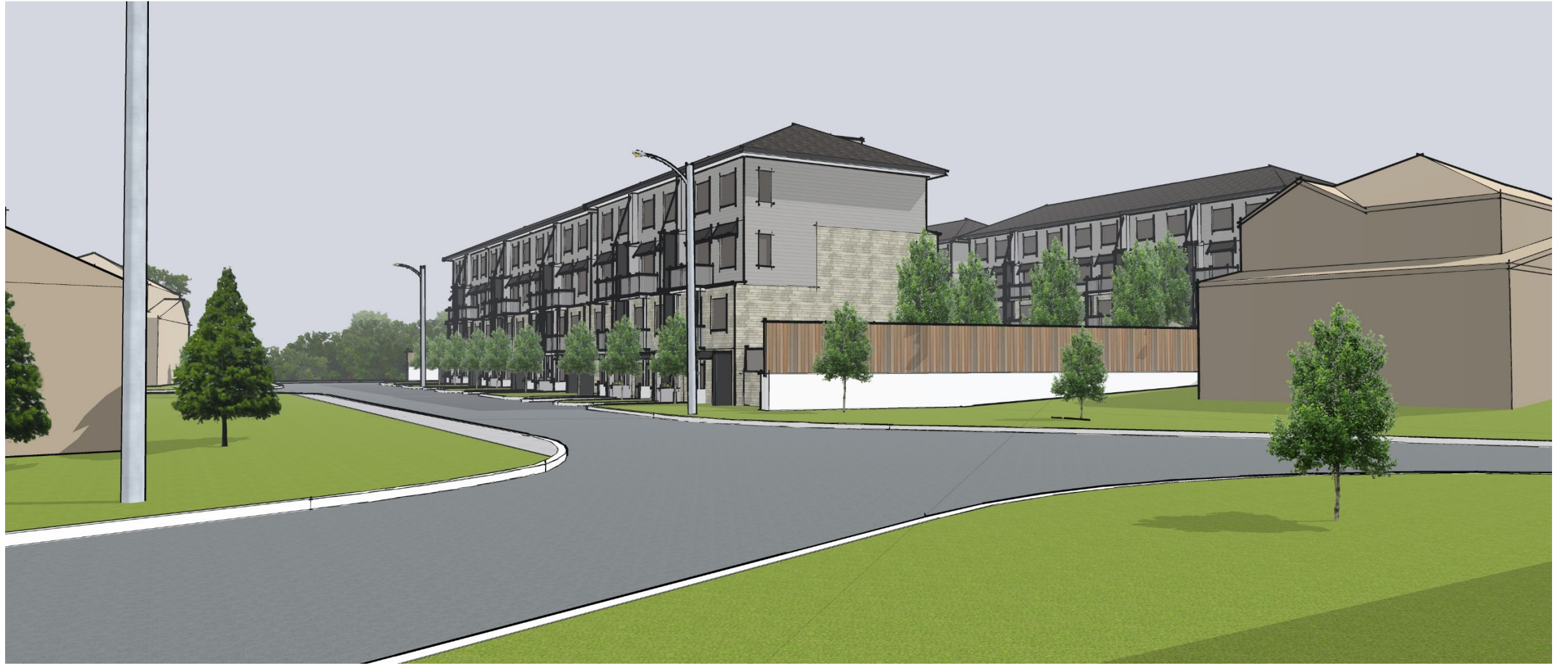
Looking east from Ziegler Street