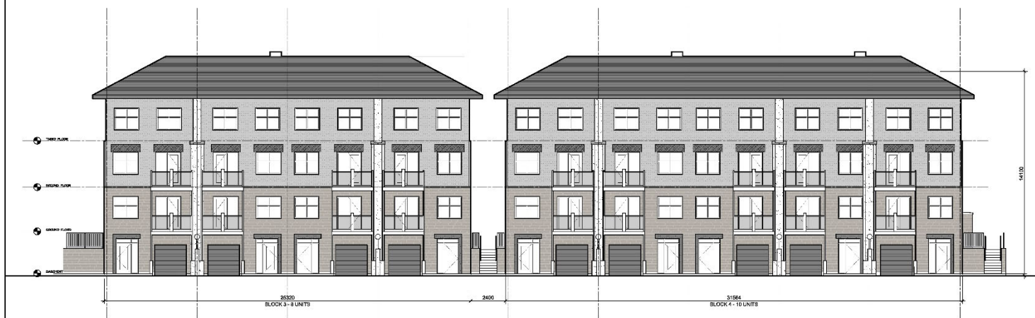
BLOCK 3 AND 4 2 NORTH ELEVATION 1: 100