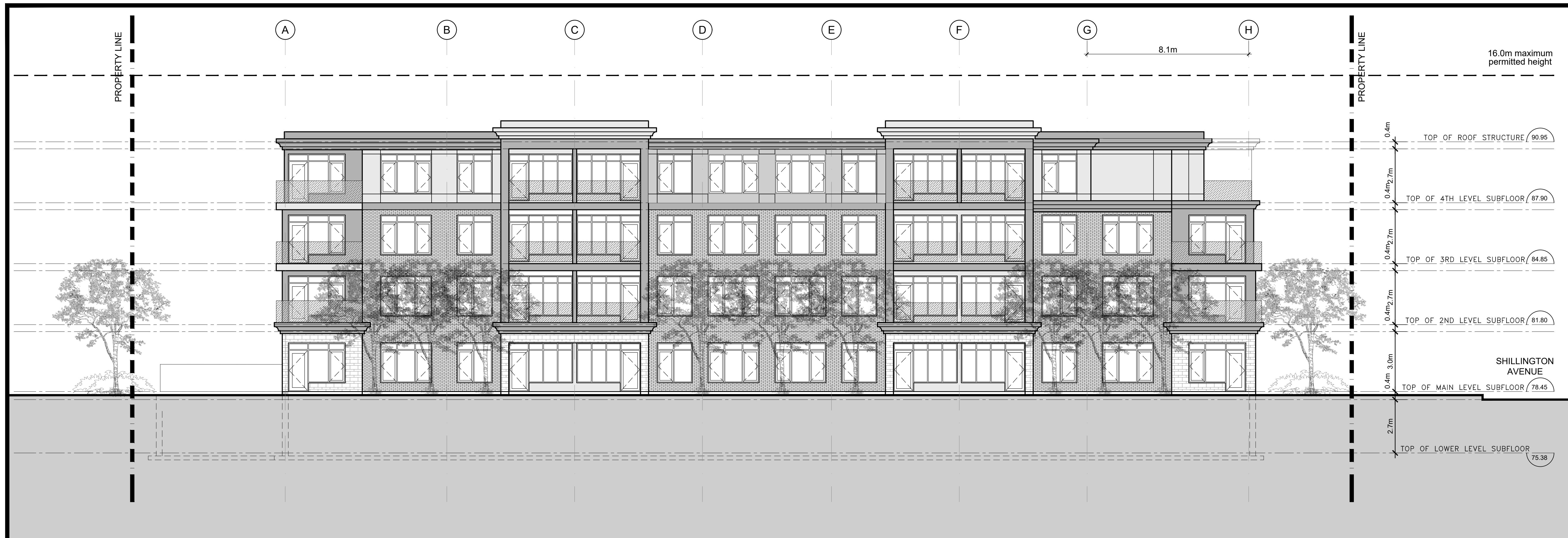
ELEVATION ALONG ALEXANDER PARK