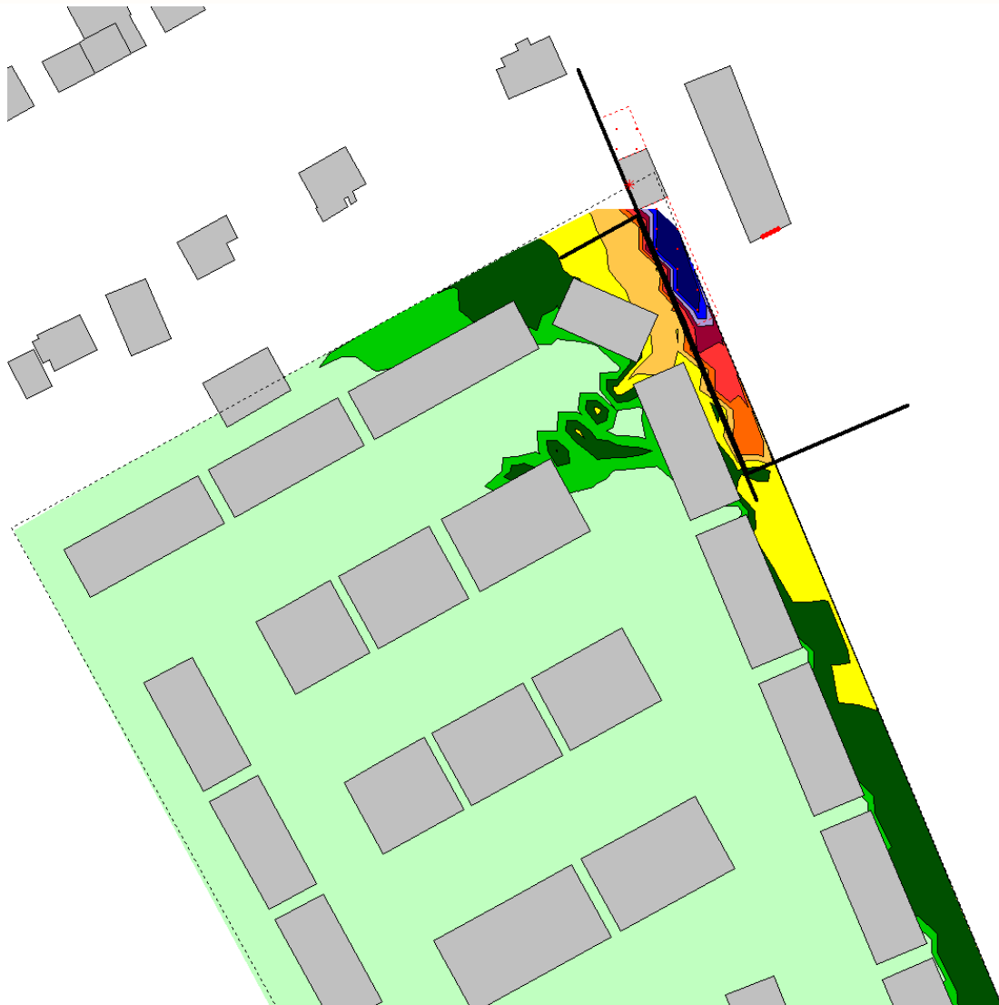
FIGURE 4: DAYTIME STATIONARY NOISE CONTOURS (1.5 M ABOVE GRADE)