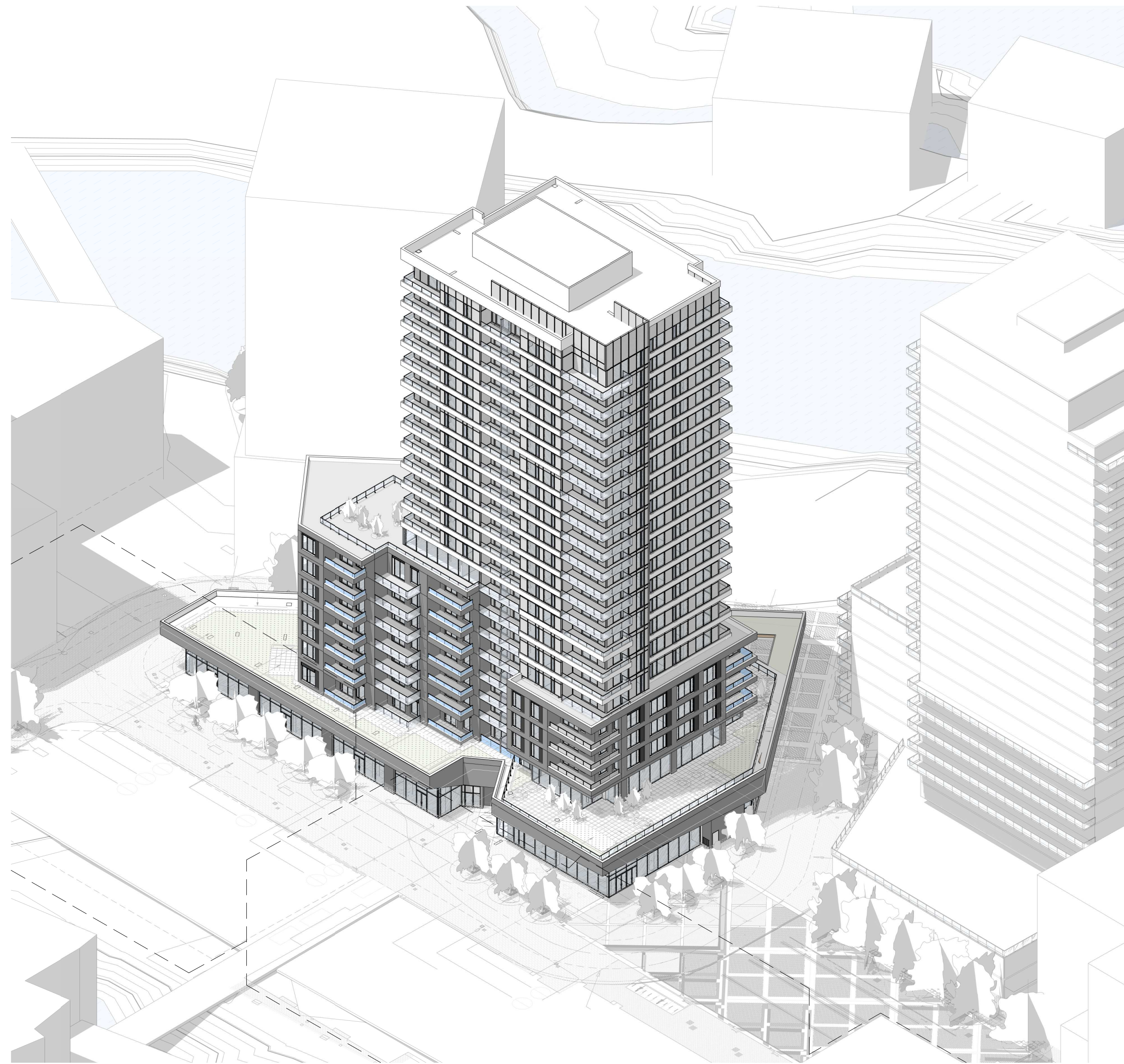
3D - SOUTH EAST AXONOMETRIC

Architect NEUF architect(e)s CANADA INC. 47 Clarence St. Suite 406, Ottawa, ON K1N 9K1 NEUF ARCHITECTS