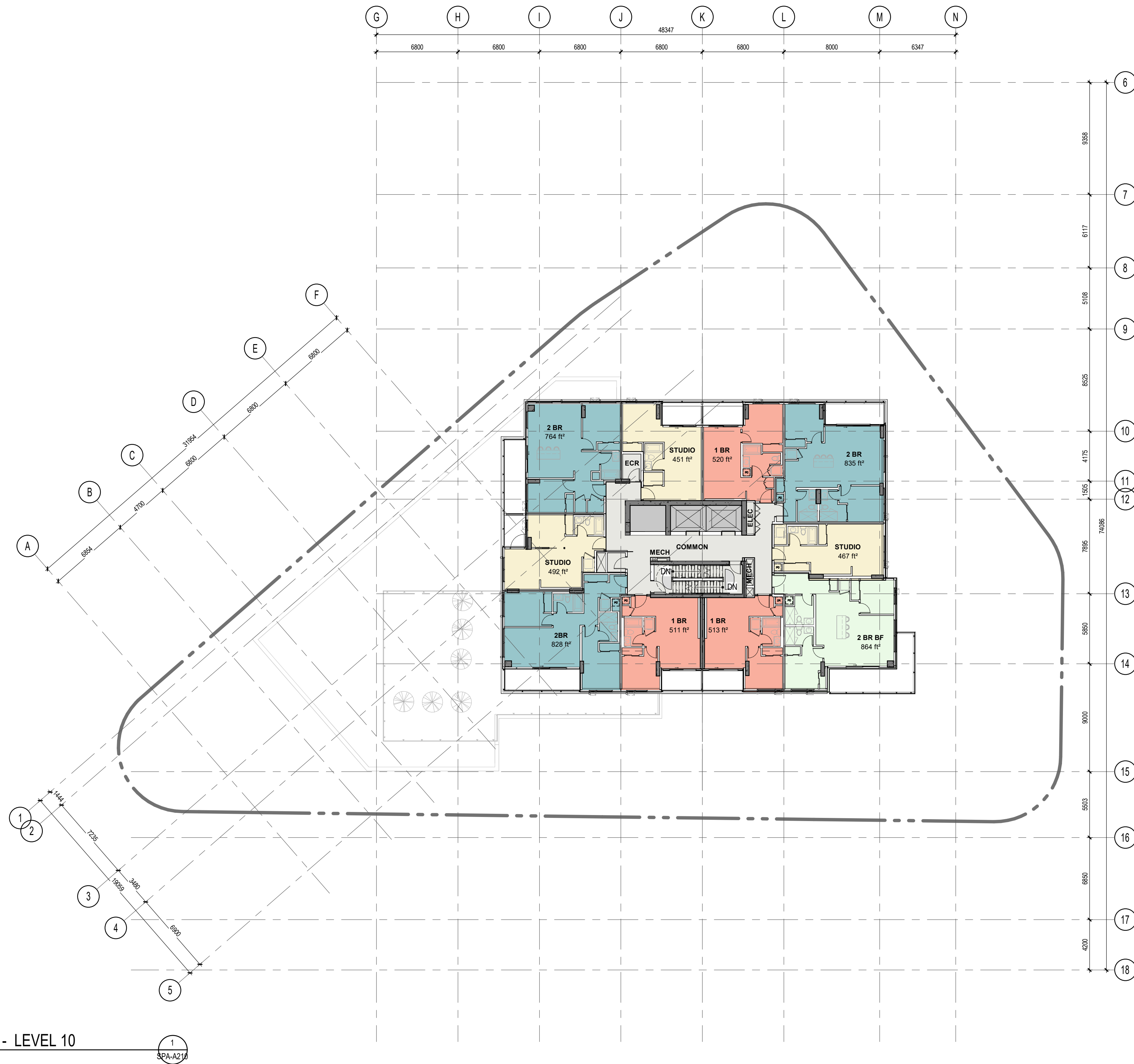
OVERALL PLAN - LEVEL 10 1 : 200