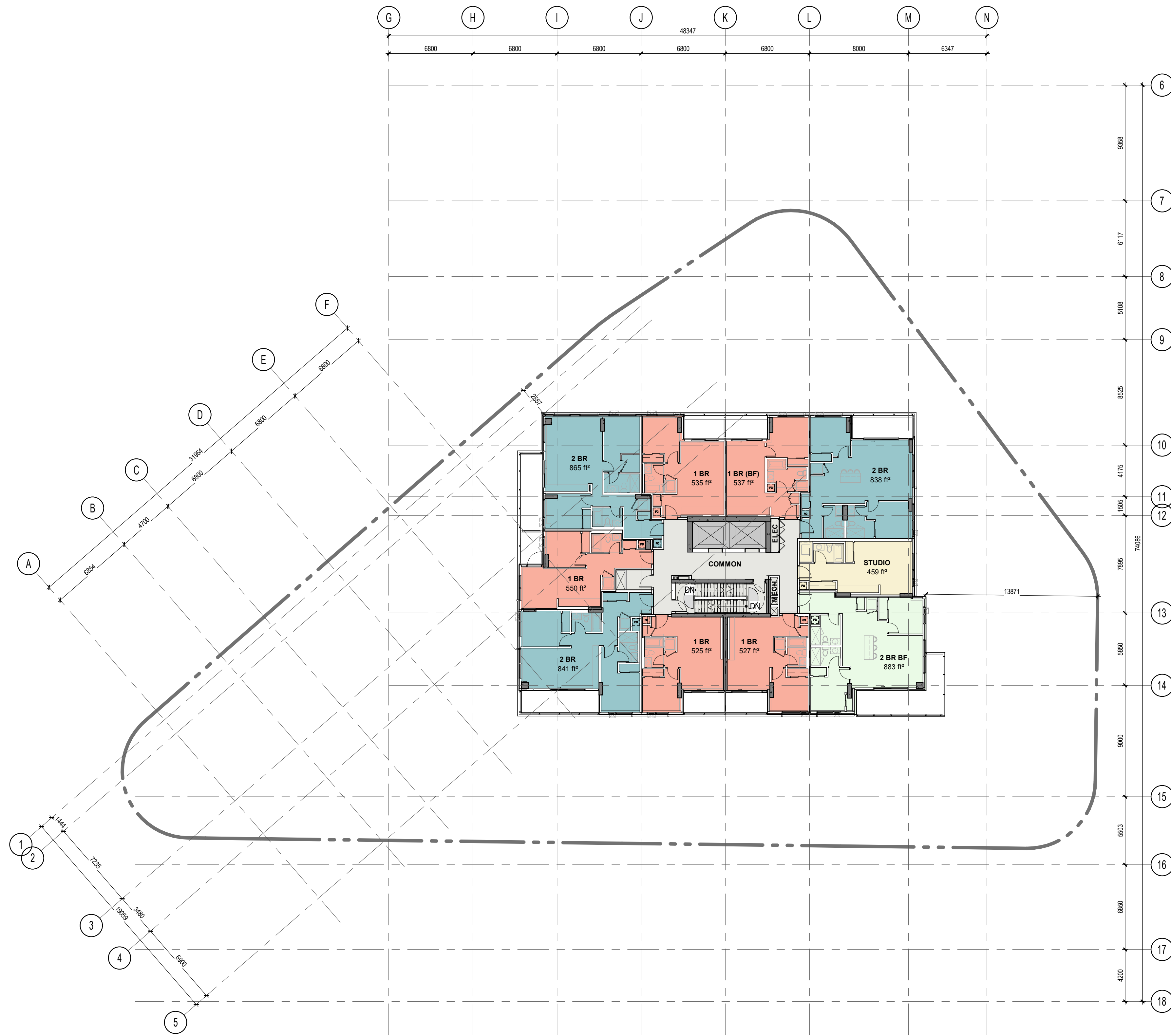
OVERALL PLAN - LEVEL 11-22 1:200