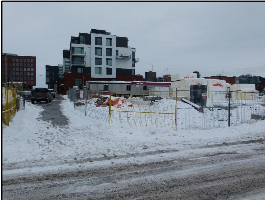
Photograph 3: Looking east at the materials storage and site trailers within the southern part of the Site. The recently constructed building in Block 205a is visible in the background (February 4 th , 2022).