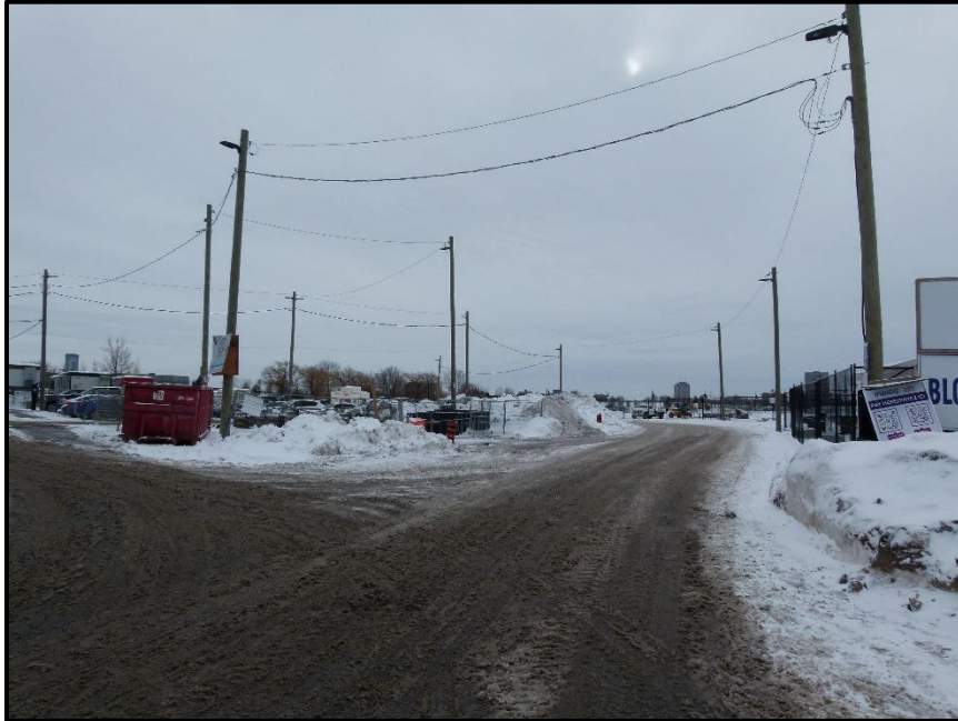
Photograph 1: Looking southeast at the northern part of the Site. The intersection of Chaudière Private and Miwate Private is shown in the foreground (February 4 th , 2022).