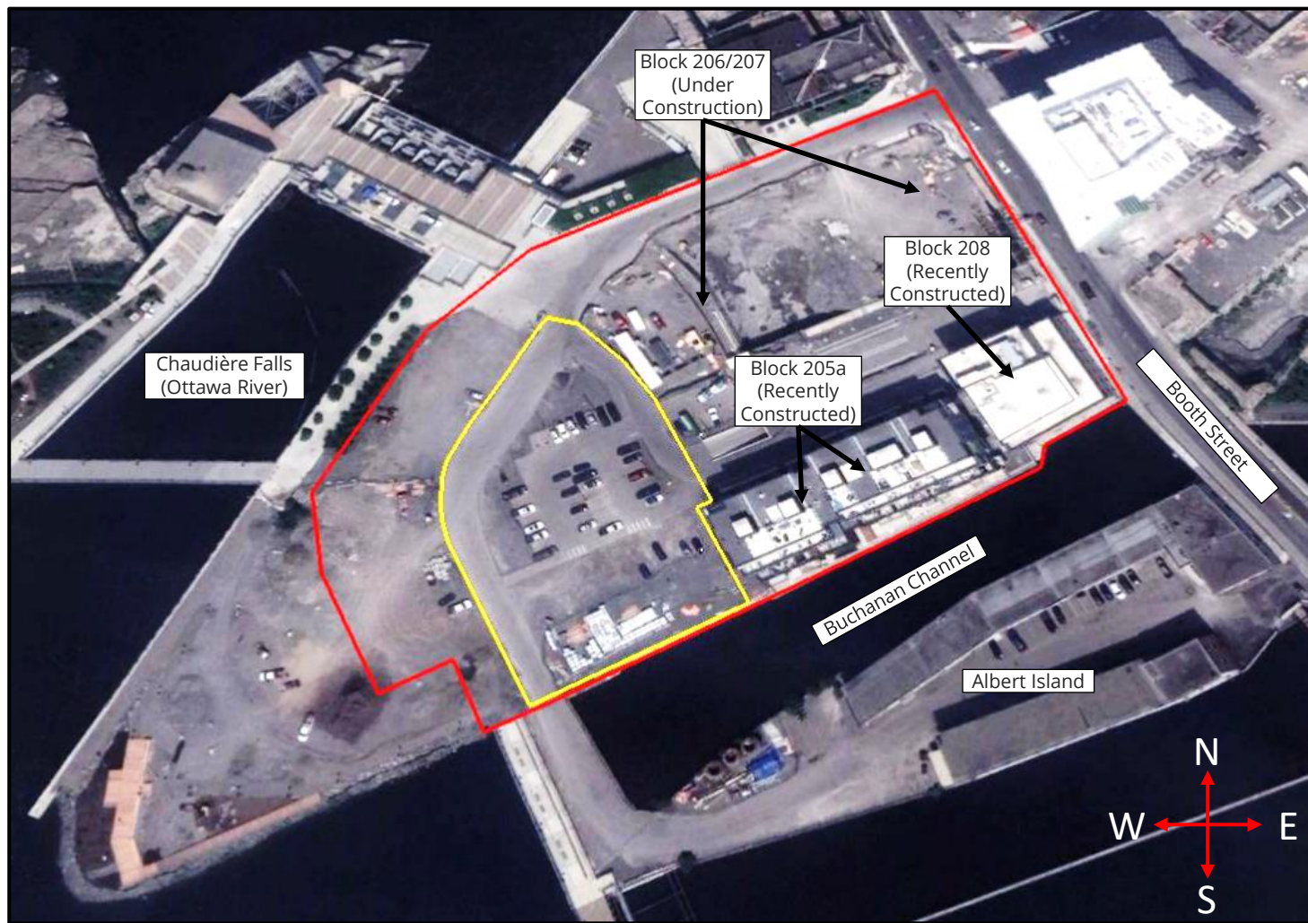
— - Zibi Phase 1 & 2 Study Area — - Block 204a/204b/205b Development Area

Please Note: This is not a legal land survey. All dimensions and locations are shown as approximate.