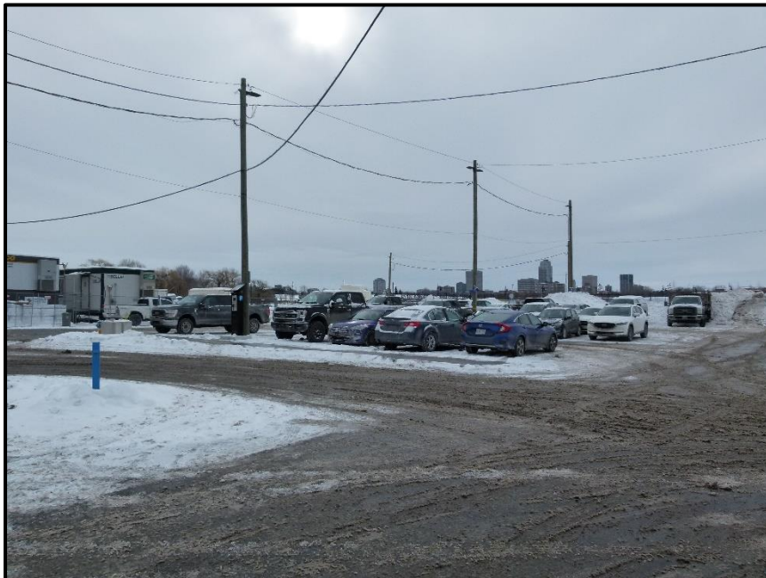
Photograph 2: Looking south at the temporary parking area in the central part of the Site (February 4 th , 2022).