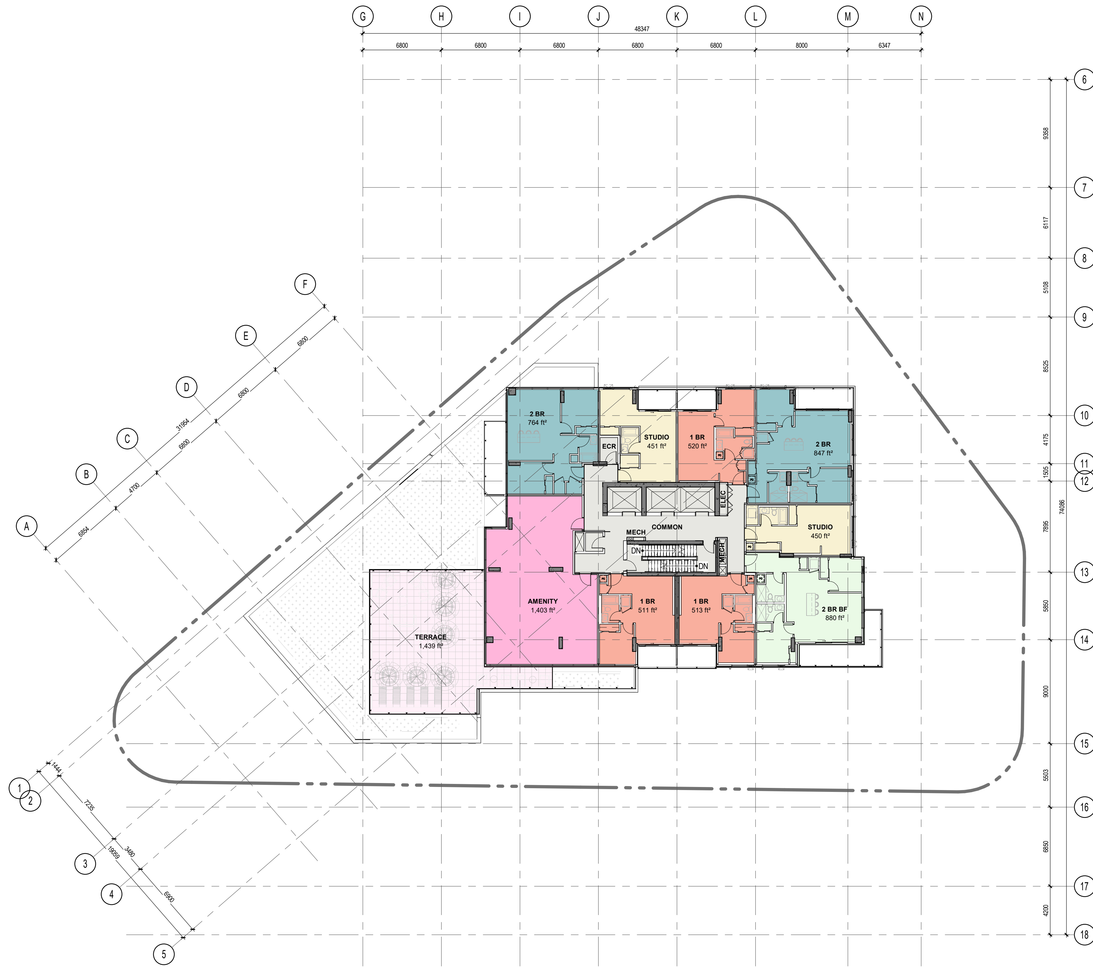
OVERALL PLAN - LEVEL 9 AMENITY 1:200 SPA-A209