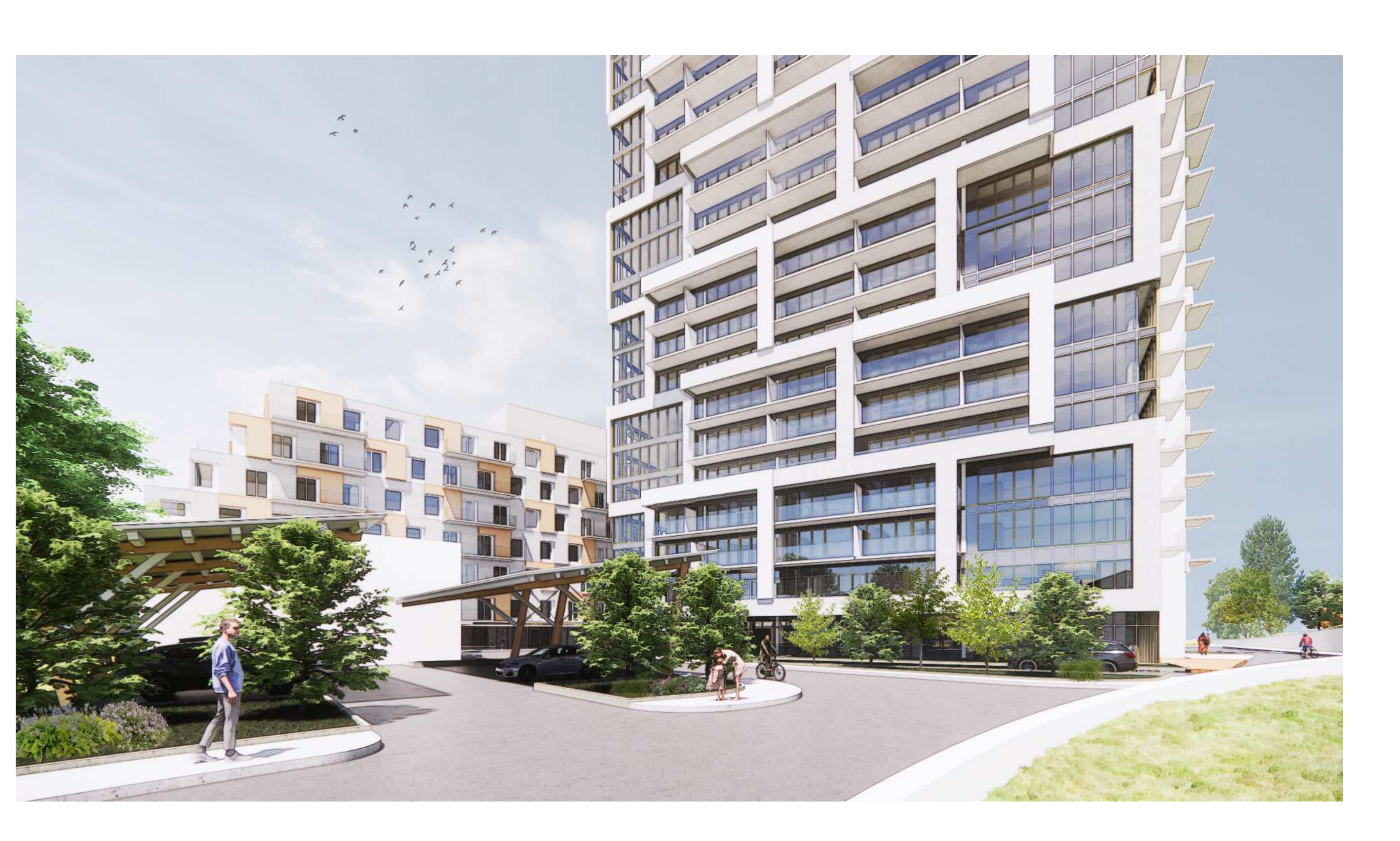
VIEW FROM SOUTH WEST