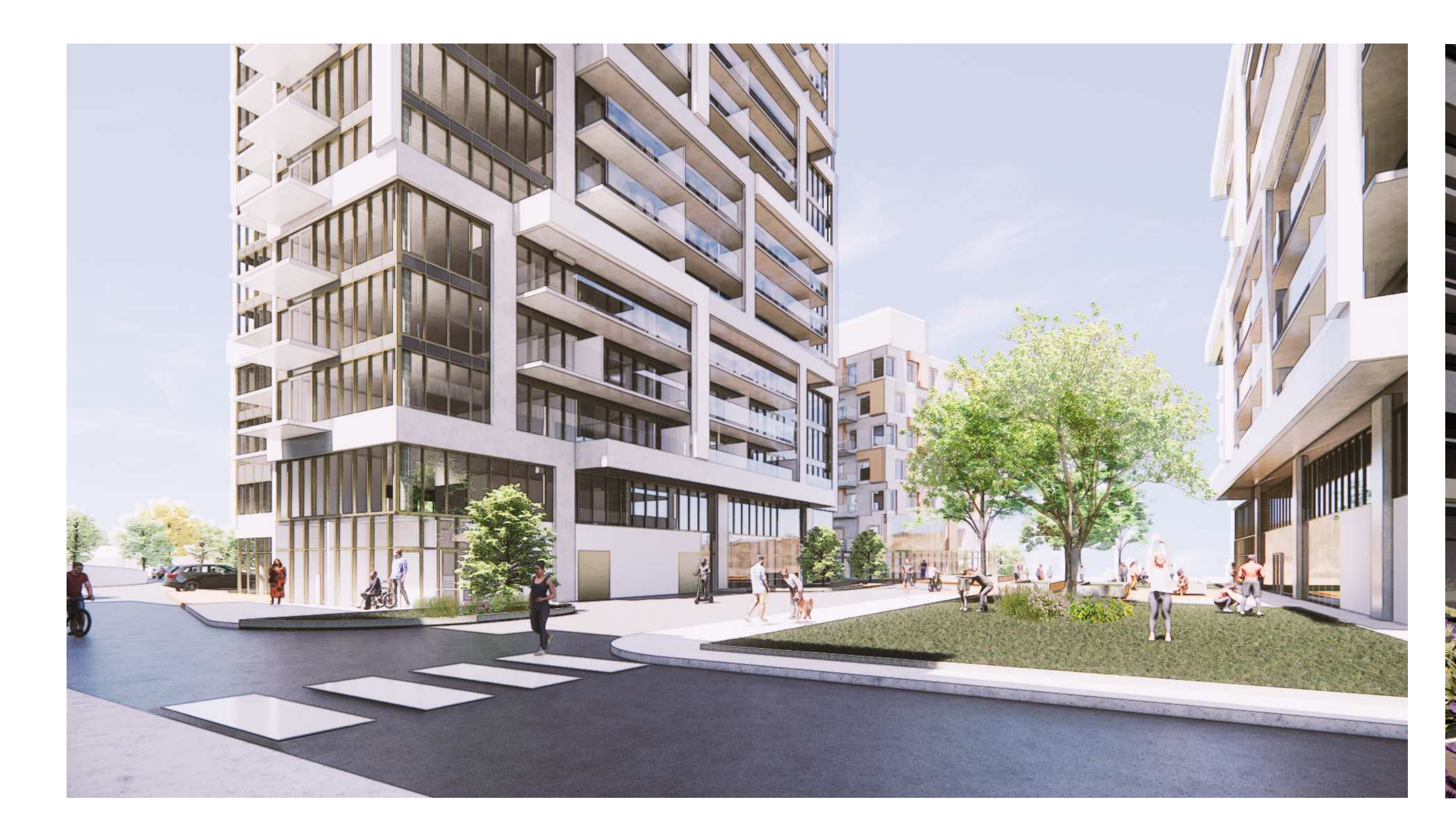
VIEW FROM SOUTH EAST