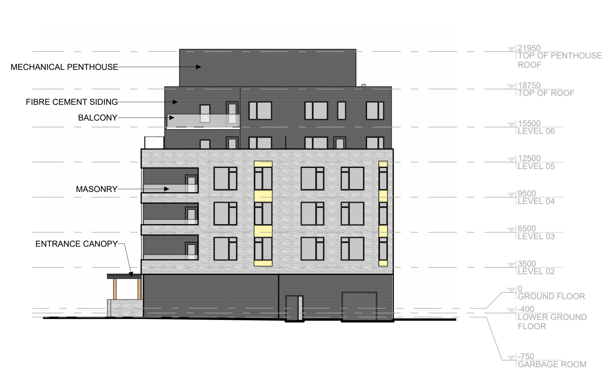
1 North Elevation A.300 | 1:200