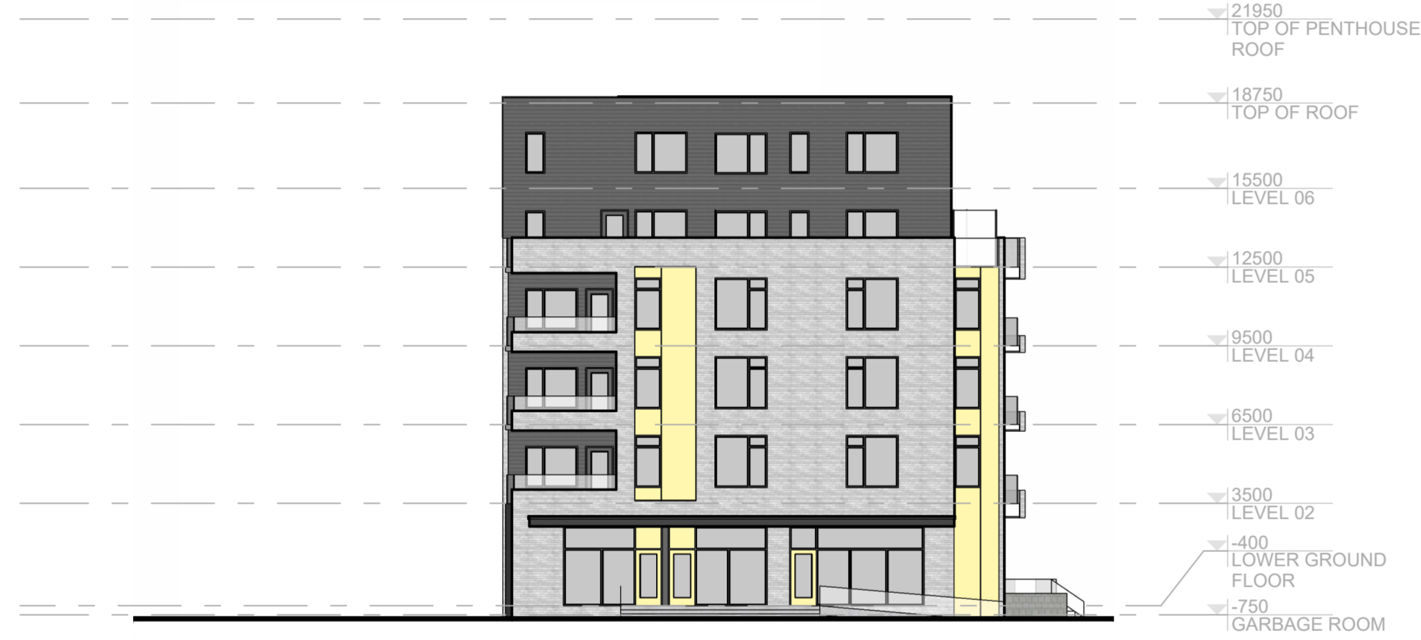
3 SOUTH ELEVATION A.300 | 1:200