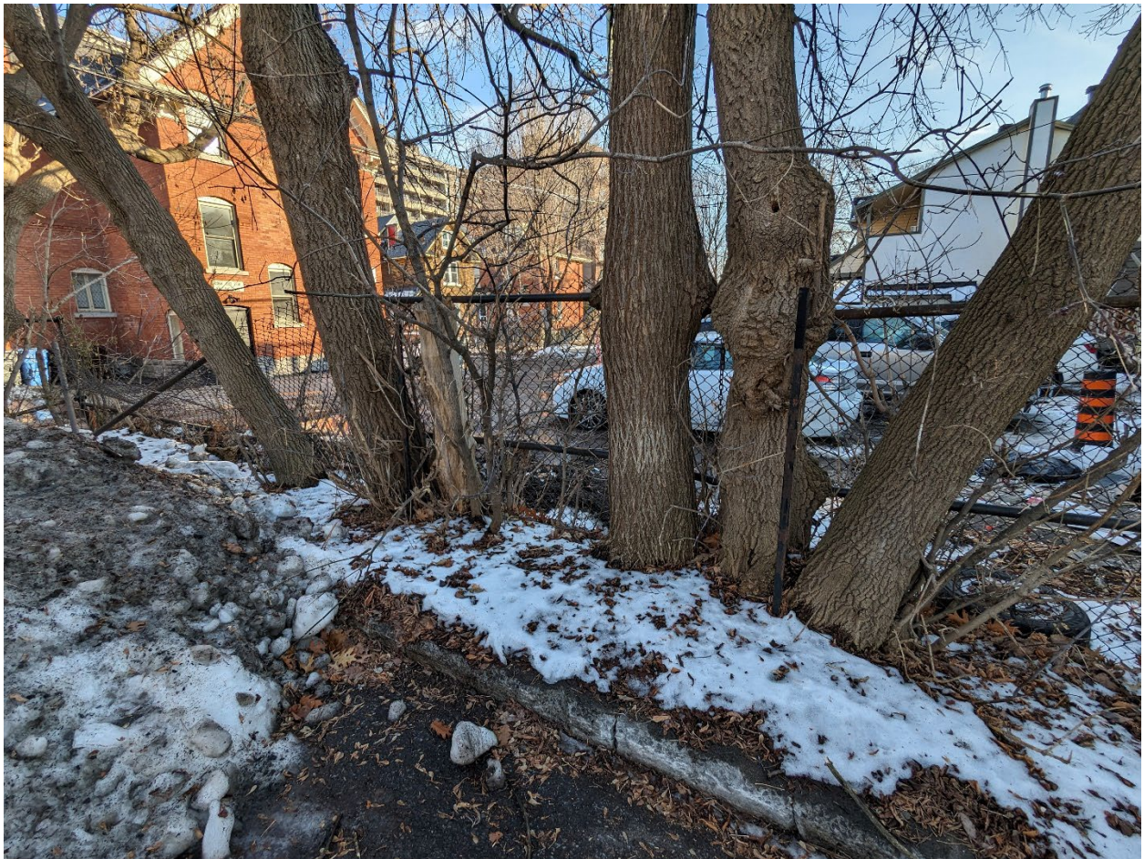
Figure 2: Image showing trees looking from the adjacent property