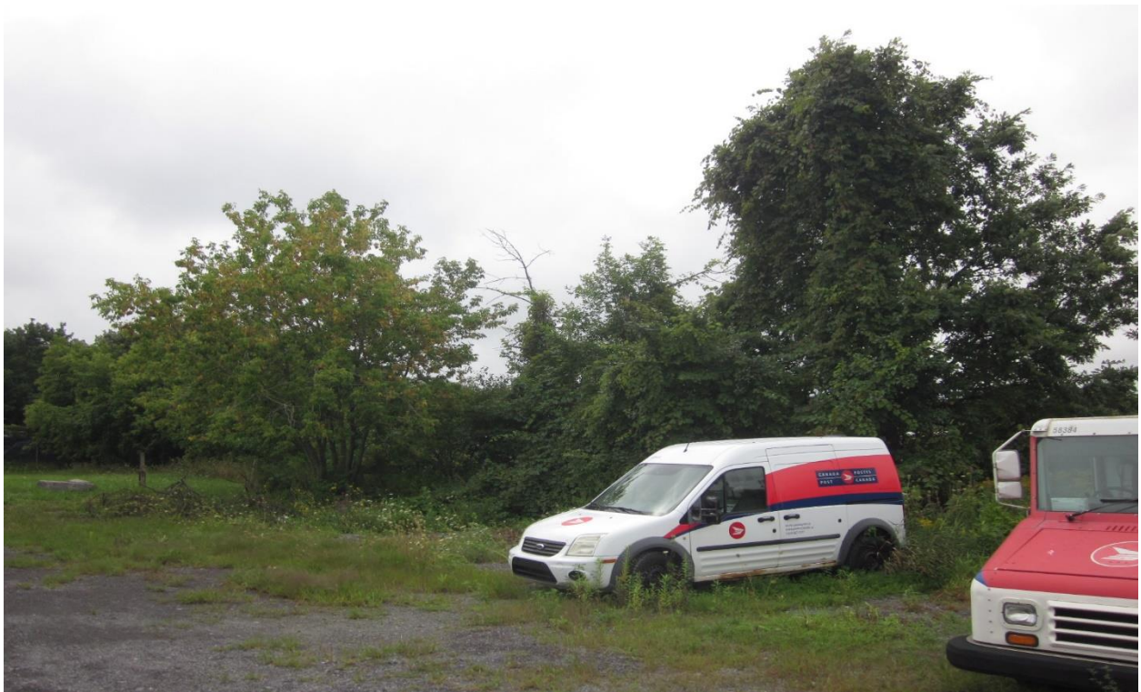
Picture 2. Trees #3, neighbouring grouping of trees (right) and #4 private Manitoba maple (left) at 1400-1410 Youville Drive