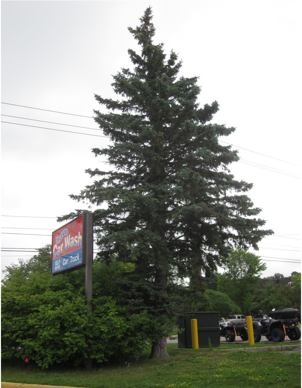
Picture 4. Tree #6, private Colorado spruce at 1400-1410 Youville Drive