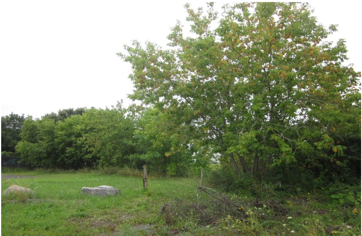
Picture 3. Trees #4, private Manitoba maple (right) and #5 neighbouring line of Manitoba maples (background) 1400-1410 Youville Drive