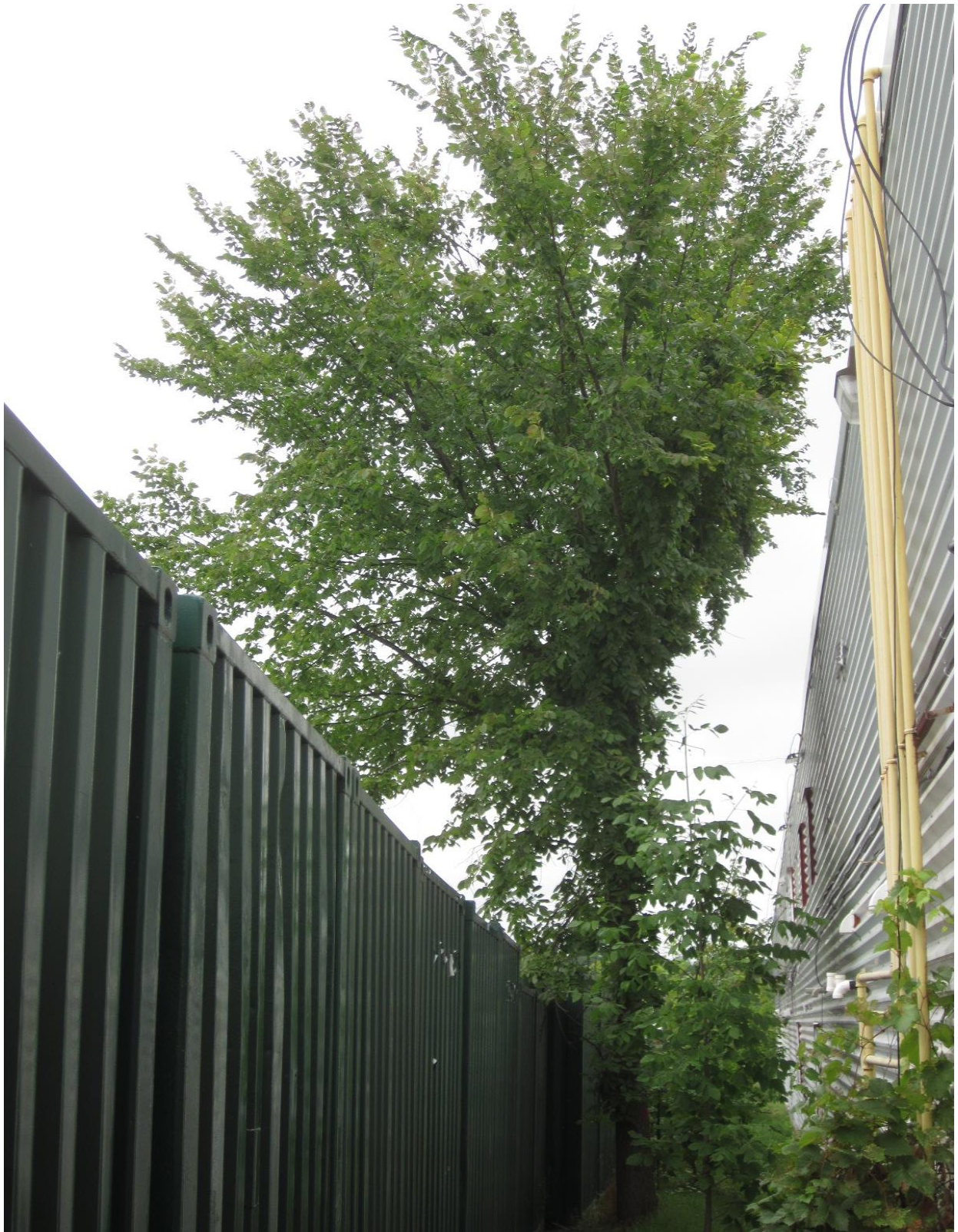
Picture 1. Tree #1, private white elm at 1400-1410 Youville Drive