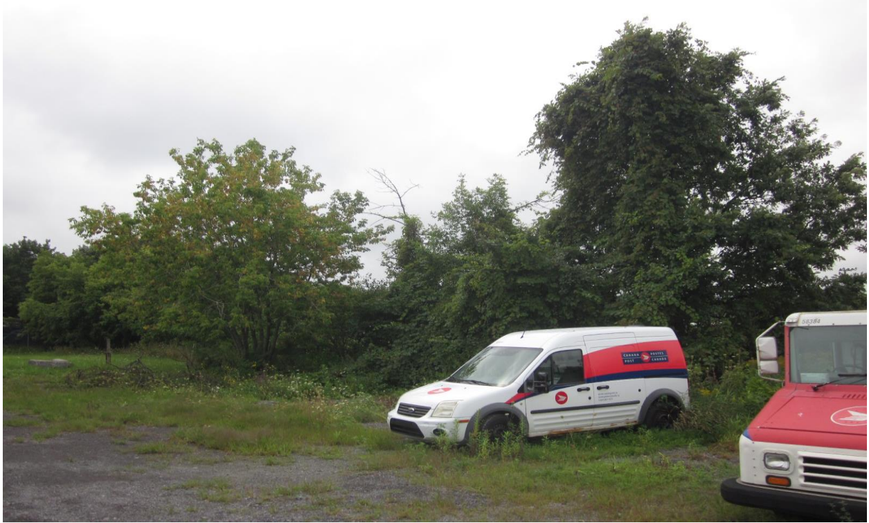
Picture 2. Trees #3, neighbouring oak (right) and #4 private Manitoba maple (left) at 1400-1410 Youville Drive