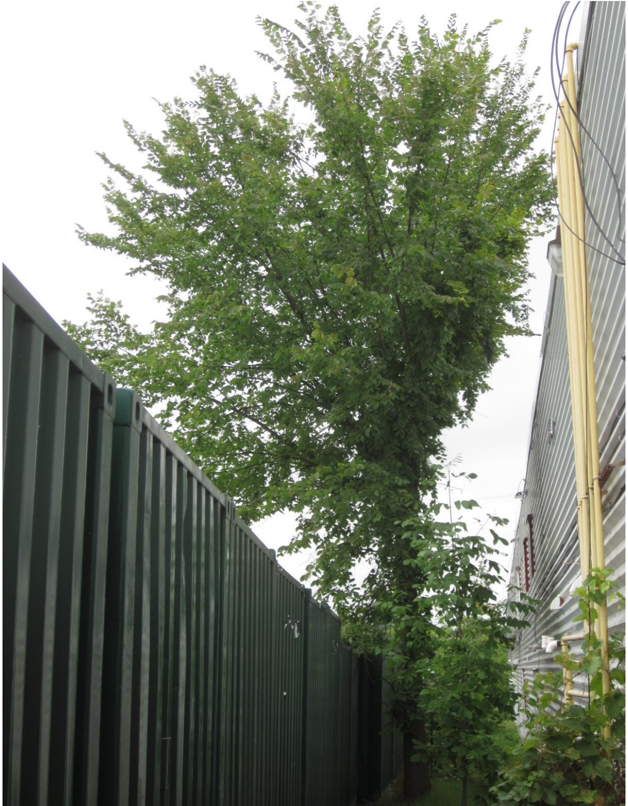
Picture 1. Tree #1, private white elm at 1400-1410 Youville Drive