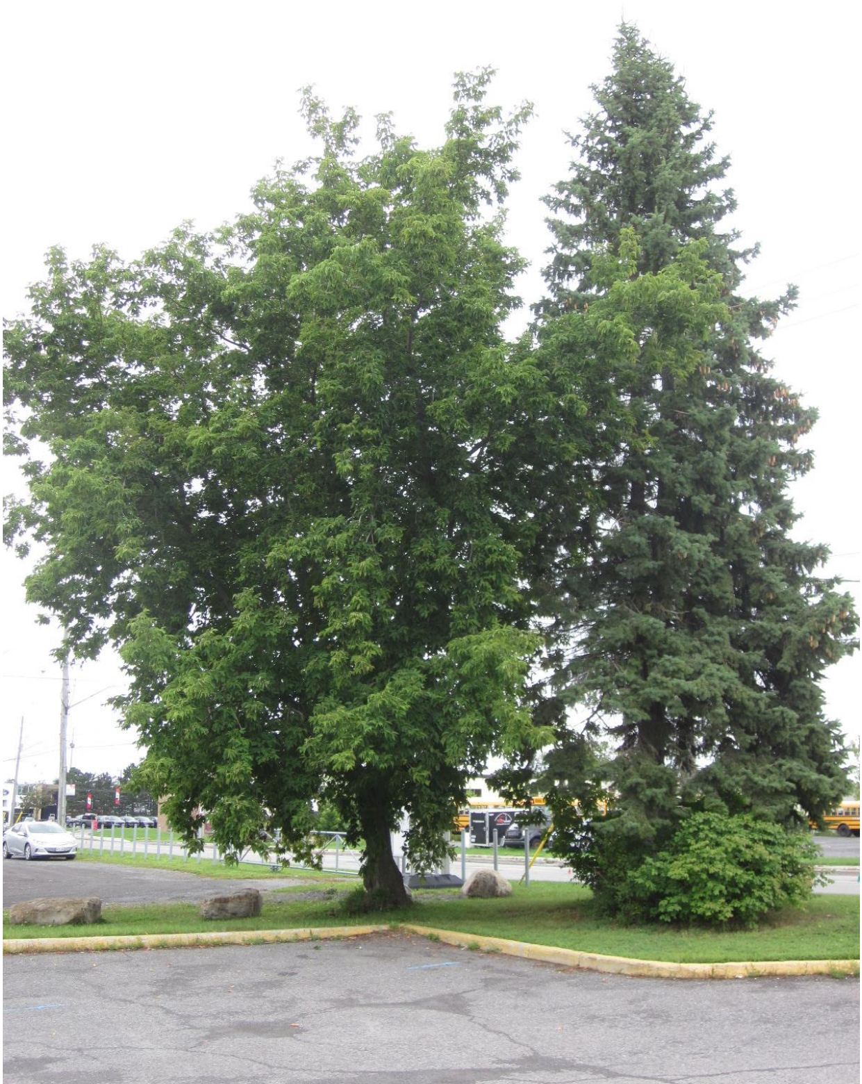
Picture 5. Trees #7 and 8, private Colorado spruce (right) and Manitoba maple at 1400-1410 Youville Drive