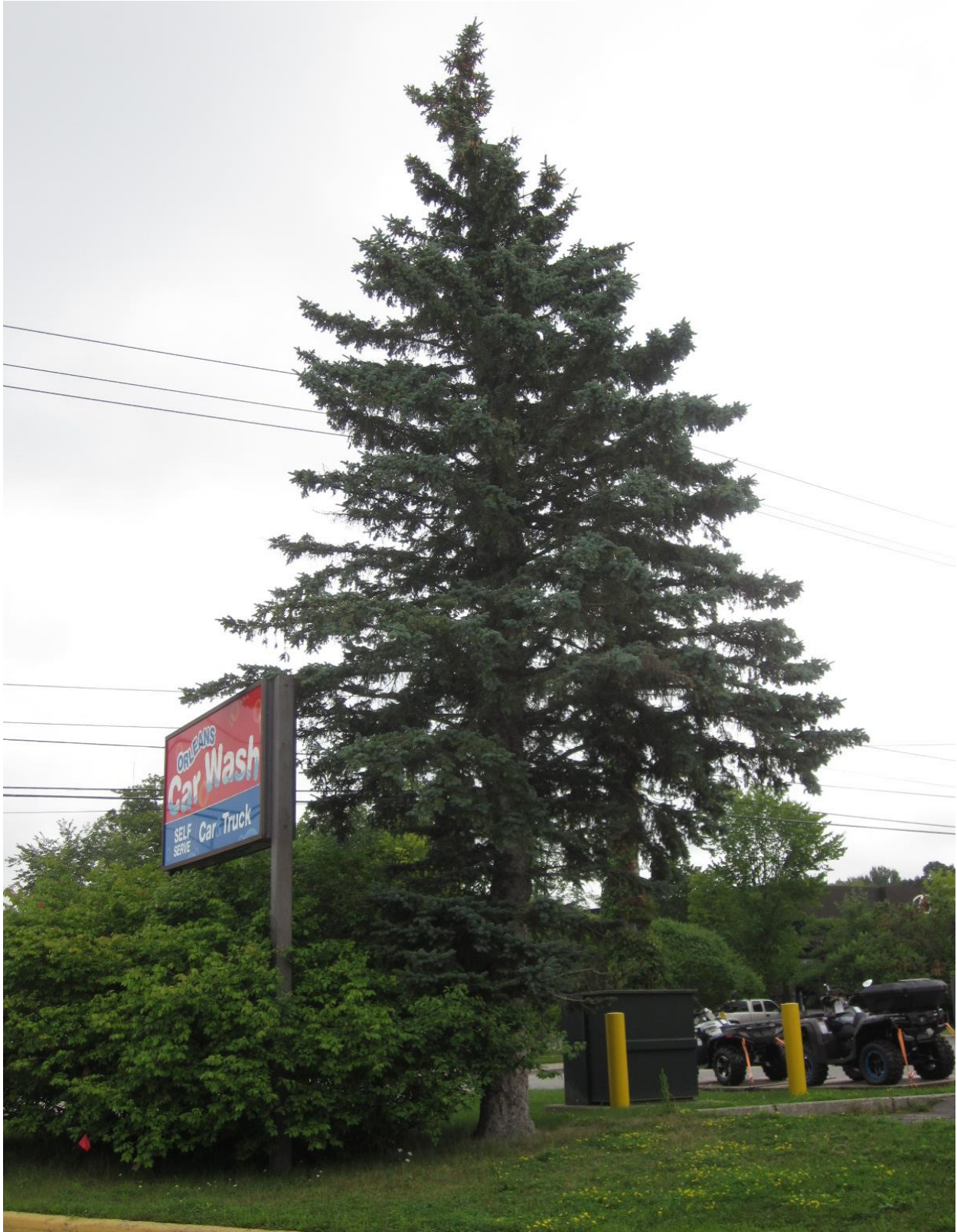
Picture 4. Tree #6, private Colorado spruce at 1400-1410 Youville Drive