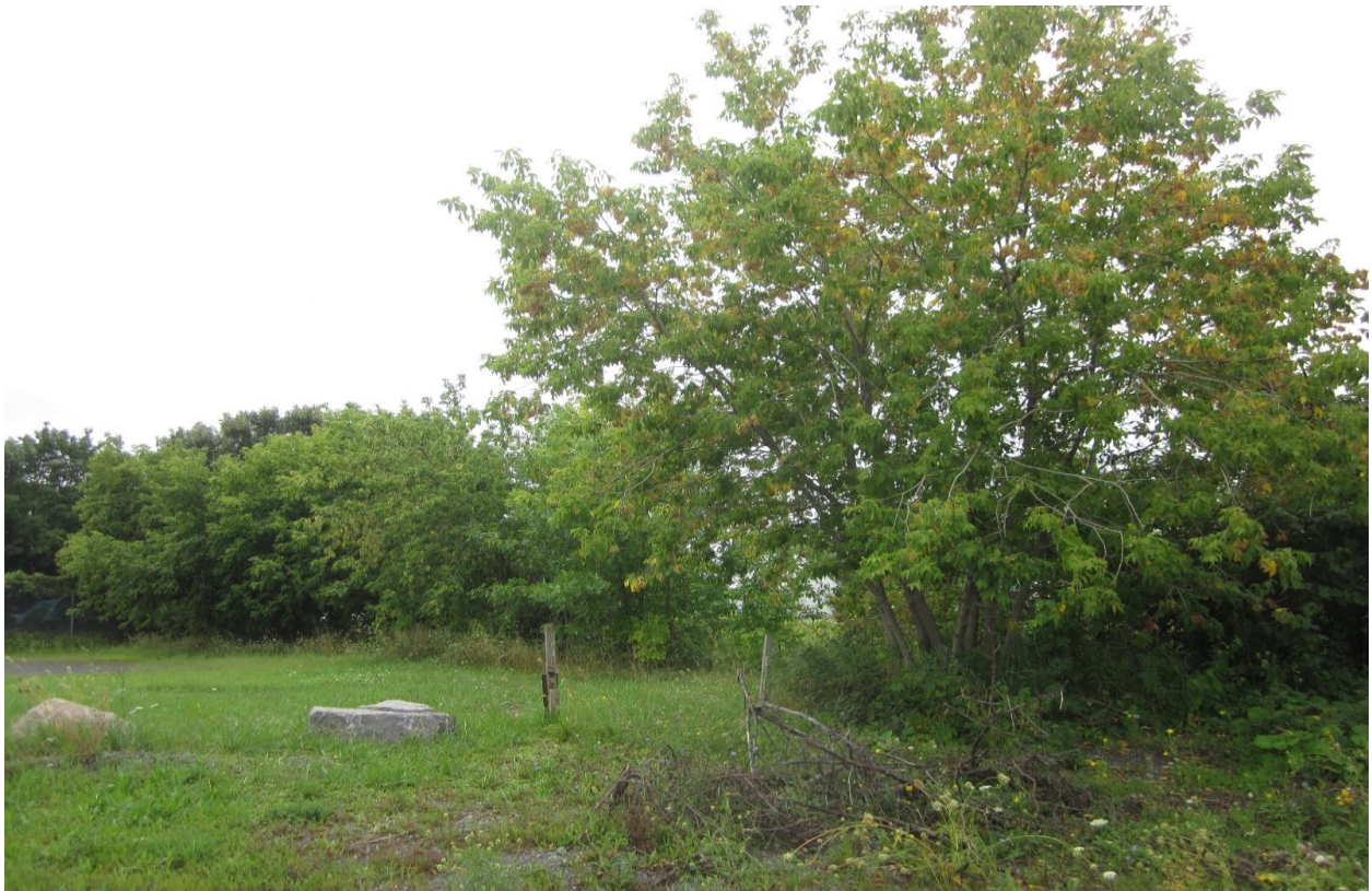
Picture 3. Trees #4, private Manitoba maple (right) and #5 neighbouring line of Manitoba maples (back ground) at 1400-1410 Youville Drive