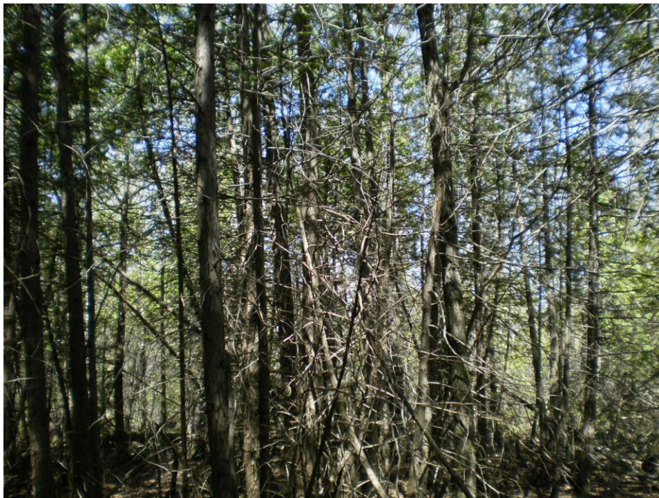
Photo 9 – Upland cedar-poplar mixed forest in the west-central portion of the site. View looking east towards the hydro corridor