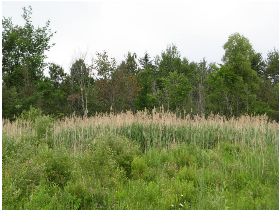
Photo 13 - Robust emergent marsh in the west portion of the site, with view looking northwest to upland mixed forest