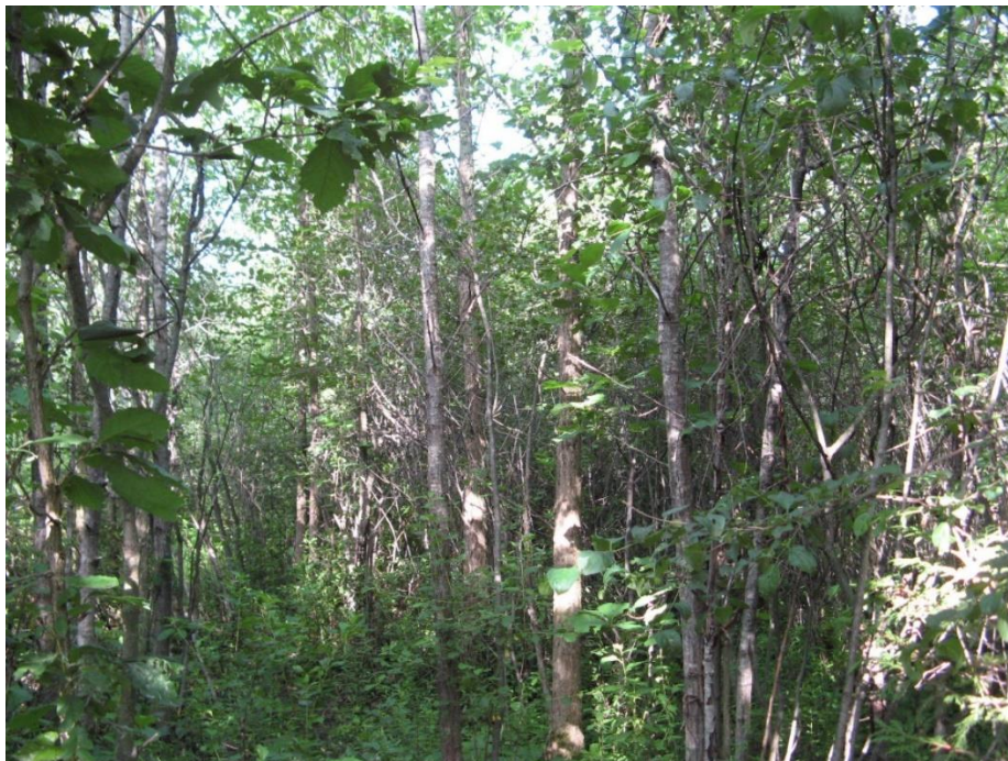
Photo 11 - Thick understory of poplar deciduous forest. This example is in the central portion of the site, with view looking west