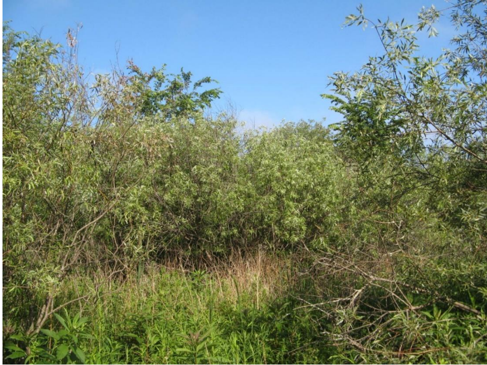
Photo 12 - Willow thicket tall shrub swamp in the central portion of the site, with view looking northwest