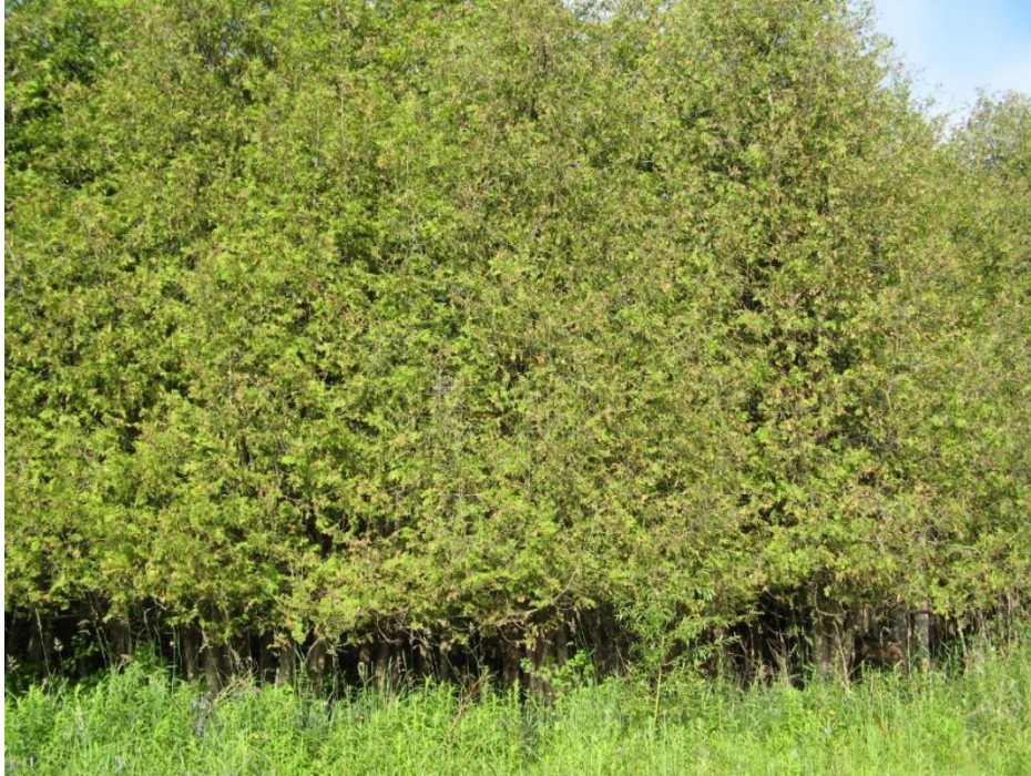
Photo 6 - Typical condition of upland cedar coniferous forest. This example is in the south portion of the site, with view looking north