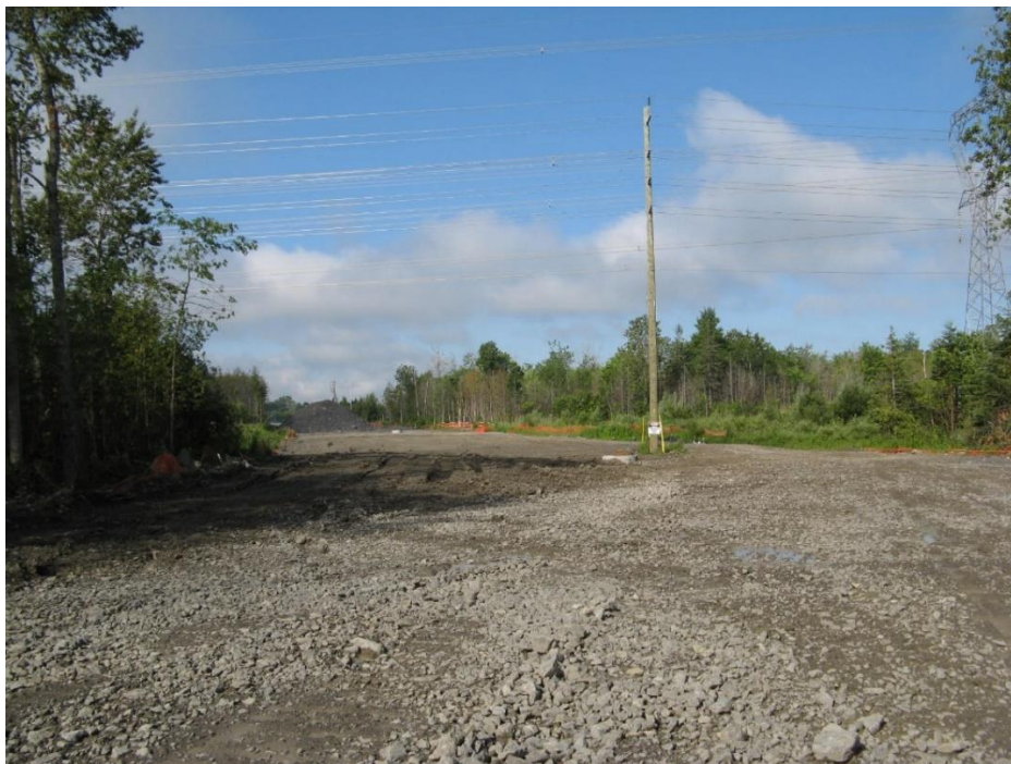
Photo 1 - Cleared servicing corridor in the central portion of the site along the Cope Drive extension, with view looking west to hydro corridor

Dog walkers were reported by Muncaster (2007) as common along trails through and adjacent to the cedar forest and were again common in 2022. Wildlife observations by Muncaster (2007) in the cedar forest included white-tailed deer, woodchuck, American woodcock, ruffed grouse, black-capped chickadee, white-throated sparrow, American robin, northern cardinal, black-and-white warbler, and blue jay. The coniferous forests in the East of Shea Urban Natural Area are about 300 metres wide and thus contain some habitat for area sensitive species and to the north of the Cope Drive extension a limited amount of forest interior habitat. For example, black and white warbler and ruffed grouse were observed in the coniferous forest by Muncaster (2007).