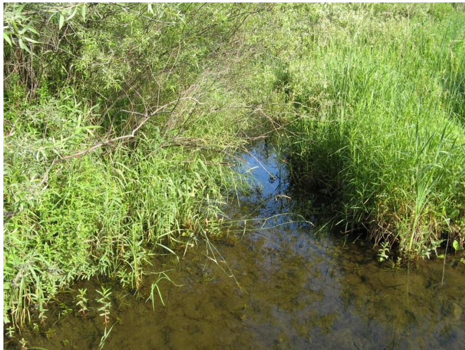
Photo 3 - Channel is wider, with areas of ponding in the willow thicket swamp. View looking west