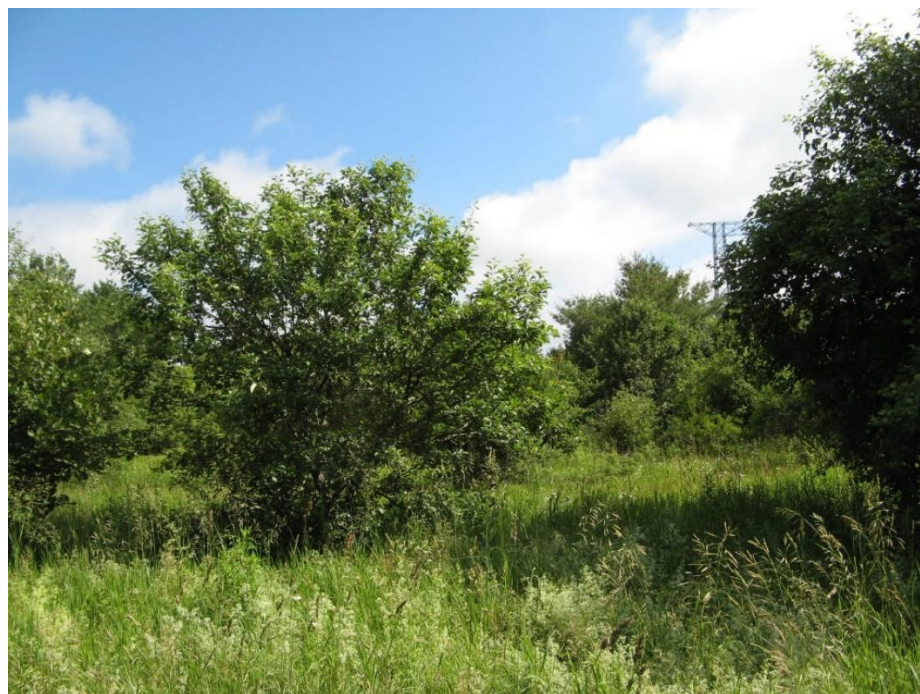
Photo 5 - Cultural thicket in the hydro corridor in the north portion of the site, with view looking east