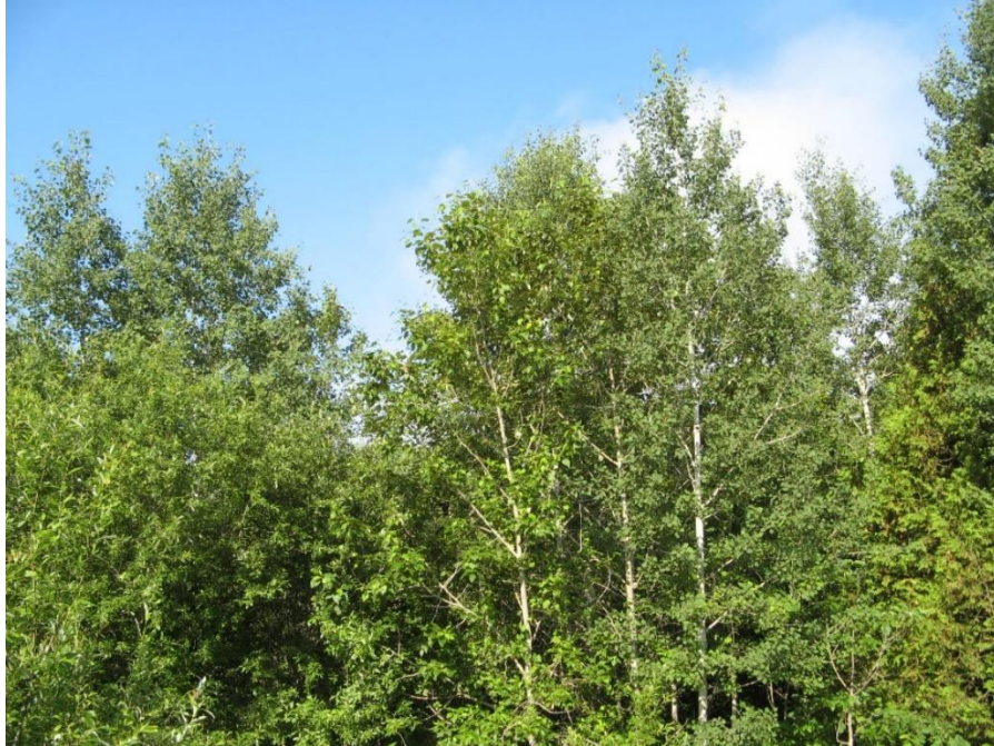
Photo 10 - Upland poplar deciduous forest in the south portion of the site, with view looking west