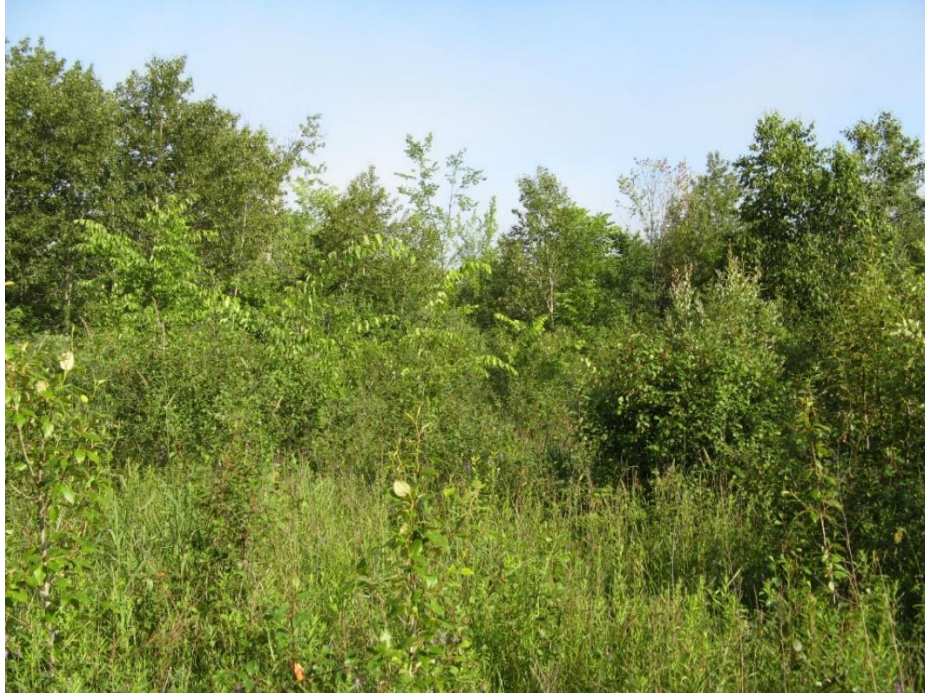
Photo 4 - Typical condition of on-site cultural thickets. This example is in the southeast corner of the site, with view looking north