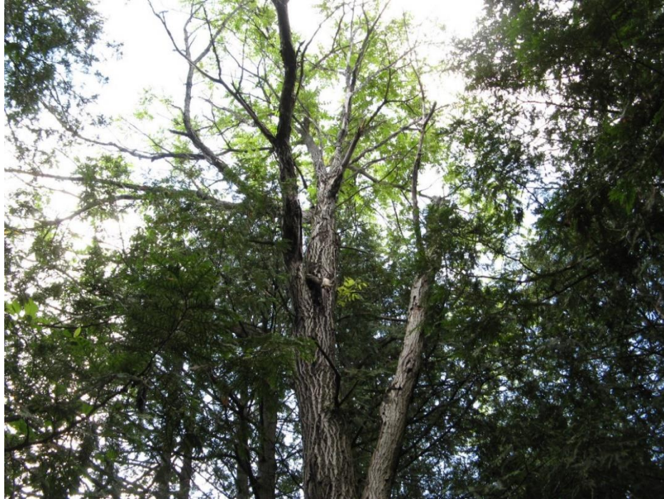
Photo 8 - Butternut assessed as unhealthy in the upland cedar coniferous forest in the south portion of the site, with view looking south