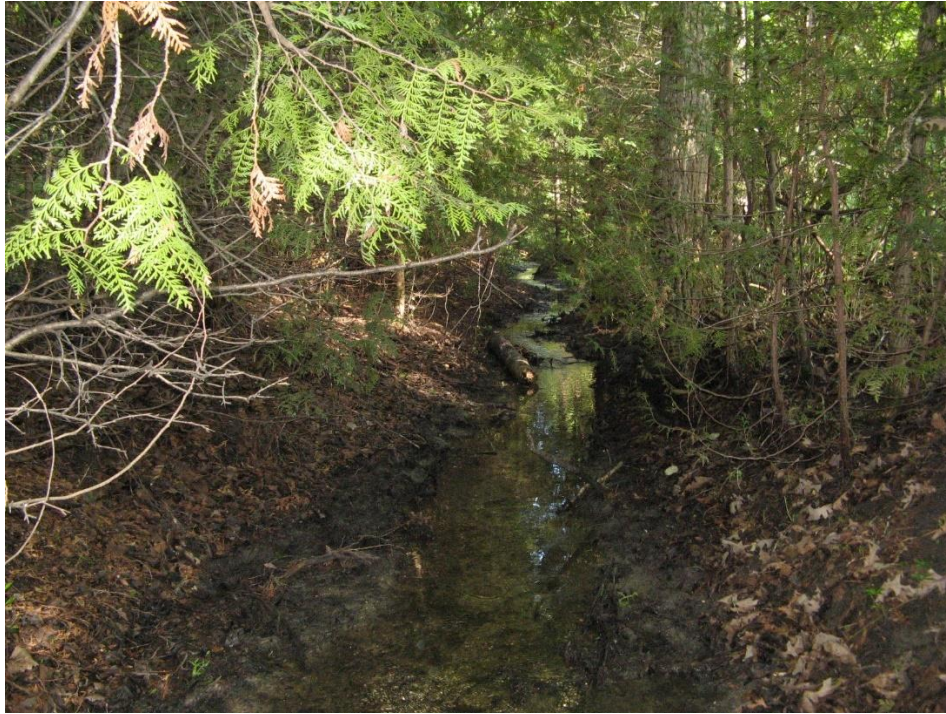
Photo 2 - North-south channel within forest cover in the southeast portion of the site. View looking north