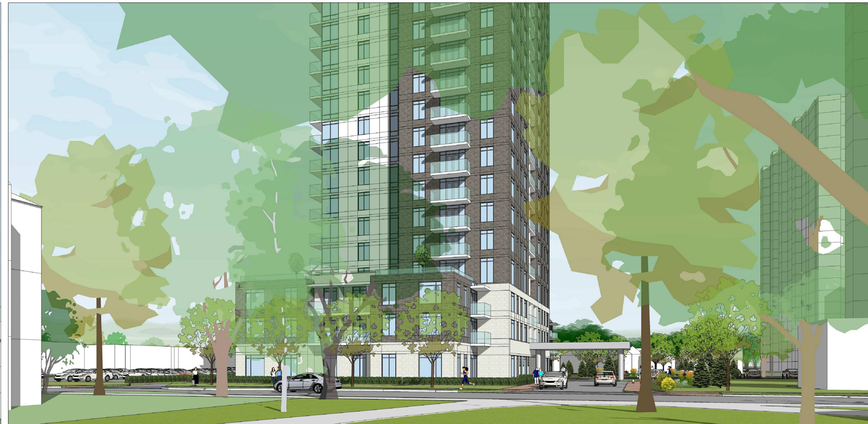
LOOKING NORTHEAST TOWARD THE BUILDING ENTRANCE