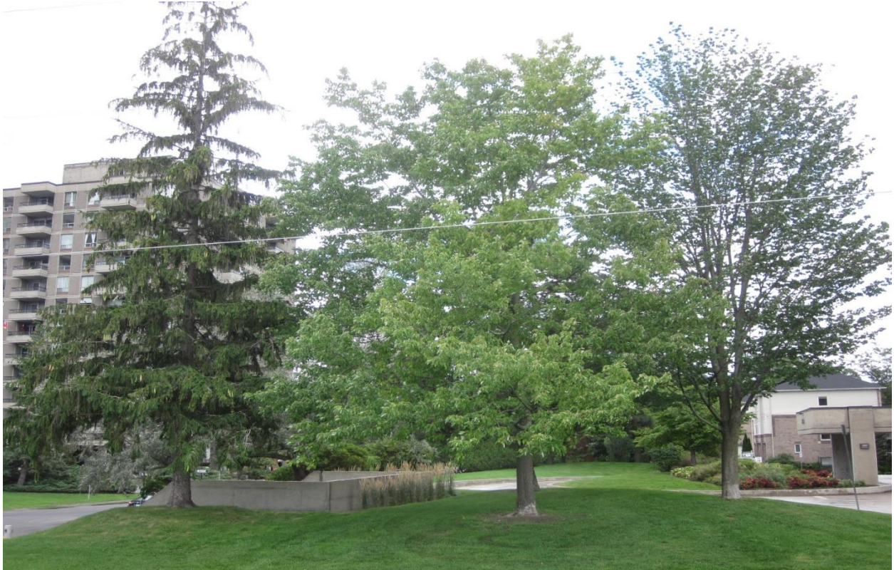
Picture 5. Trees #20, 21 and 22 (right to left) at 210 Clearview Avenue