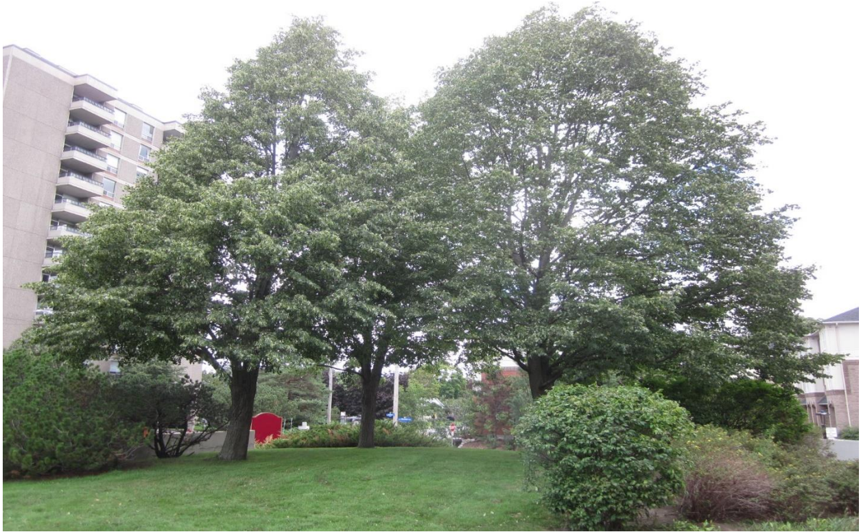
Picture 7. Trees #26 and 27 (foreground) and #28 (background) at 210 Clearview Avenue