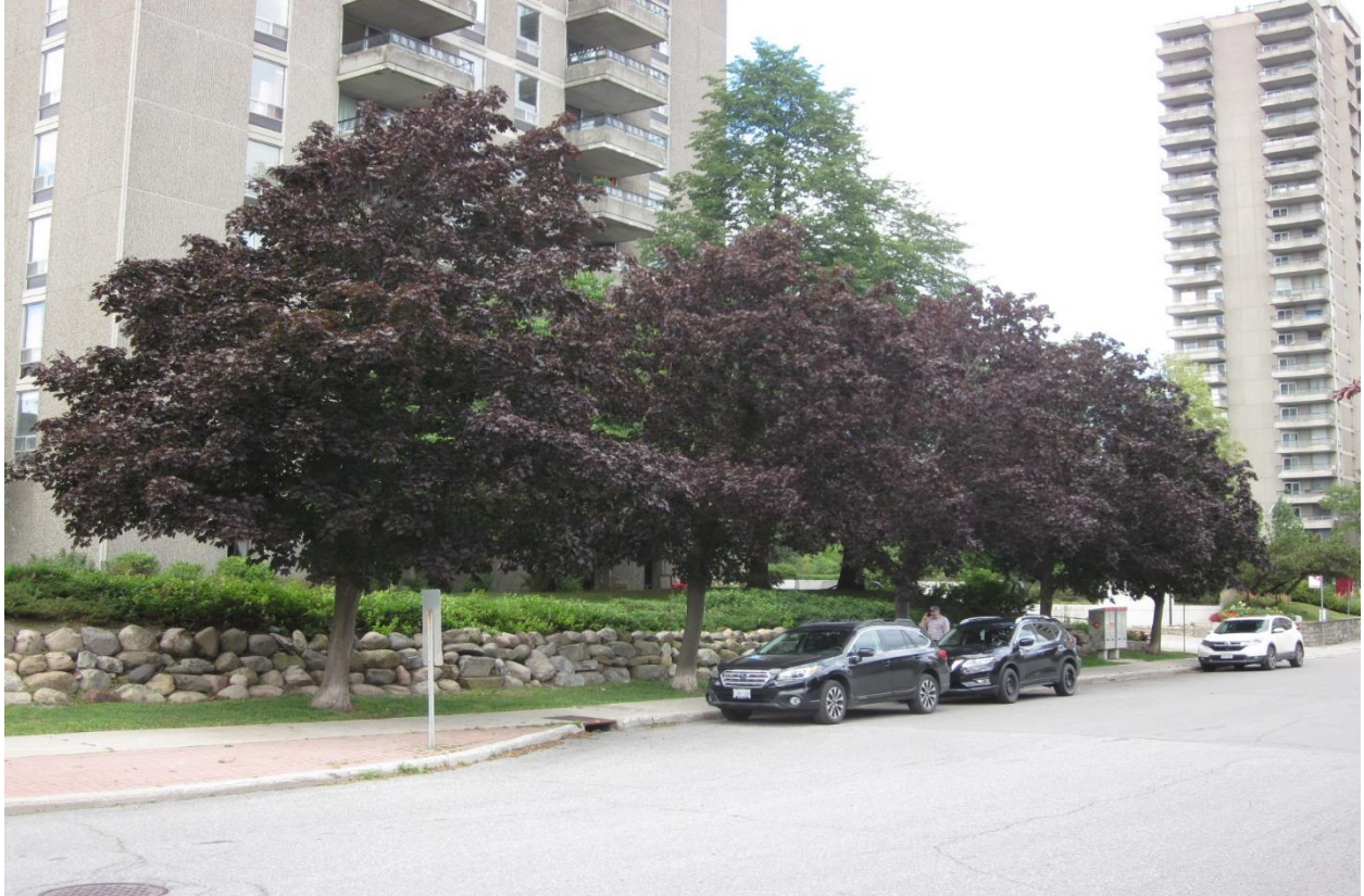
Picture 8. Trees #30, 32 and 35-37 (right to left) at 210 Clearview Avenue