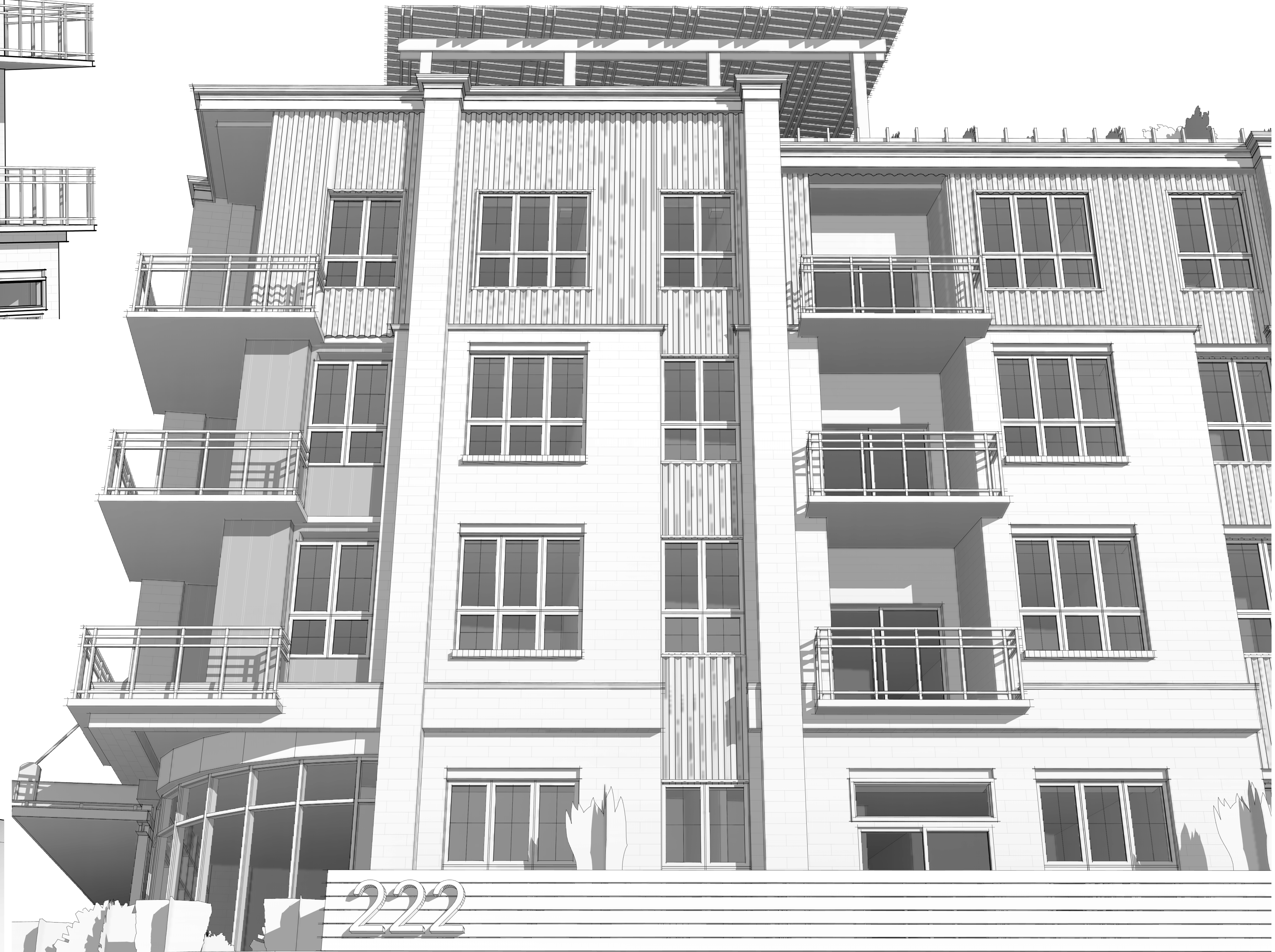
3 CORNER WALL RHYTHM