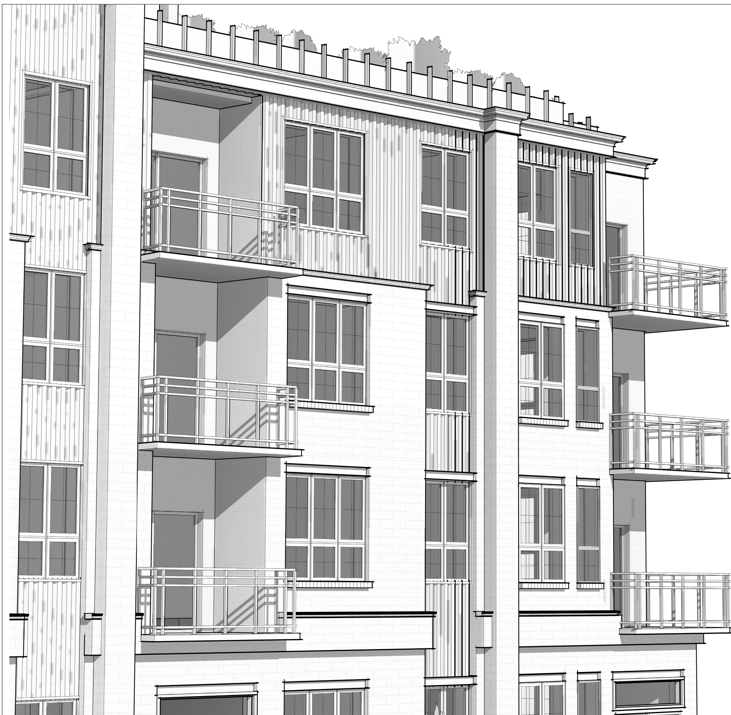
1 LEXINGTON TRANSITION