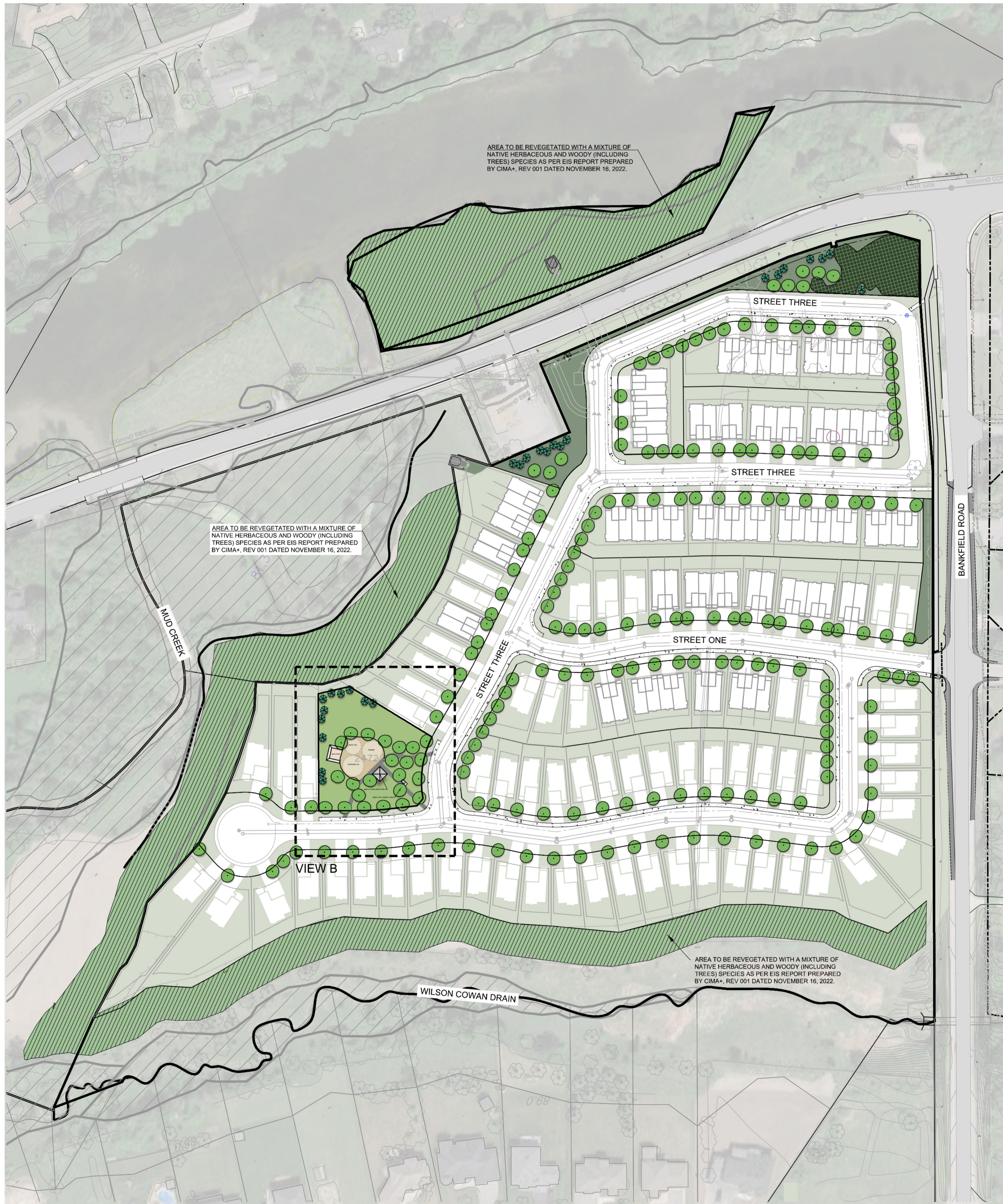
VIEW A- COMMUNITY GREENSPACE