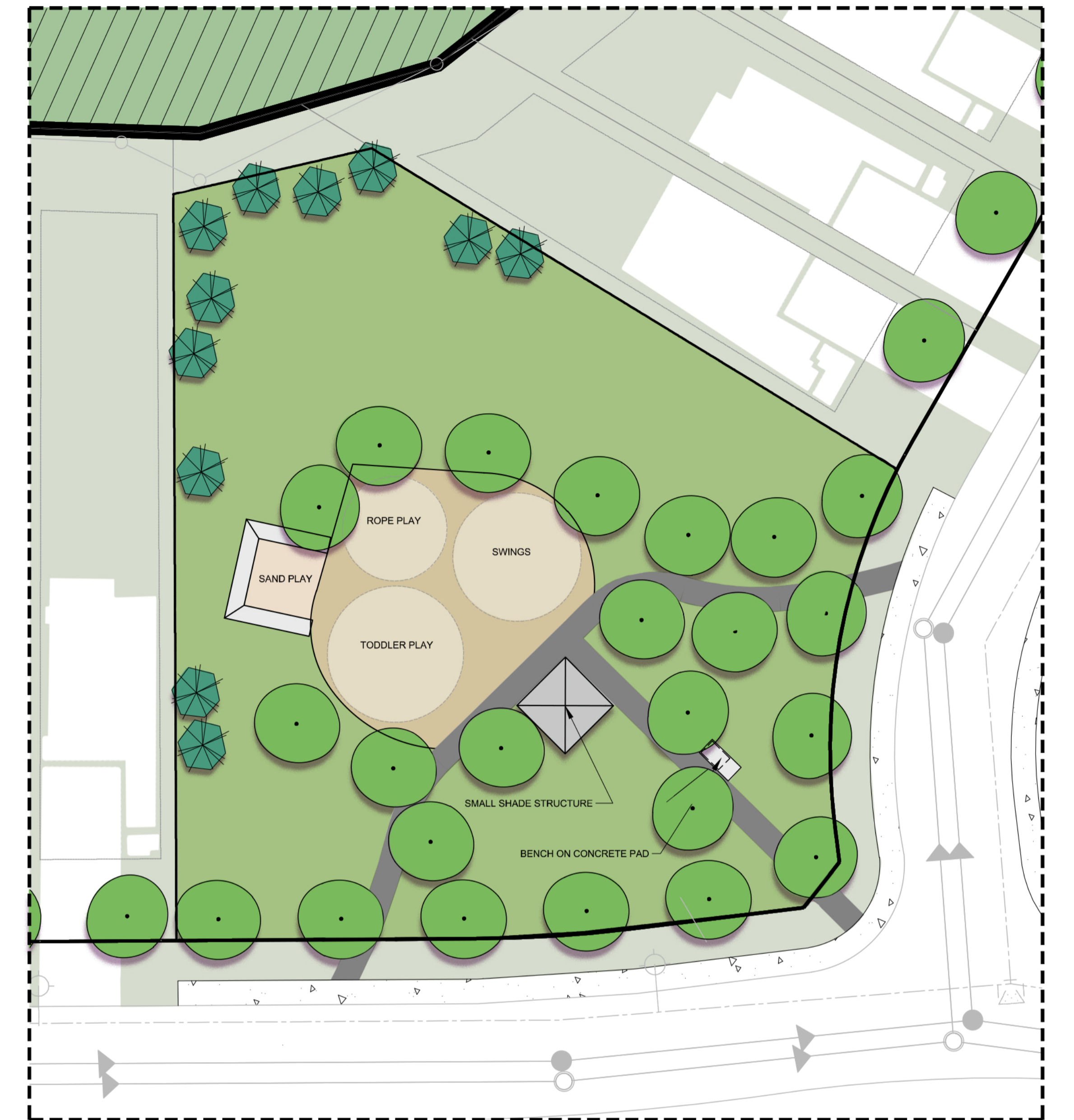
VIEW B- COMMUNITY PARKETTE