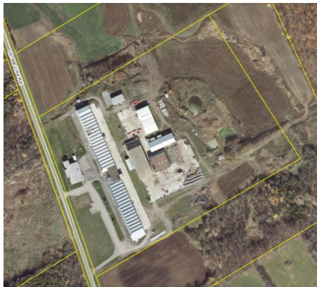
Figure 1 – Aerial View of the Subject Property

The subject property is located at 2545 9 th Line Road, falling in Part of Lots 19 and 20, Concession 9, in the Geographic Township of Osgoode (See Figure 1). A Topo Survey completed for the property shows the lands measure roughly 14.285 hectares in size with 335.7 metres of frontage on 9 th Line Road.