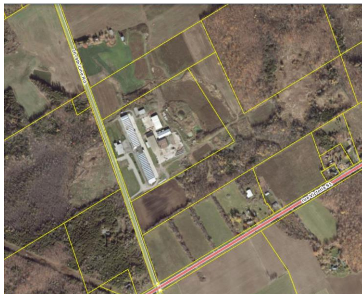
Figure 6 – View of the Property and Surrounding Uses

Per the sketch provided with this report open storage is proposed to the east (back) side of the timber / concrete block building. All open storage would be located behind the office building at the front of the property outside of any required front or corner side yard. Open storage in the area proposed could be supported based on the uses of abutting properties. There are no residential uses abutting to the north, east or south. A vacant T-shaped parcel of land wraps around the south and east sides of the property as seen in Figure 6. Lands to the north consist of a vacant parcel of land as well. Both parcels will be purchased by ASB Greenworld along with the subject property. Existing tree rows and vegetation on these vacant parcels will provide a buffer to nearby residential uses.