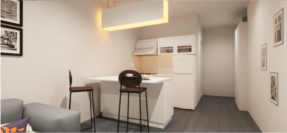
3D Rendering of Basement Unit for 112 Nelson