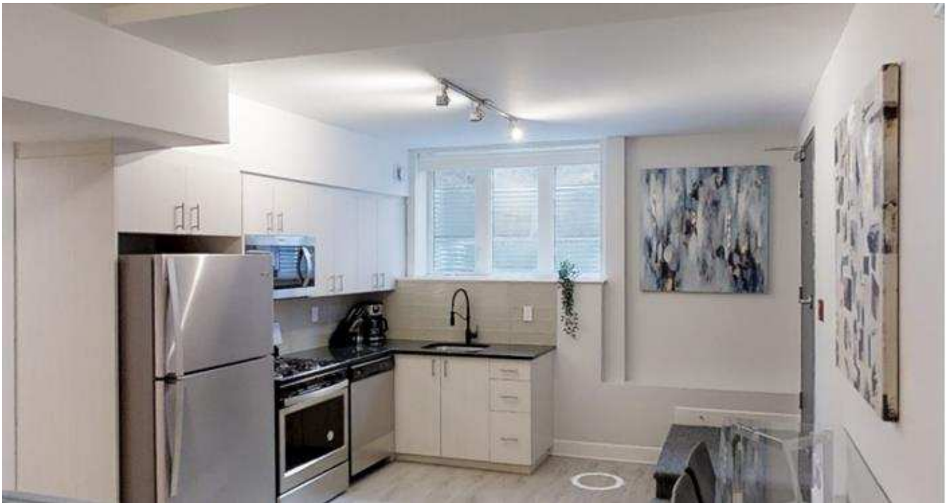
Figure 2 - Basement Unit Example (Unit 1 – 12 Jolliet Avenue)

Basement units are not new to Forum/SLP. Smart Living Properties (SLP) have several examples of like units in Ottawa which can be toured upon request. Understanding that staff do not have the time or resources for tours at this time, links are included in the conclusion of this letter to offer a visualization of these existing units.