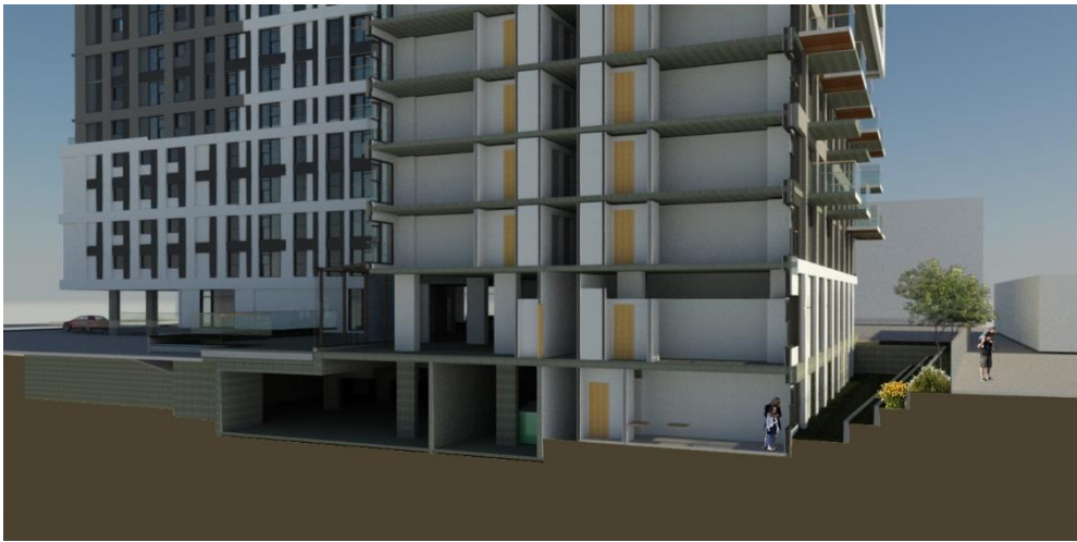
Cross-section of 112 Nelson (view north)