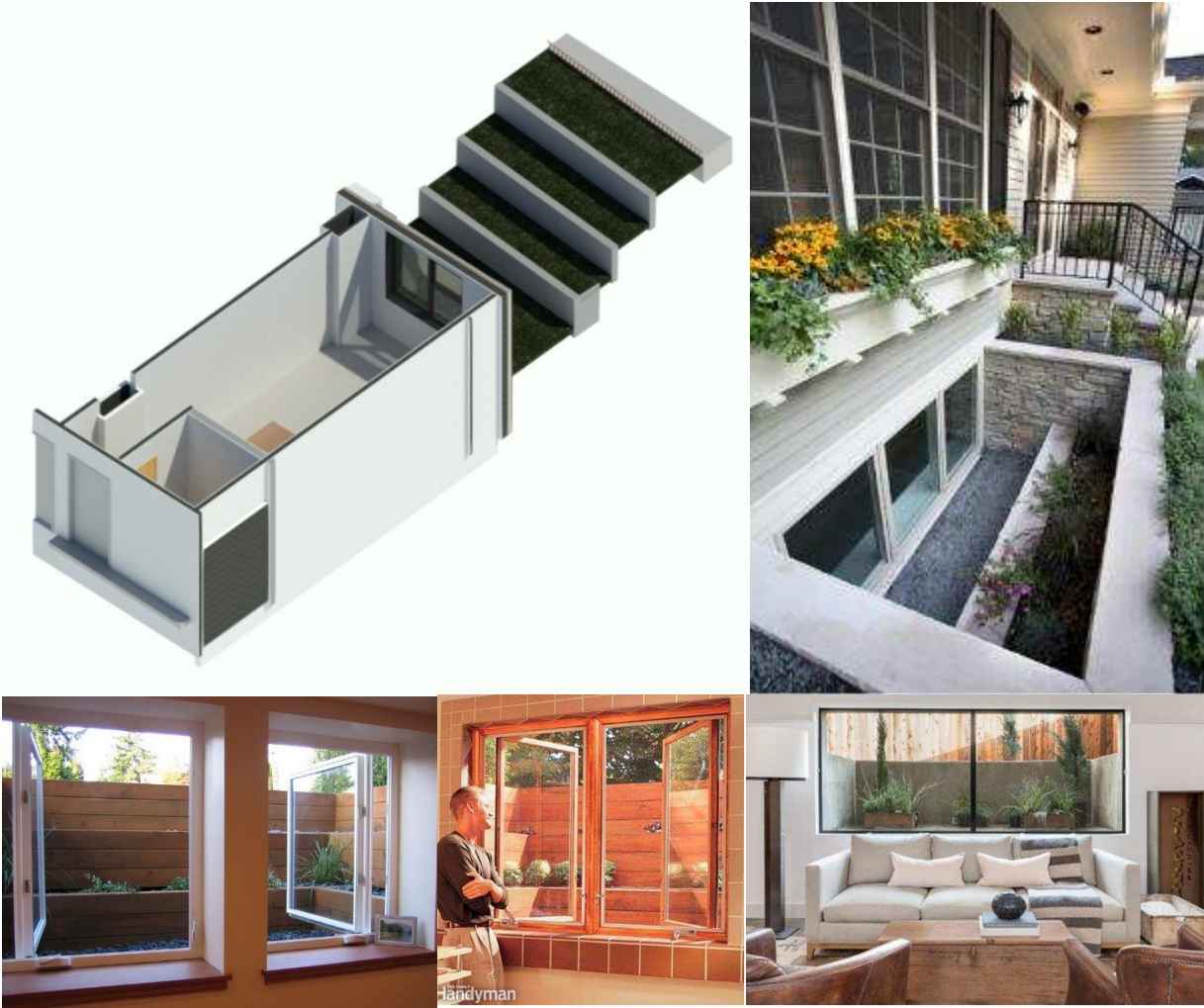
Window Well Terracing – Landscaping Inspiration