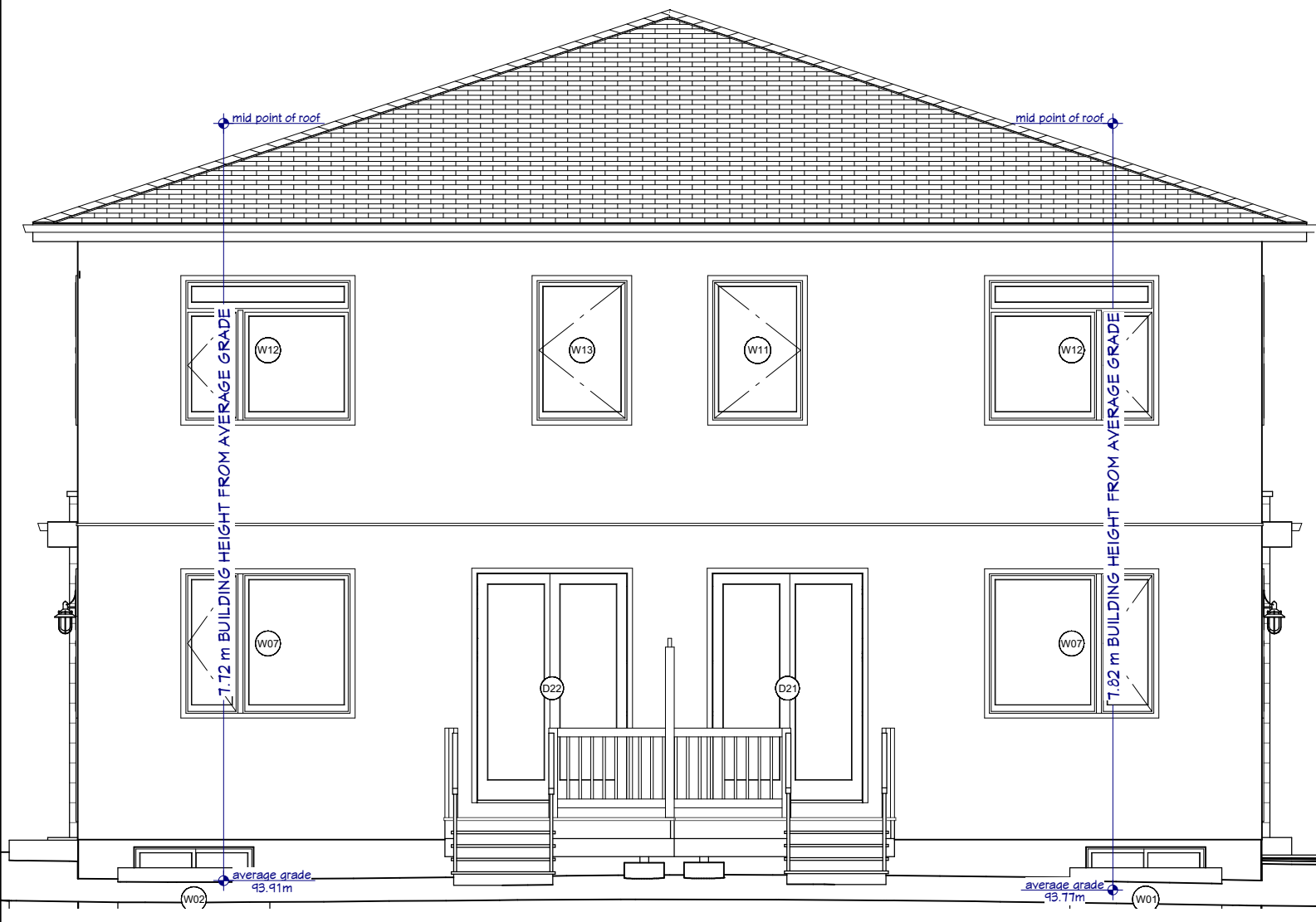
2 REAR ELEVATION A6 1:75

SCOPE OF WORK - New semi attached home(s)