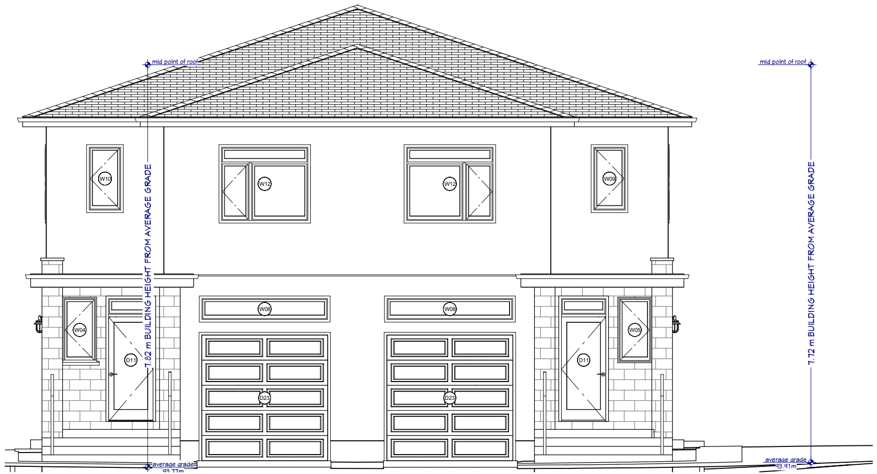
1 FRONT ELEVATION A6 1:75