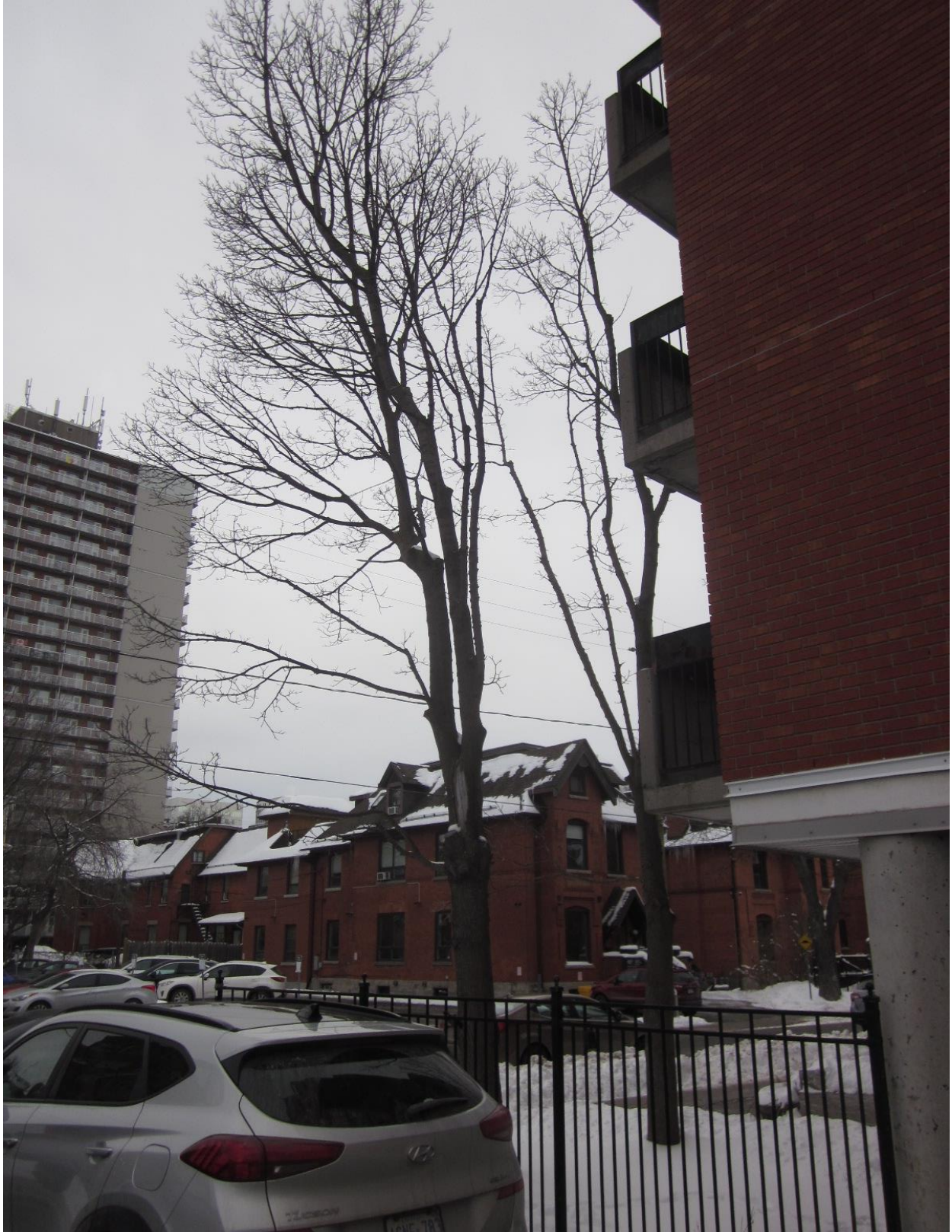
Picture 3. Tree(s) #3, neighbouring Norway maples adjacent to 381 Kent Street