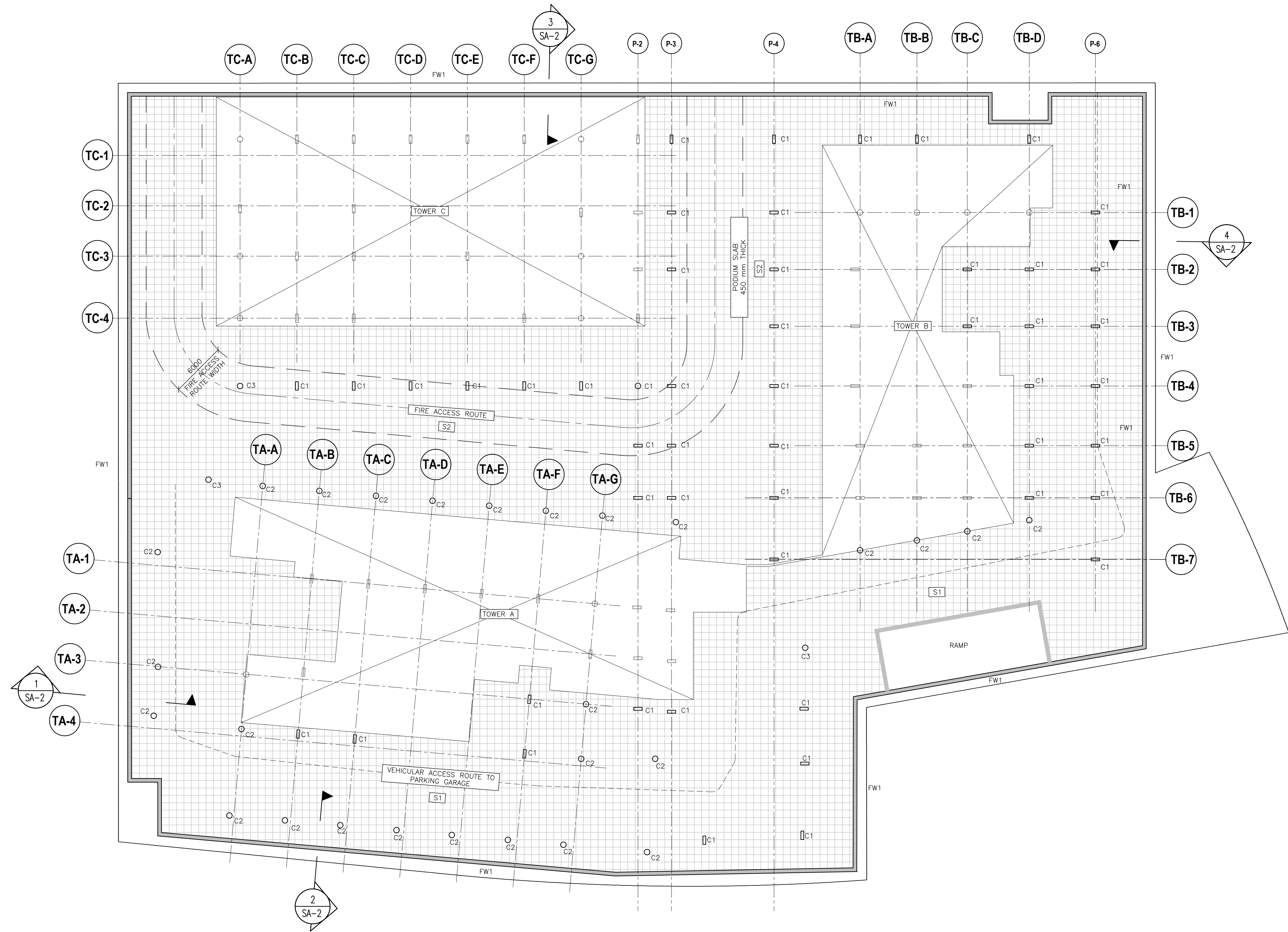
1 PARKING GARAGE P1 ROOF PLAN SA-1 1:250

THESE DRAWINGS ARE FOR INFORMATION PURPOSES ONLY. THESE DRAWINGS SHALL NOT BE USED FOR CONSTRUCTION.