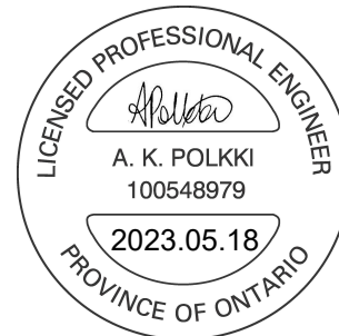
Structural Engineer's Seal

Practitioner's Name: Alaina Polkki Firm: RJC Engineers Phone#: 613-714-7000 City: Ottawa Province: Ontario