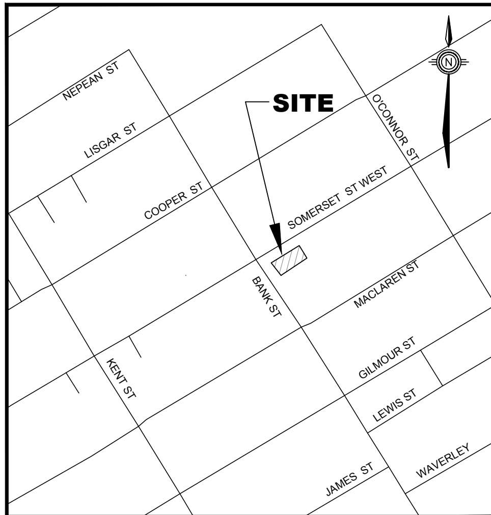
KEY MAP SCALE: N.T.S.