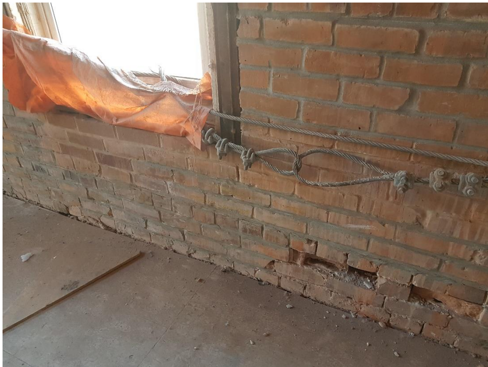
Photograph 10: Area of noted brick deterioration on the interior wythe of second floor, north wall.