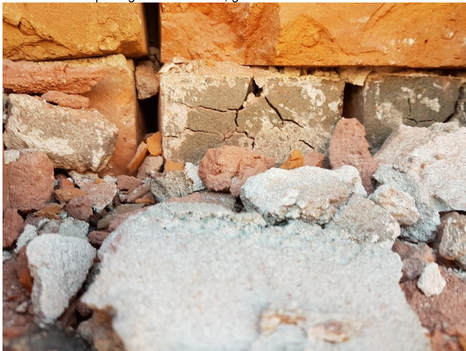
Photograph 14: Close-up view of the middle wythe condition. Mortar deteriorated, crack and crushed bricks. Opening on the exterior, ground floor of the north elevation.