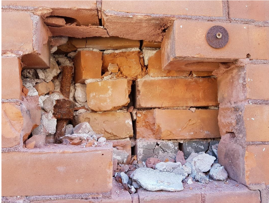
Photograph 13: View of the middle wythe condition. Mortar deteriorated, crack and crushed bricks. Opening on the exterior, ground floor of the north elevation.