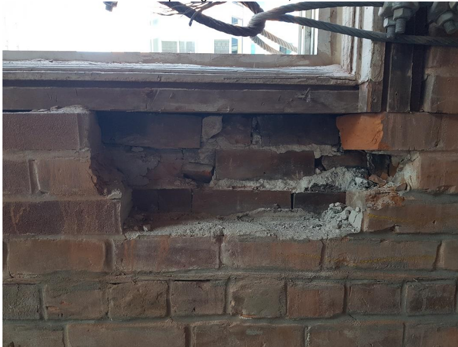
Photograph 12: View of the middle wythe condition. Mortar in poor condition and some cracked bricks. Opening on north wall, second floor (below window to extract middle wythe).