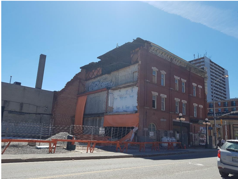
Photograph 6: View of the east elevation. Area is fenced off with restricted access.