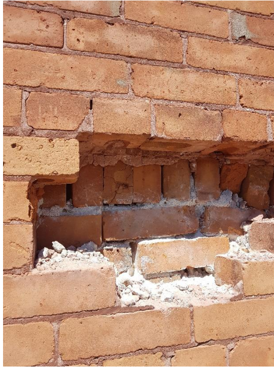
Photograph 11: View of the middle wythe condition. Mortar in poor condition and some cracked bricks. Opening on south wall, third floor.