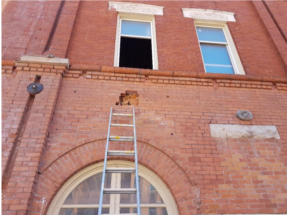
Photograph 3: Test sample extraction area of the exterior wythe on the ground floor of the north elevation.