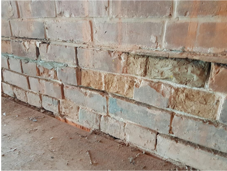
Photograph 9: Area of noted brick deterioration on the interior wythe of second floor, north wall.