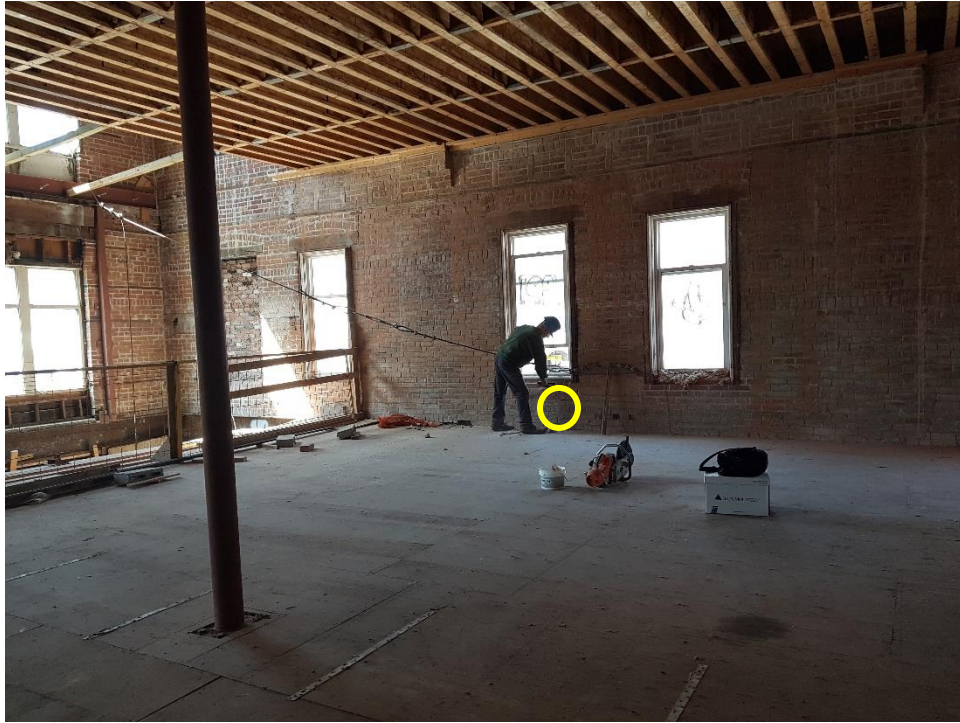
Photograph 5: Test sample extraction area (below window) of the middle wythe on the second floor of the north elevation.