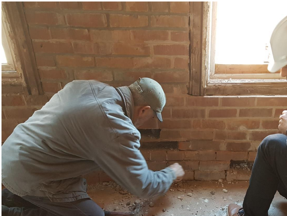
Photograph 2: Test sample extraction from the interior wythe of the second-floor north wall.