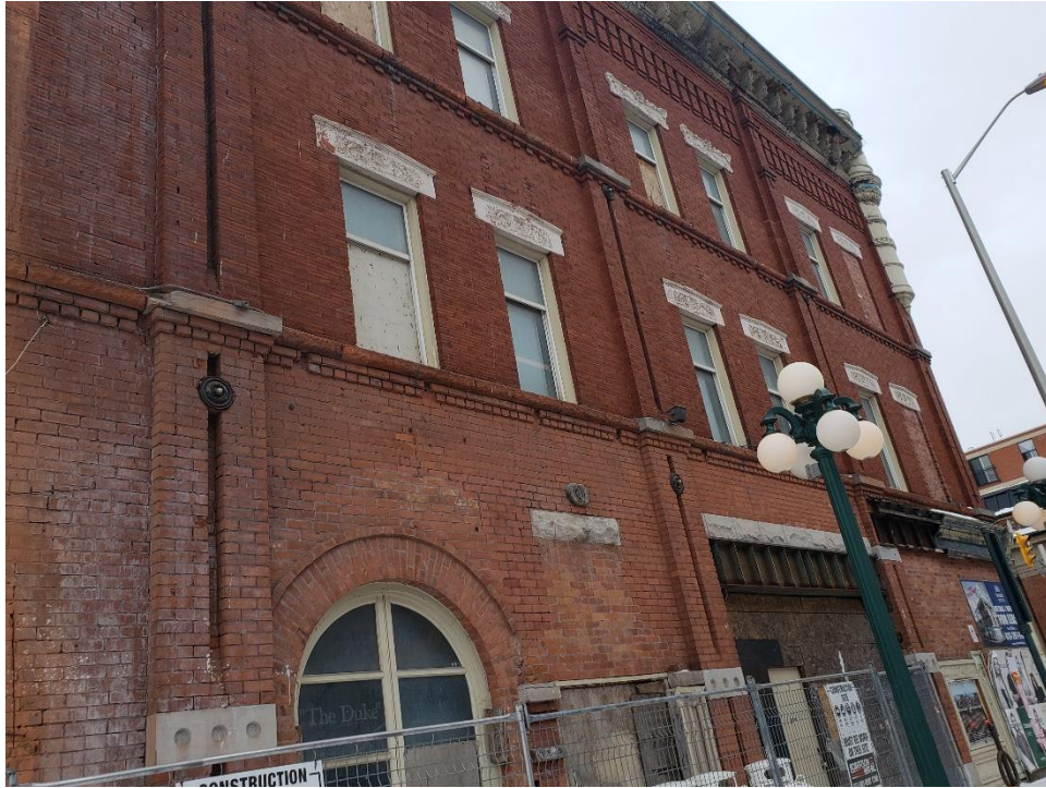
Photograph 7: Example of various brick vintages and in-filled openings.