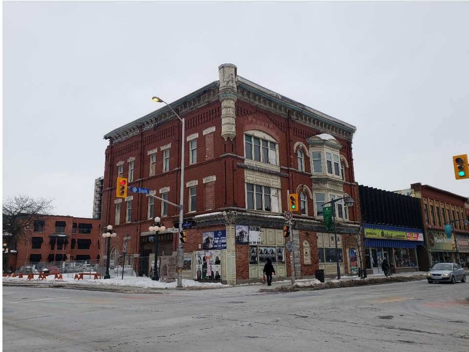
Photograph 1: View of the Somerset House, corner of Bank Street and Somerset Street.