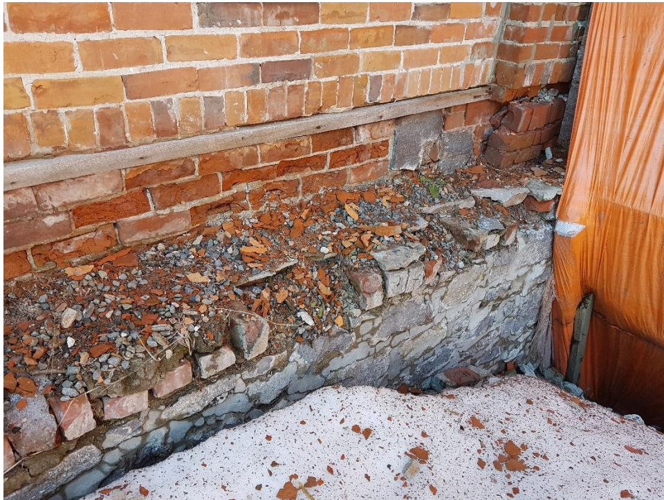
Photograph 8: Area of severe brick deterioration on the south wall (above foundation wall).